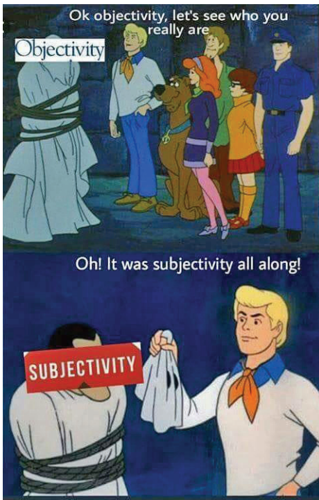
Figure 15.2. Scooby-Doo: Objectivity as subjectivity all along ( https://knowyourmeme.com/photos/1347333-scooby-doo )

But since the revelation described above slowly but steadily drips into our common consciousness, judgment ceases to be solely an indicator of quality, but also, and sometimes first and foremost, becomes a self-revelation, a self-disclosure of the judges themselves.