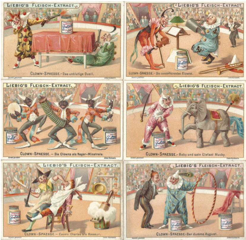
Figure 7.2. Clown gags: The clowns as N**** minstrels (1903)

company included dozens of African Americans who filled out the choir and comic interludes, but many reviewers did not notice that the Black characters were all played by white actors in makeup. When this was revealed, however, it did not cause any scandal. 48 In all of the cases above, there is no evidence that audiences were as naive about or outraged by blackface deception as the legend of the swindled audience would have it.