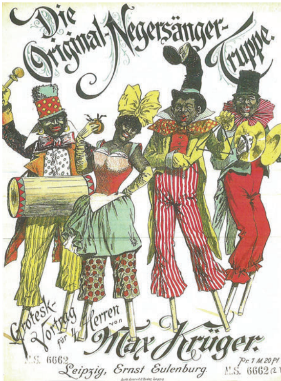
Figure 7.3. Max Krüger, The Original N****-Singer Troupe (1891), Österreichische Nationalbibliothek

guide to help Germans pronounce the unfamiliar words. Left with just the score, we would have to speculate about how this was to be performed, but thankfully Krüger provided both a dramatic cover illustration and brief instructions. The illustration shows the four male performers—including one in drag—in blackface. They are dressed as clownish Hosenn 59 (literally, “pants-wearing n****”), caricatured Black dandies who conspicuously fail at achieving the norms of respectable European dress. 59 They wear stilts for reasons unconnected to minstrelsy, and they play instruments that are not conventionally part of a minstrel show but can be played with minimal skill. As Krüger explains, the show should start with