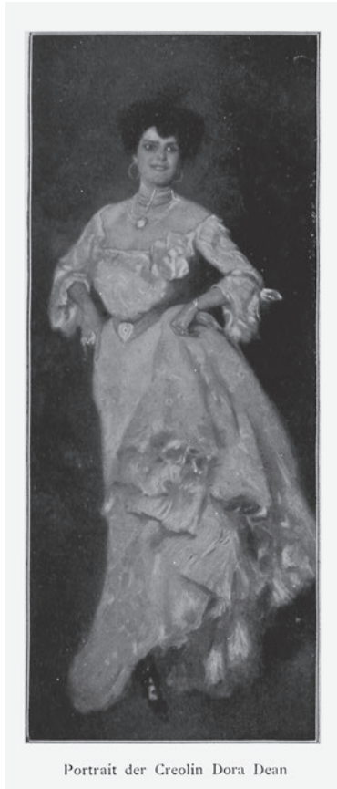
Portrait der Creolin Dora Dean

1893, included two blackface numbers in a collection of his greatest hits. 61 The first was entitled “Englisch: Imitation eines amerikanischen N****sängers” (“English: Imitation of an American N**** Singer”). On one level, the piece mocks the apparent incomprehensibility of minstrel lyrics: the verses are a mixture of English and pidgin German that includes syntactically nonsensical phrases and interjections. On another level, the piece offers a critique of American blackface as lowbrow culture: the lyrics revolve around a minstrel getting drunk, threatening to fight, and imposing himself on unwilling German ladies. With little bits of syncopation