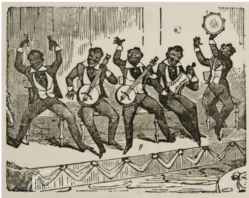
Figure 7.1. The Lantum Ethiopian Serenaders (ca. 1840s–1850s)

Britain successfully since 1846, but as the market for minstrelsy became increasingly competitive they sought opportunities on the continent. In the summer of 1847 the Lantums spent five months in the Netherlands before, in October 1847, beginning their German tour. Billed generically during their tour as “American N**** singers” 14 ( amerikanische