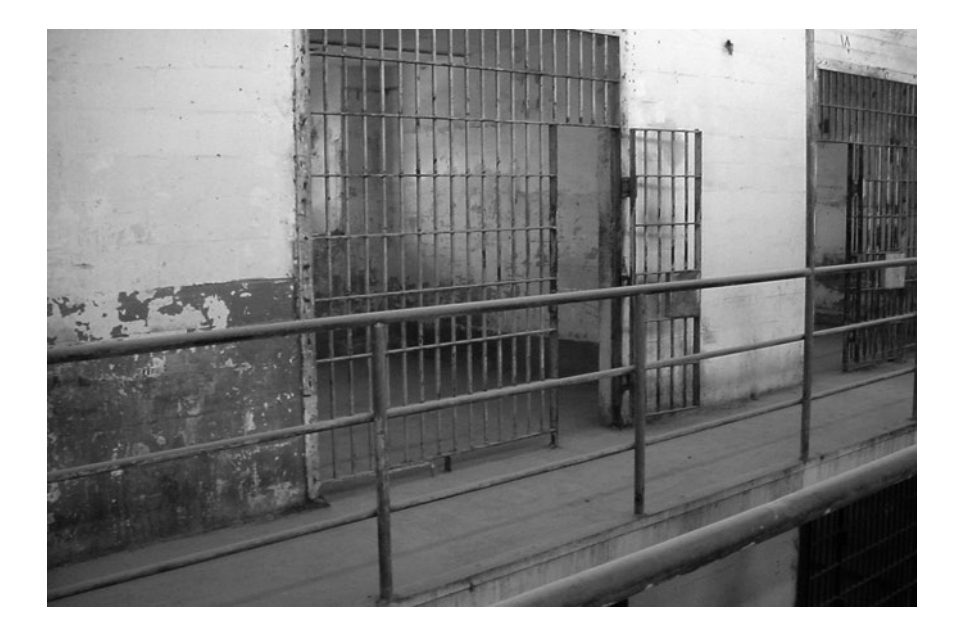
Figure P.2 Abu Ghraib prison cell