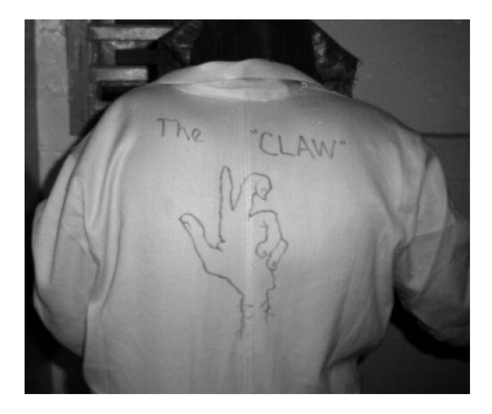
Figure 2.2 Detainee nicknamed "The Claw"