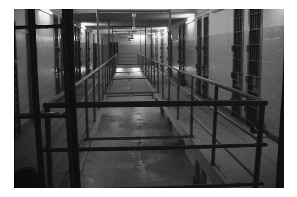
Figure P.1 Abu Ghraib Prison