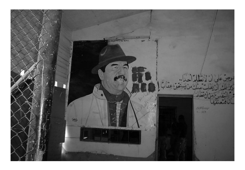
Figure 5.1 Graffiti in Iraq