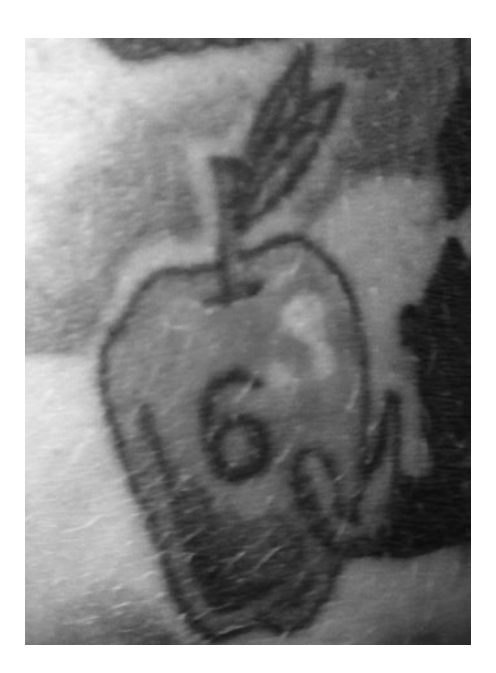
Figure 4.2 Harman tattoo, "rotten apple 6"

Note : Some of the soldiers charged with abuses at Abu Ghraib marked their bodies with variations of the "rotten apple" tattoo as a means literally to embody resistance.