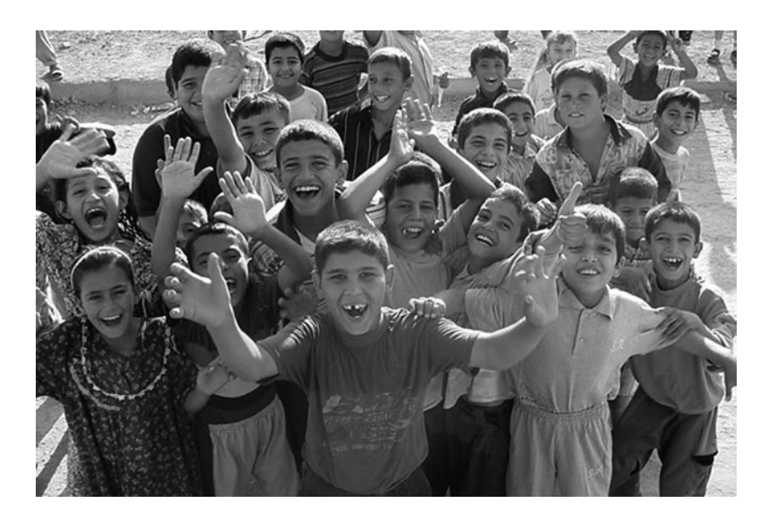
Figure 5.5 "Sabrina! Sabrina!"