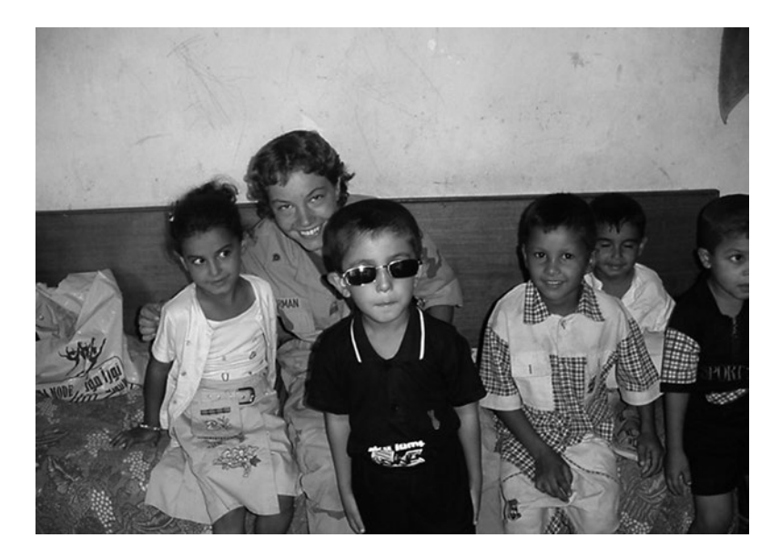
Figure 5.7 "Maternal Sabrina"