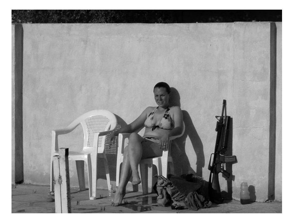
Figure 4.1 Female soldier in Iraq with bikini and rifle