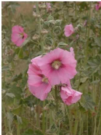
A. rosea flower (hollyhock) (Original)