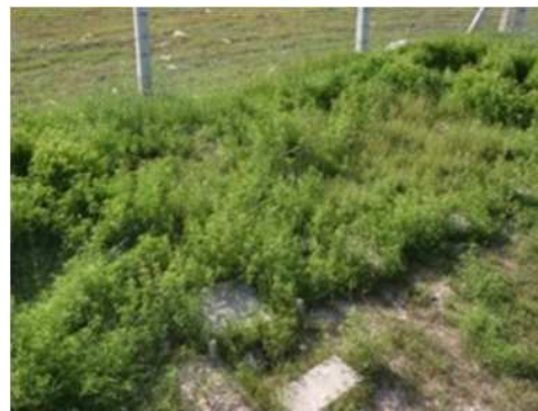
M. officinalis plant group in the plot (Original)