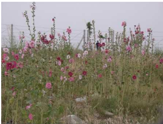
The first autumn in the study area