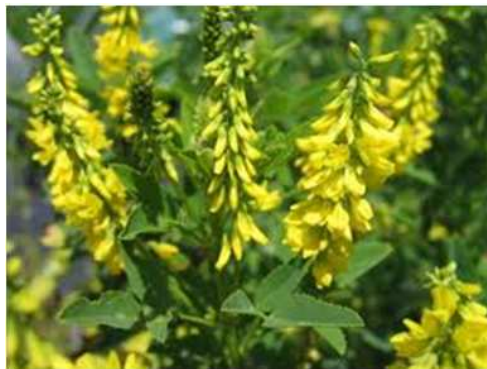
M. officinalis flower (yellow melilot)(Original)