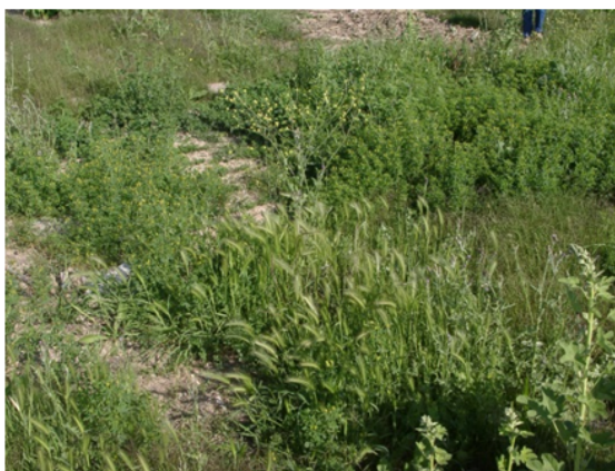
Lolium temulentum in the plot