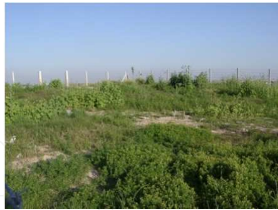
The second spring in the study area