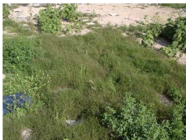
C. dactylon plot