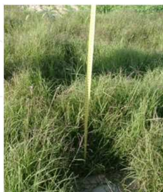
C. dactylon (Bermuda grass) (Original)