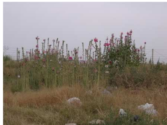
The second autumn in the study area