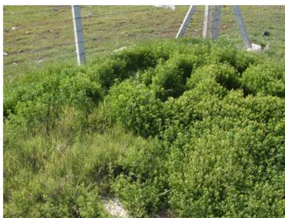
M. officinalis plot