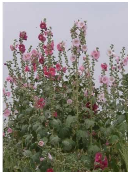
A. rosea plant group in the plot (Original)