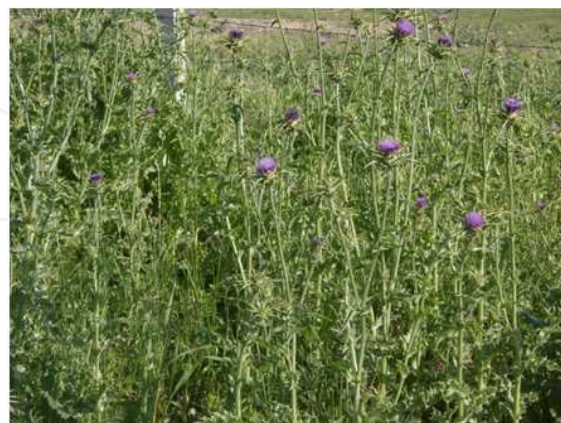
Silybum marianum in the plot