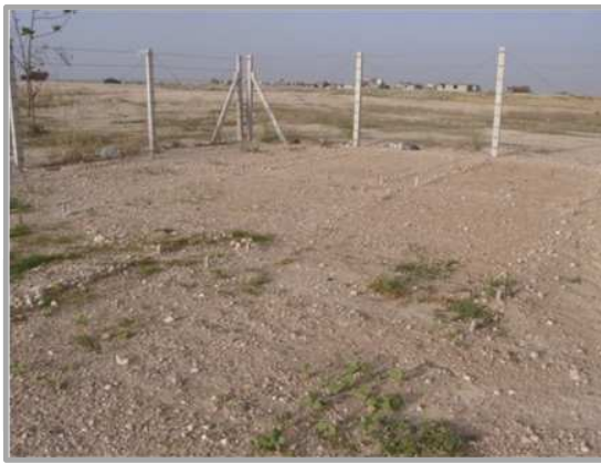
The first spring in the study area