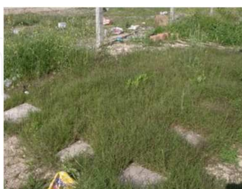
C. dactylon covering in the plot (Original)