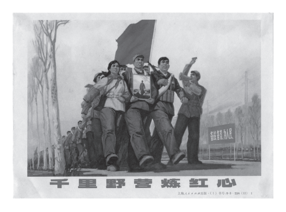
Figure 3. 千里野营炼红心 (To Go on a Thousand "li" March to Temper a Red Heart), 1971. From the personal e-library of Yuhan Huang per the Chinese Posters Foundation, Amsterdam.