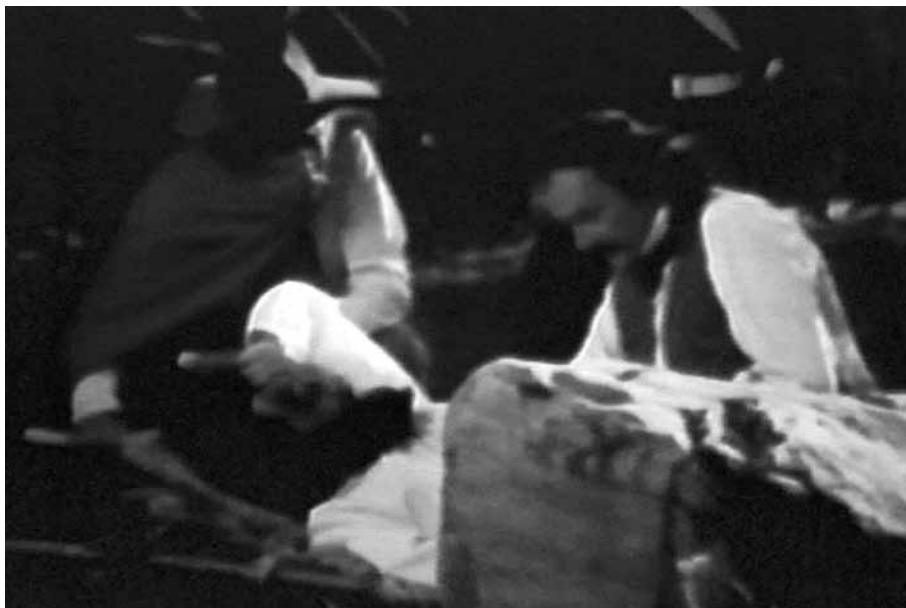
Güemes in his final hours.