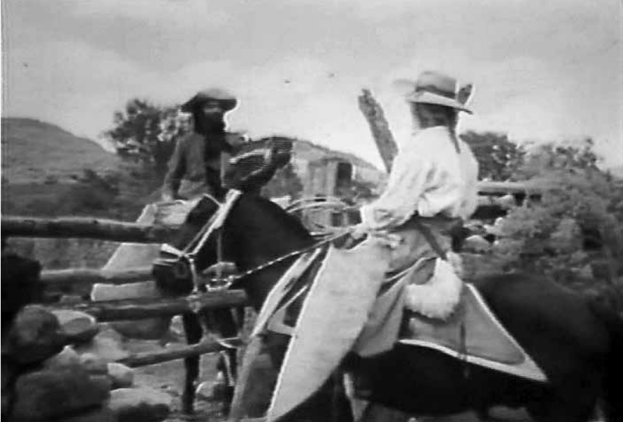
Güemes with Macacha.

in Tucumán to report the disparaging rumors about him that are circulating in Salta. 19 Later, she crosses enemy lines to pass him information about the Spanish army. In a third scene, she rides at night to report to Güemes about the retreat of de la Cerna's troops even though she is pregnant and not feeling well. Macacha acts as her brother's eyes and ears when he is not present and complements his work. Like her brother, she relates to the locals, helps the poor, and cheers up and encourages wounded soldiers. Her diverse roles speak to adaptability and service on the home front. Her riding alone and crossing enemy lines, her initiative to gather and relay information, and her words in favor of the liberation all contribute to characterizing her as being as firmly committed to the independence cause as her brother. However, in one scene, when she displays too much resourcefulness, her brother reminds her of the need to obey his orders and continue with her not-very-glamorous-yet-essential tasks of taking care of the injured, feeding the children (future soldiers and/or citizens), and mending the gauchos' ponchos. These traditional female chores are considered by Güemes to be essential to the war effort and remind viewers that the fighting affects everyone: not only the soldiers who participate in the battles, but also the wider community, those who nurse the wounded, bury the dead, and help reprovision the troops.