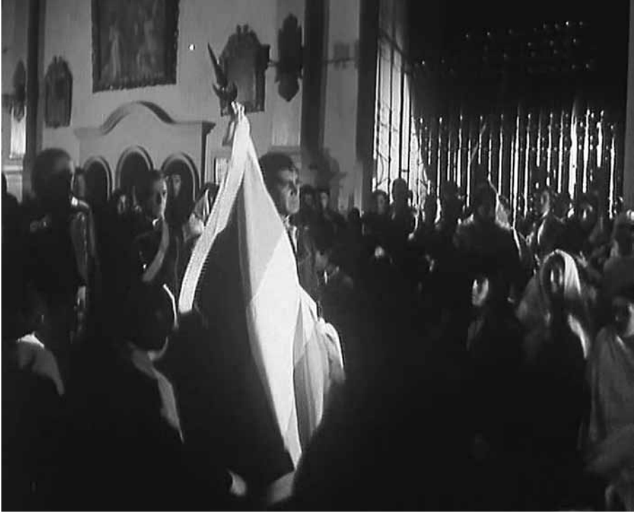
Belgrano entering church with Argentine flag.