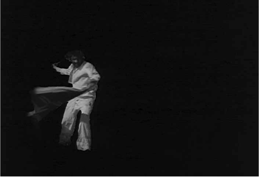
Juan Moreira's closing scene.

from the plain (slow motion, frontal shots) also stress that he is seen, rather than given the opportunity to let his voice be heard.