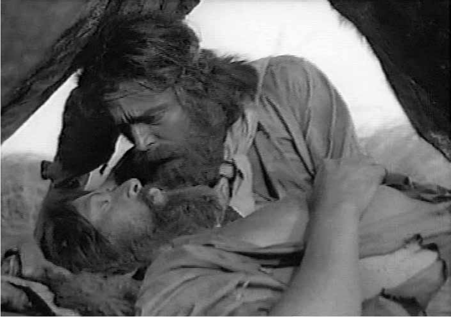
Martín Fierro and Cruz in the toldería .