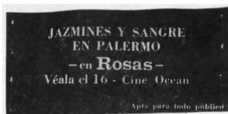
Revista Clarín , 13 March 1972.

Three days after the film's release, promotional ads appeared in the most important Argentine dailies, La nación and Clarín . Both had a black background but with different messages: in the former, 'Jazmines y sangre in Palermo' [Jasmin and blood in Palermo], in the latter, 'Rosas-Manuelita: lo que nunca se pudo decir' [Rosas-Manuelita: what could not be said before].