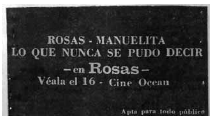
La nación , 13 March 1972.