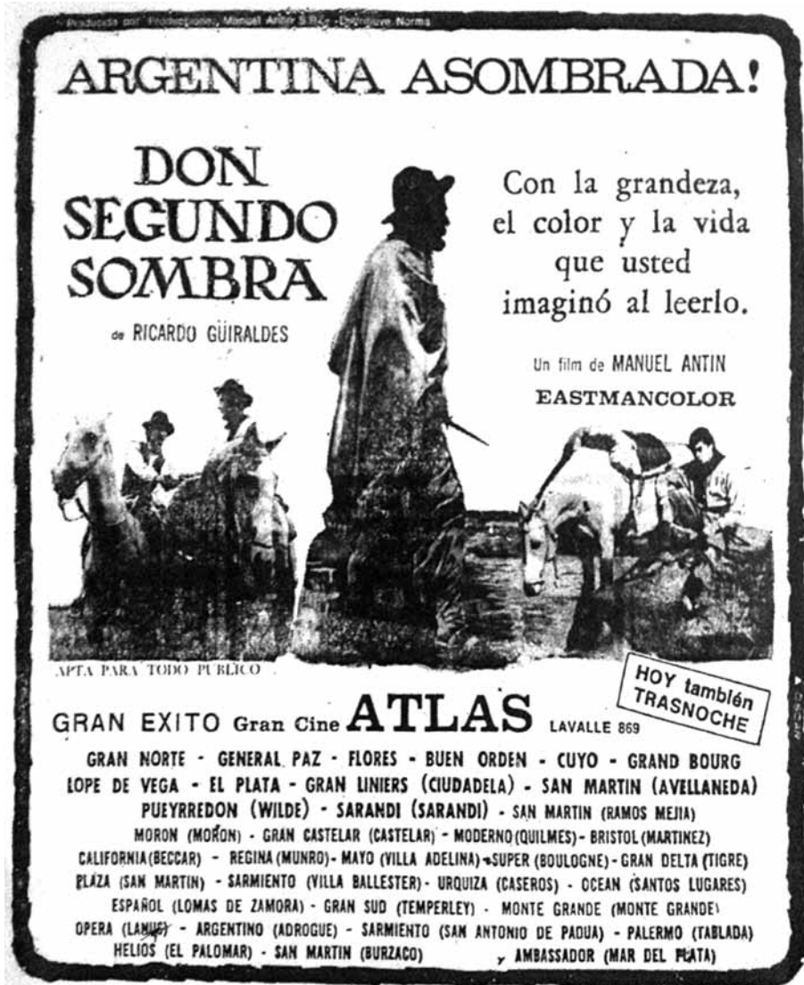
Promotional ad of Don Segundo Sombra .

[ends at the moment when I decide to make Don Segundo Sombra , which is no longer a solitary work, but rather a little foreign because of its problems, conflicts, and development. Curiously, I discover that in separating it from me, I produce my best work] (Sández, 2010, 14)