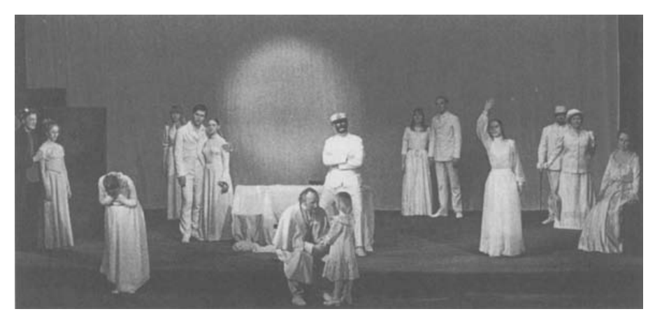
The Fairhaven scene in the 1970 Dream Play production. The Poet, in dark clothes, was visibly kept apart from the white-clad holiday makers.

In Bergman's reduced version there was no burning castle to be seen at the end. Instead, there was a purely symbolic fire: a large, nonfigurative, red design on a screen. No doubt meant to activate the spectators by presenting them with an enigma, this design by scenographer Lennart Mörk was variously interpreted as "the burning castle of the dream," "the human circulatory system," "flickering flames from the earth's interior," and "the inside of the eyelid as we see it when we doze off."<sup>13</sup>