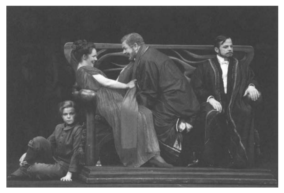
The troubled quartet in the opening of The Winter's Tale : Mamillius was anxiously eavesdropping on his parents Queen Hermione and King Leontes, while King Polixenes jealously looked the other way. Hermione's erotic 'strangling' of her husband was strikingly similar to Nora's 'strangling' of Rank in A Doll's House . Both women were played by the same actress.

Confirming his intention to return to his own Bohemia the following day, Polixenes had been provided with a red guest book in which he had just finished writing. The book was handed over to Hermione. After a while Leontes snapped the book from her, looked into it, and abruptly closed it. Hermione, declaring her love for her husband, put her arms around Leontes' neck, while imploring Polixenes to stay with them for some time. Leontes opened the book again and continued to read, then suddenly got up, threw the book on the sofa and left. Here was suggested that Polixenes had praised Hermione in writing to such an extent that Leontes' jealousy, aroused already by her intimacy with his friend, was kindled.