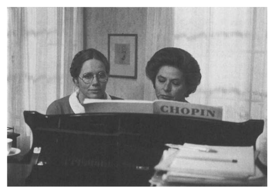
Autumn Sonata: The internationally renowned pianist Charlotte demonstrates to her frustrated daughter Eva how Chopin should be played.

family. An egocentric escape from responsibility and human kindness has mingled with a need to get away from the false words to the truthful music.