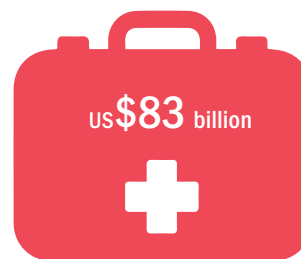
Estimated global value of TCM in 2012