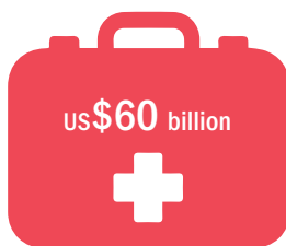
Estimated global value of herbal medicines in 2003