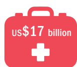
Estimated value of herbal medicines in the US in 2000