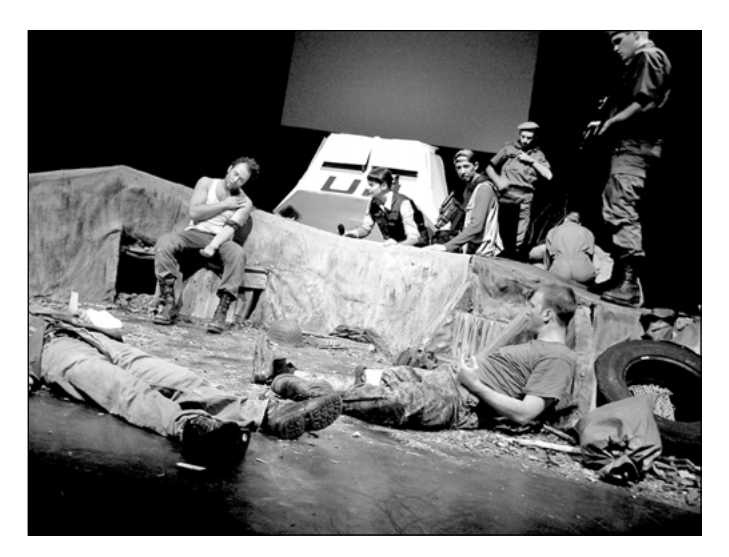
Figure 9: 'No Mans Land' Das Kunst, Garage X, Vienna, 2006.