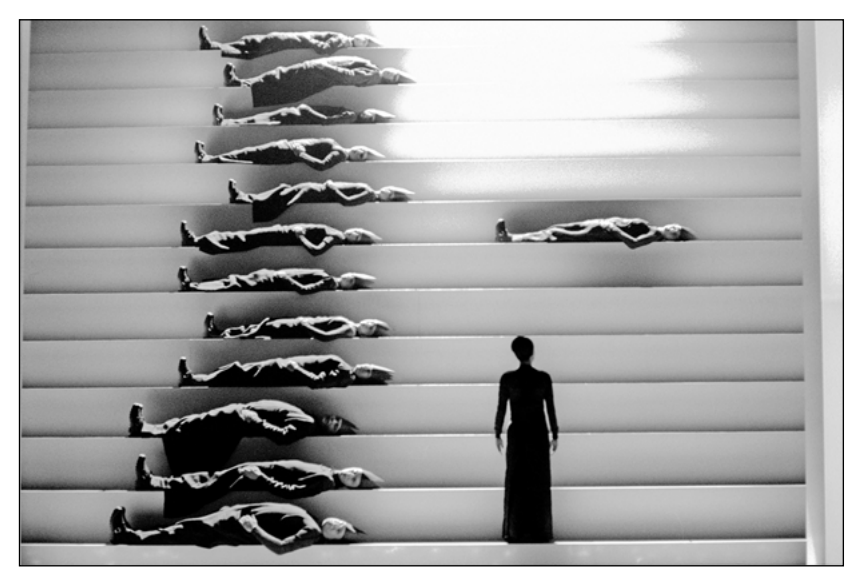
Figure 2: 'Hotel Pro Forma', Kirsten Dehlholm, Kampnagel, Hamburg, 2000.