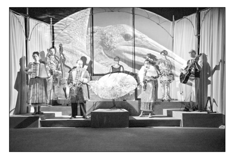
Figure 3: 'Die Harmonie der Gefiederten'/'L'Harmonie de la Gent à Plumes', AGORA Theater, St. Vith, Belgium, 2014.