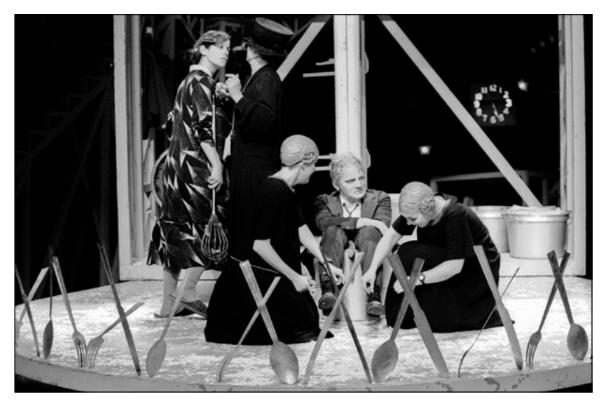
Figure 8: 'Planet Lulu', Michel Laub/Remote Control, Kampnagel, Hamburg, 1997.

An additional type of European theatrescapes – and its significance for the development of alternative contemporary, postmodern theatre forms can be