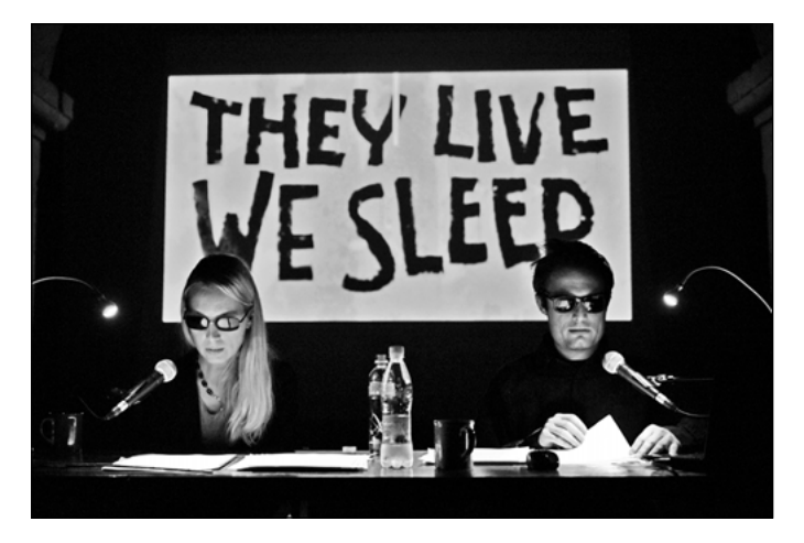
Figure 7: 'They live (in search of text zero)', Gledališče Glej, Ljubljana, 2011.

annual theatre festival Borštnikovo srečanje in Maribor and at the Beogradski Internacionalni Teatarski Festival (BITEF) in Belgrade. It was at this event that Pelević and Marković were surprisingly given permission to hold the lectureperformance on the premises of the Belgrade city council. On this occasion, the authors added a venue-related prologue and epilogue to their performance.