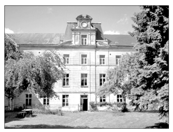
Figure 4: PAF, 2006.

This sort of specific opening up towards a field means contributing to the constitution of that field.