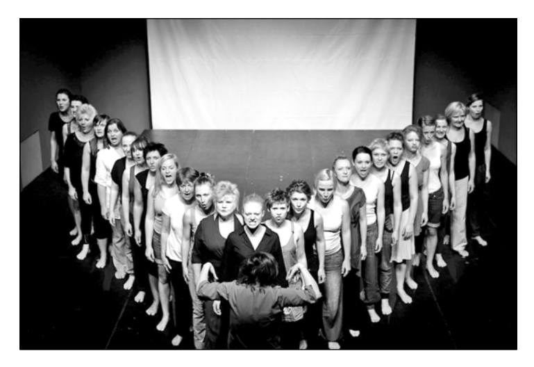
Figure 8: 'Magnificat', Instytut Teatralny, Warsaw, 2011.

words. It is a post-opera which makes a polyphonic, pocultural [ sic !] Magnificat possible.'<sup>168</sup>