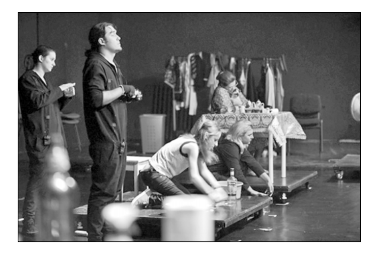
Figure 4: 'Romania! Kiss me!', Teatrul Național, 'Vasile Alecsandri' Iași. Bucharest, 2010. Photograph: Catalin Gradinariu

and, quite incidentally, also provide narrative comments on the plot.'<sup>143</sup> The orchestra assumed a number of different tasks. Its sounds accompanied the appearance of the individual figures, the meeting and the failure of the three protagonists. Furthermore, the orchestra was always present. For the audience, the orchestra visually defined the stage area, assumed minor roles, and revealed the theatrical process.