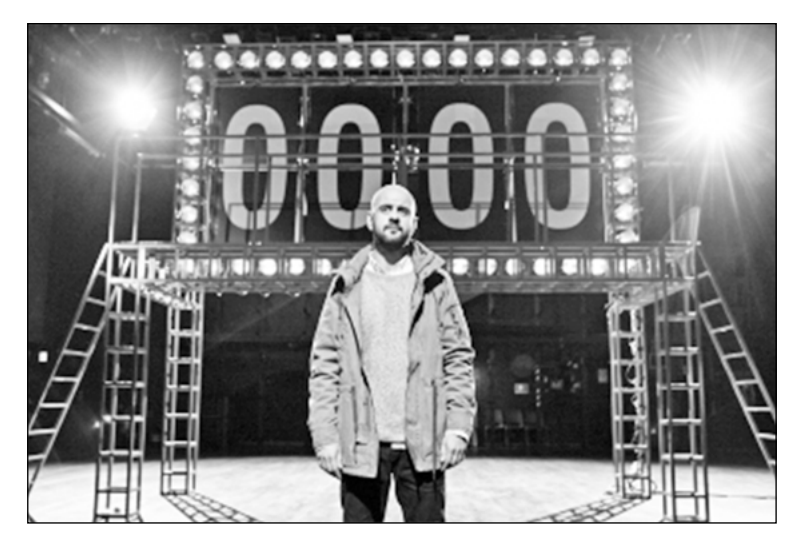
Figure 6: 'Jag ringa mina bröder', kulturhuset stadsteatern, Stockholm, 2013.