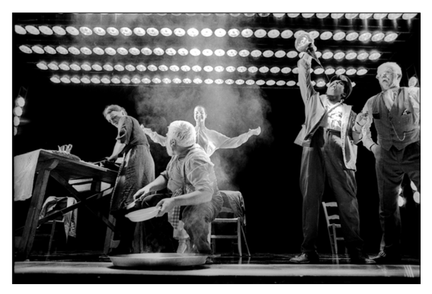
Figure 3: 'Accions', La Fura dels Baus, Kampnagel, Hamburg, 1986.