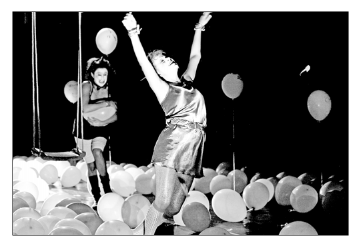
Figure 1: 'Leonce und Lena', Theater Marabu – Junges Ensemble, Bonn, 2012.

Apart from such in-house talent promotion programmes of individual independent groups, there is occasional support funding, especially in the form of grants to young artists which are intended as a kind of 'start-up help'. Thus, it is possible for independent young artists in the state of North Rhine-Westphalia to receive a lump sum scholarship of five thousand euros for a period of four months in order to work and do research in connection with an established children's and young people's theatre. Such support programmes do not by any means indicate the presence of any type of structure in this respect, and are not the rule but rather a positive and regionally limited exception.