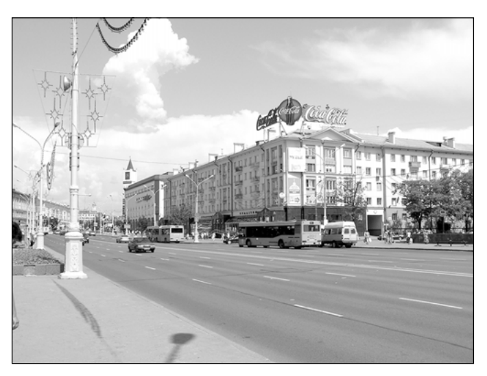
Figure 3: Minsk, 2013.

lyev project an image of cleanliness, order and security, and there are active subcultures. However, the population lives under a dictatorship. The country is internationally isolated, censorship is harsh, and the omnipotence of the state security organisation, KGB, is intimidating.