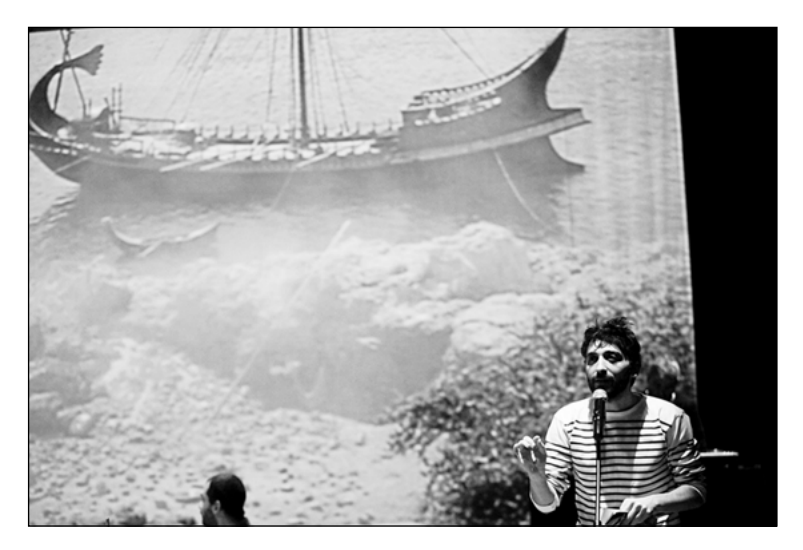
Figure 4: 'Telemachos - Should I stay or should I go?', Ballhaus Naunynstraße, Berlin, 2013.