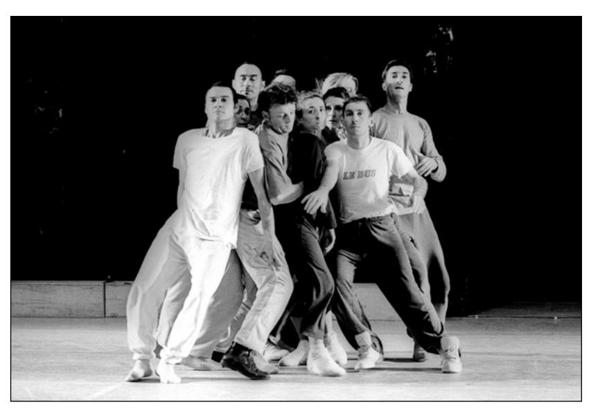
Cultural Modernisation of the 'Grande Nation' - France

Independent groups established in the sixties also turn against these structures, but they soon enough receive public funding: 'The work of independent groups pursues the goal of bringing about a greater relation to the present, by focussing, for instance, on current and social centres of conflict within Finnish society'.<sup>132</sup>