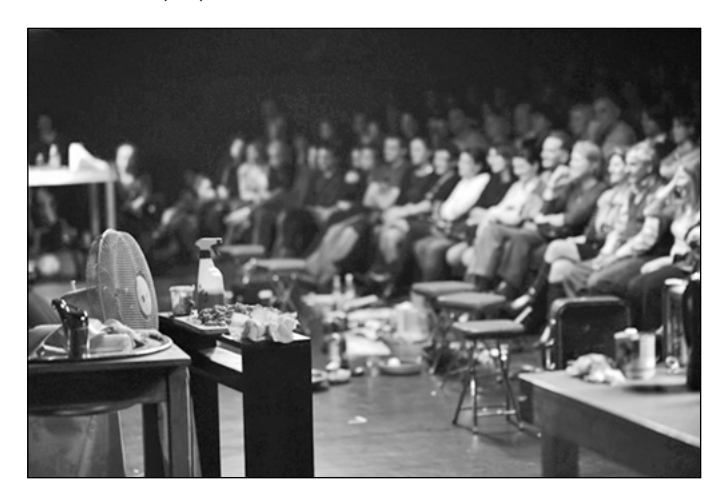
Figure 5: 'Romania! Kiss me!', Teatrul Național,'Vasile Alecsandri' Iași. Bucharest, 2010.

The orchestra determined the rhythm and structure of the performance. It influenced the plot by means of the constant interaction with the protagonists and by playing minor roles. Two other sensory elements were also employed: The 'instruments' created noises, sounds, rhythms and melodies, and odours also played a role in the performance. During a scene on the train, two members of the orchestra began cutting garlic, onions and bacon in parallel to the other action on stage. The odours filled the room. One could also smell canned fish, perfume and alcohol. A ventilator carried the mixture of odours to the area where the audience was seated, so they could not escape the smells and were virtually overwhelmed by fascination or disgust. There was no longer a separation of stage and audience, of production sphere and reception sphere. The audience was integrated into the theatrical process. In the process, they were mostly confronted with their own clichés concerning apparently typical Romanian smells. The audience could see (and in this case, smell) the clichés, and this brought about the desired confrontation with the everyday life that was being portrayed on stage. This is what the theatre makers hoped to achieve. In their own words, they wanted to 'create an atmospherically dense, sensory reproduction of everyday life in Romania'144.