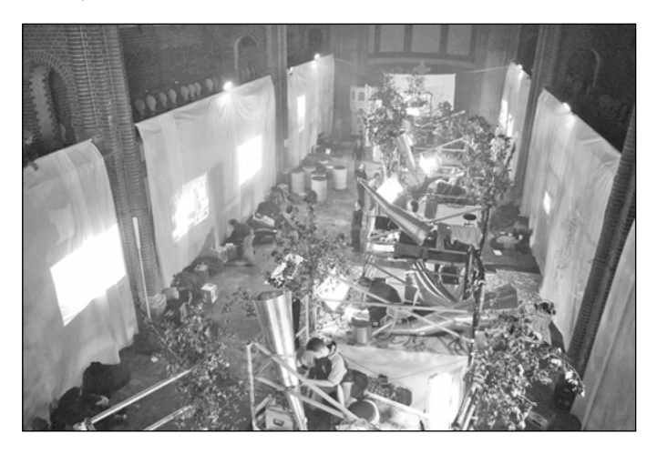
Figure 3: 'Ringlandschaft mit Bierstrom – ein Wagner-Areal', (world première) St. Johannes-Evangelist-Kirche, Berlin 2013.

Such spatio-installative forms, like those displayed nowadays in the opera installations of Schneider, Nussbaumer and many others, are the consequence of a specific disposition regarding content and music. They are not, say, 'directorial gags' or mere staging strategies; they ensue from a transmuted understanding of music (Schneider), or they let arise music and scenery – space of hearing and space of seeing – in unmediated interrelation with one another (Nussbaumer).