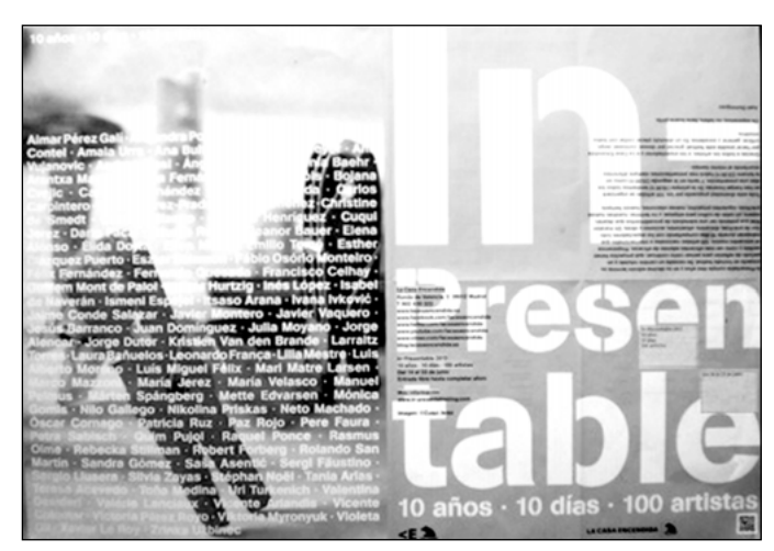
Figure 2: Program 'In-Presentable', 2012.