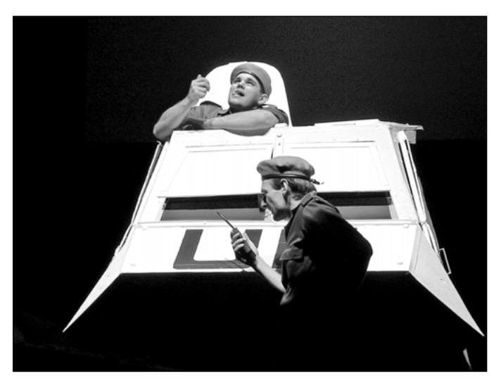
Figure 8: 'No Mans Land' Das Kunst, Garage X, Vienna, 2006.