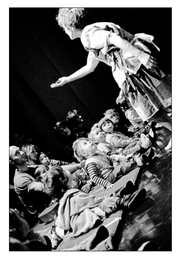
Figure 2: 'I Colori Dell'Acqua', La Baracca – Testoni Ragazzi, Bologna, Italy, 2003. Photograph: Matteo Chiura