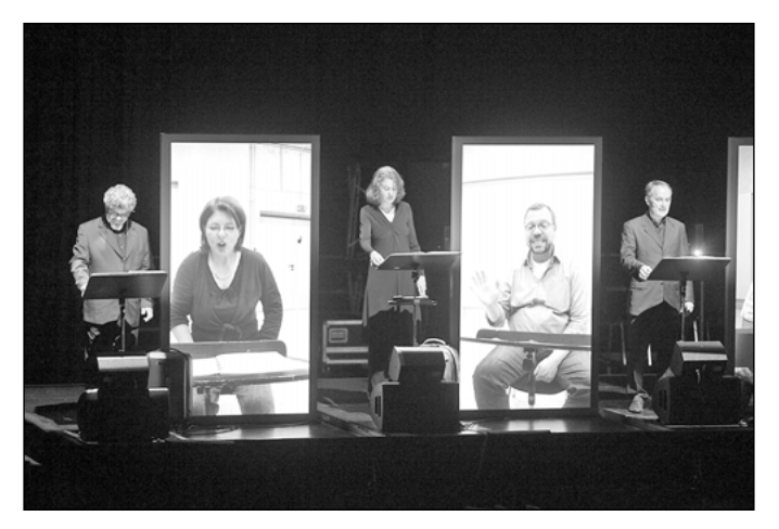
Figure 5: 'Freizeitspektakel', Stuttgart 2010.