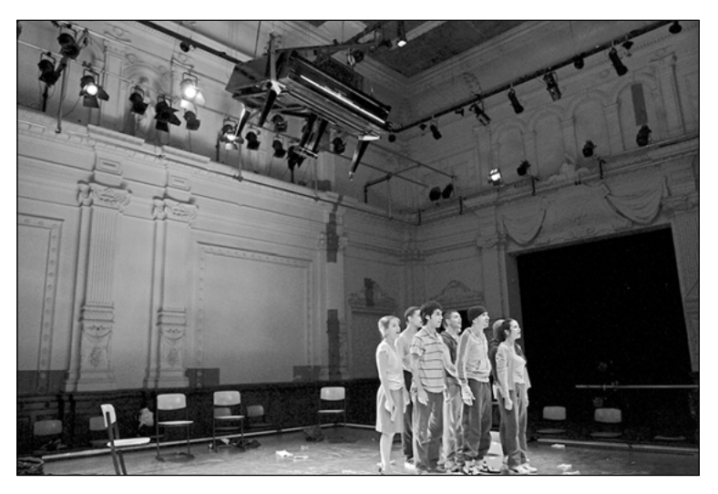
Figure 1: 'Verrücktes Blut', Ballhaus Naunynstraße, Berlin, 2010.

'For Ferrarini and other international members of Teatro Aperto, including myself, the theater – as the stage for Europe's unfolding Mare Nostrum challenges – can at least provide for a safe, healing and creative space, as well as a historical and narrative context, for such stories to be voiced and heard.' ^{130}