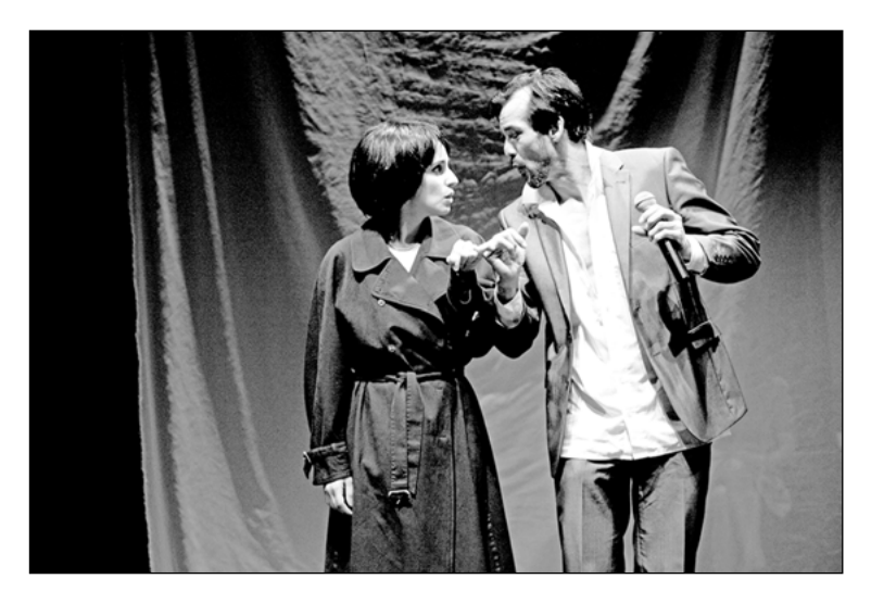
Figure 5: 'Beg Your Pardon', Ballhaus Naunynstraße, Berlin, 2012.