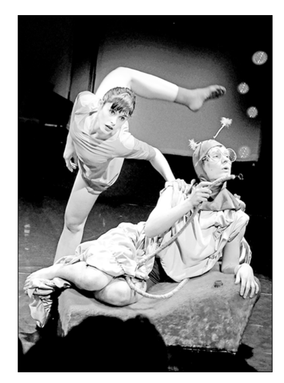
Figure 5: 'Alice', De Stilte, Breda, Netherlands, 2009.