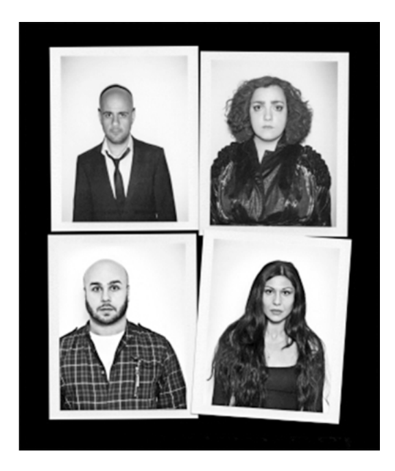
Figure 7: 'Jag ringa mina bröder', kulturhuset stadsteatern, Stockholm, 2013.