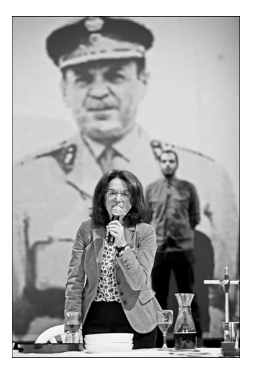
Figure 3: 'Telemachos - Should I stay or should I go?', Ballhaus Naunynstraße, Berlin, 2013.