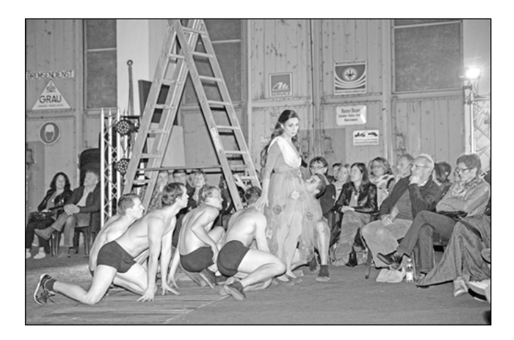
Figure 1: 'La púrpura de la rosa', German première, IGMIV-Halle in Nuremberg/ Schweinau, 2014.

The music of these operas consistently conveys a strongly reworked sound, in new instrumentations and for a chamber ensemble. As much as each separate staging is inspired by its selected site, the music remains untouched by the place; in other words, the music could, in principle, be played in other spaces and is not based on the acoustic possibilities presented by a space.