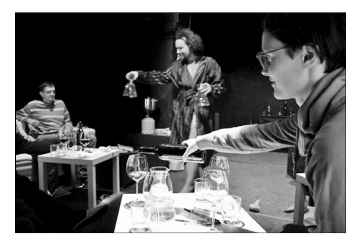
Figure 6: 'Reasons to be happy', Gledališče Glej, Ljubljana, 2011.