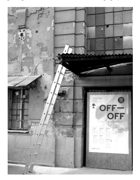
Figure 1: Pilsen, 2012.

on the stage and dealing with social problems from the past and the present: 'Independent theatres are more open to contemporary dramatic texts, the problems of the contemporary world, and documentary and social theatre. They often stage original works instead of classic stage plays.'<sup>33</sup>