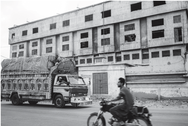
Figure 11.1 The remains of Ali Enterprises, Baldia Town (August 2017)

question was working mainly for a German group (KiK) and had received an SA8000 certificate of ‘social accountability’ from the Italian inspection company RINA, the trial threatened to involve international companies and monitoring authorities. The law suddenly seemed to have caught up with global supply chains and their regulatory regime.