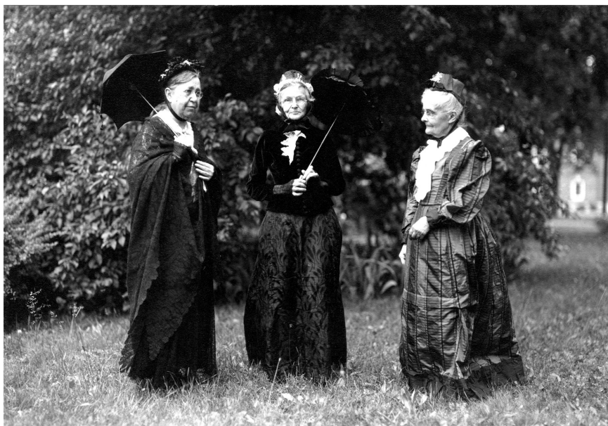
Figure 2. Alumnae at the LLS Centennial Jubilee, 1935.

past debating women so that generations of women—young, aging, and dead—occupied the same space, at least momentarily. It cultivates a feminist heritage for current students and sustains the alumnae who assembled to celebrate the club. The specific details of their experiences may differ, yet there is something familiar about the tales of the historical women who have struggled to reach the podium that can serve as an inventional resource. 137 Generations of Oberlin alumnae cherished their membership and made a concerted effort to safeguard the memory and ensure the longevity of the hallowed club.