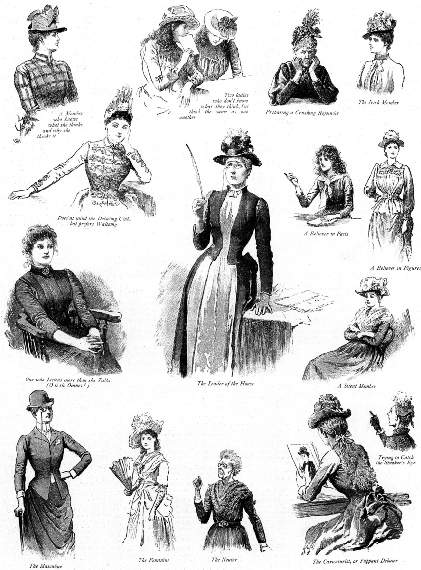
Figure 3. “Notes at a Ladies Debating Society,” The Graphic , 1888.