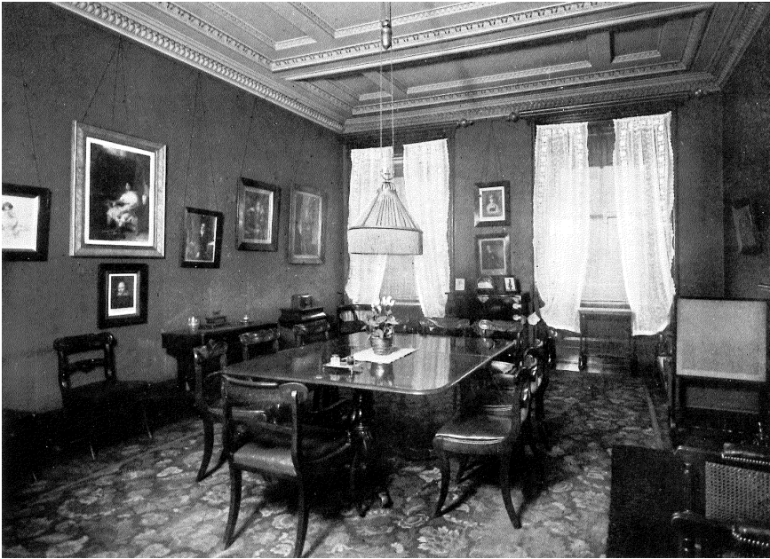
Figure 4. The Ladies' Edinburgh Debating Society's meeting place from 1871 to 1935.

a pedagogically oriented civic space—what they referred to as a “training school for women to fit them for public speaking of a high standard of excellence.” 52 To do this in a home may have provided a sense of comfort, but it did not quell their lively and sometimes heated exchanges as they mulled over the rapidly changing cultural norms of their time.