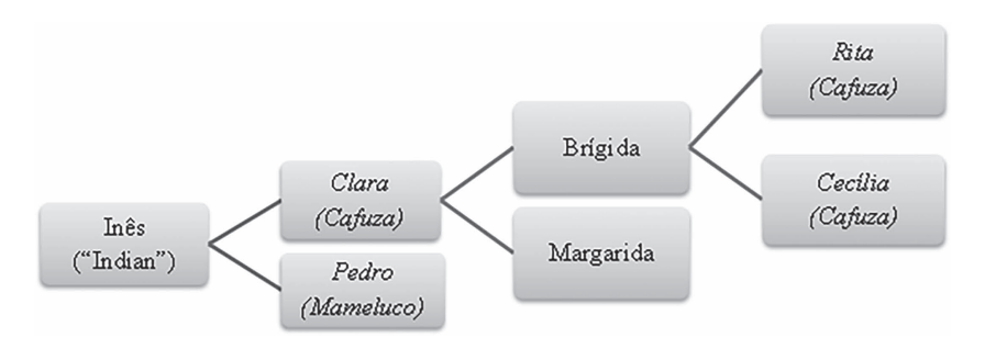
Graphic representation of Rita and Cecilia's ancestry. FIGURE 4.1