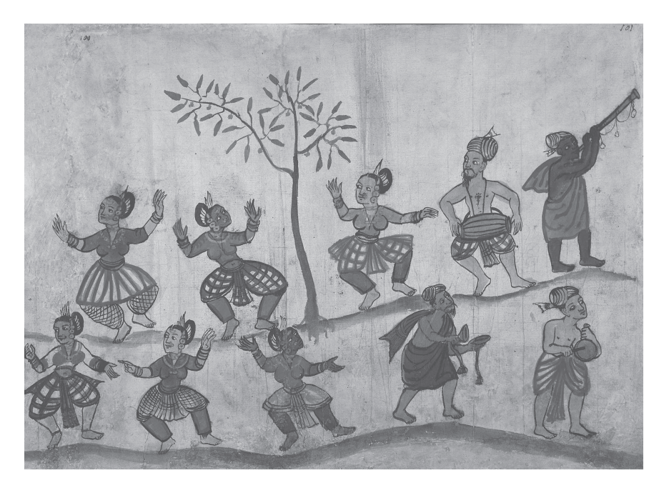
FIGURE 2.1 "Professional dancers participating in the groom's cortege", Album di disegni, illustranti usi e costumi dei popoli d'Asia e d'Africa (Codex Casanatense), Biblioteca Casanatense, Roma, Ms. 1889, cc. 100–101.

By permission of the Biblioteca Casanatense, Rome, MiC