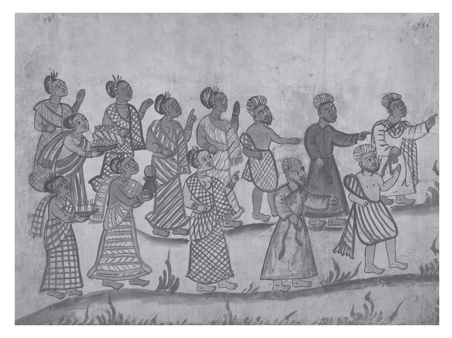
FIGURE 2.3 "Cortege of guests bringing gifts", Album di disegni, illustranti usi e costumi dei popoli d'Asia e d'Africa (Codex Casanatense), Ms 1889, c. 98.