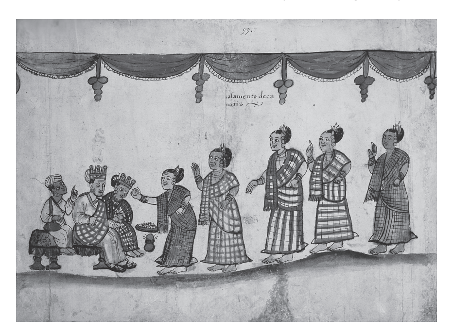
FIGURE 2.2 "Couple seated under the mandapa receiving the blessings from the elders", Album di disegni, illustranti usi e costumi dei popoli d'Asia e d'Africa (Codex Casanatense), Biblioteca Casanatense, Roma, Ms. 1889, c. 99.