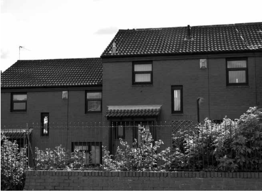
Figure 2 “Utalitarian” community architecture of the Weller Street Co-op.

grasped the tools to expand their aptitudes and open opportunities to new areas of employment. The secretary of Mill Street Co-op, for instance, explains how a CDS development manager