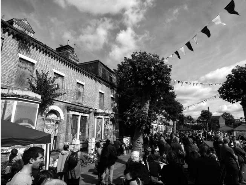
Figure 5 Granby Street Market relocated to Ducie Street during Cairns Street renovation, 2015.

negotiations with the council over the future of their neighbourhood. Not long after, however, in early 2012, the council put the four streets up to tender—welcoming the best bids from private developers and housing associations—and entered into long negotiations with a private development company, Leader One, effectively shunting the CLT off the negotiating table.