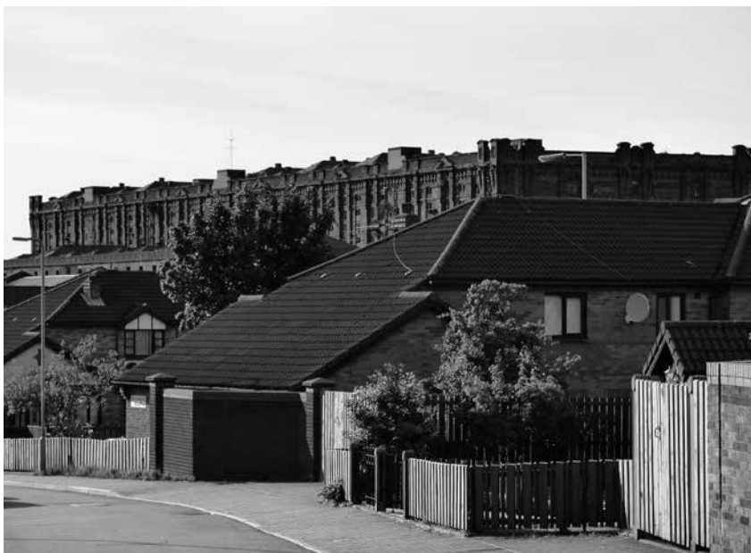
Figure 3 Typical Eldonian Village streetscape, overshadowed by the world's largest brick warehouse at Stanley Dock.