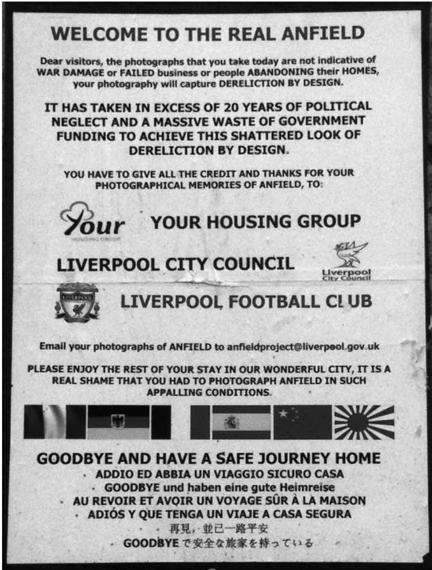
Figure 6 Dereliction by design: irreverent Scouse wit on display in Anfield.

Conference in 2007 in Minneapolis, which included site visits to local CLTs. The findings of the tour were disseminated to the wider community as a report, seeking to “form part of the narrative of the story of Anfield and Breckfield which began in 1999 and is among other things the story of a quest for social