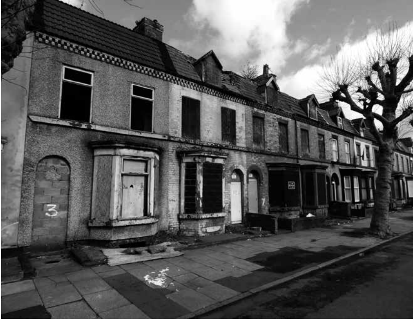
Figure 1 Dilapidated dwellings and neighbourhood abandonment in Liverpool 8 in 2015.