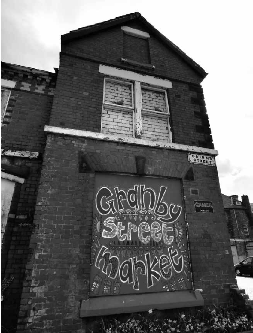
Figure 4 Subverting “target hardening” with artistic symbols of hope.

perhaps, point to a brighter, alternative future for the neighbourhood. The most prominent window infills of grey breezeblocks were boarded over and emblazoned with messages of hope and resilience: “DON’T GIVE UP!” An enduring graffito reads “GAMES (PLEASE)” — a playful subversion of conventional signs banning ball games and a symbol of the carnivalesque spirit imbuing Granby’s activism.