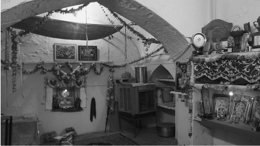
FIGURE 8.3 Mosque transformed into a room of a private house