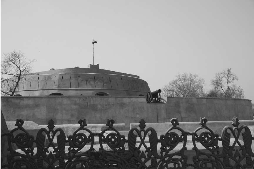
FIGURE 8.5 Gobindgarh Fort in 2017