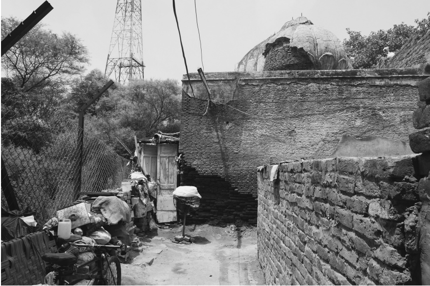
FIGURE 8.4 Wire fencing separating the army-controlled land from Takia Fateh Sha residential area