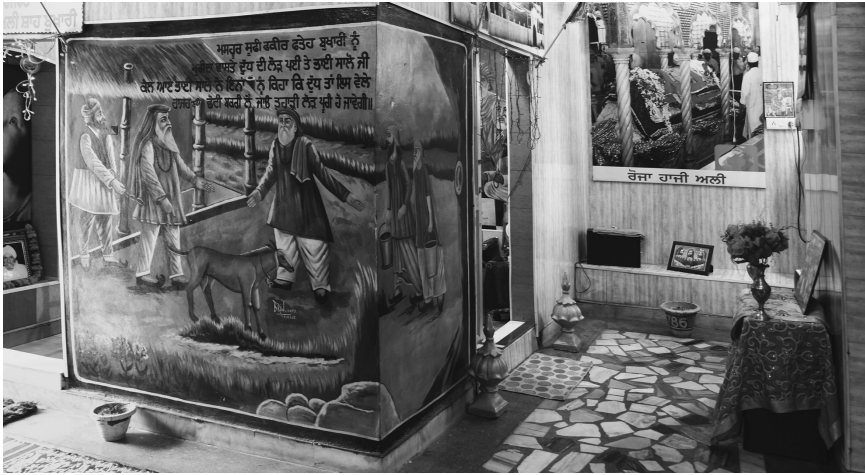
FIGURE 8.2 Shrine of Takia Fateh Shah Bukhari