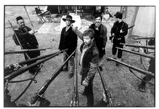
Figure 3. still image from Milcho Manchevski, Dust (2001)

obviously happens in only two screen registers, at two stark extremes: either total catastrophe, or absolute mundanity. Everything else in the middle was mere fiction.