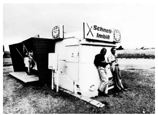
Figure 5. still image from Wim Wenders, Kings of the Road (1976)

world. They are collective. A dream is only a montage of coded elements, obeying precise, impersonal rules."2