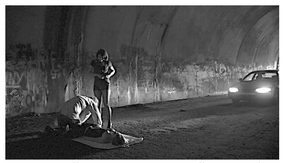
Figure 6. still image from Monte Hellman, Road to Nowhere (E1 Films, 2010)

etc.). Every time, a certain cumulative effect of waiting, of suspense, was produced in those who watched the video: what's up, what's about to slip out from hiding here? Of course, the video was, ultimately, nothing but the demonstration of this seductive rhetoric in the artful process of enacting itself. And every kind of time-based media is going about its business of producing such an audiovisual rhetoric, each moment of the day.