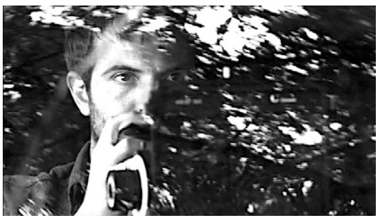
Figure 7. still image from Monte Hellman, Road to Nowhere (E1 Films, 2010)

resemblance to the so-called true story. (I am sure we can all think of numerous examples.) At several points in this process, I feebly protested to the producers: we have by now ventured so far away from the true-life premise, in every particular, so why don't we just wipe the slate clean and write a fiction that pleases us? Oh no, what heresy! After all, it's a true story! . . . And, above all, it is the market-lure of that declaration, emblazoned on-screen at the start. which is going to secure some sort of effect/ affect that is deemed absolutely necessary to both the dramatic and commercial performance of the piece. (I didn't last long on that project.)