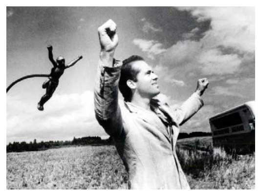
Figure 2. still image from Wim Wenders, Kings of the Road (1976)

cinema,' exemplars of the early 1960s — about elections, electrocutions, or pop stars on tour impressed my students as real (even hyperreal), but only when the screen dissolved in a frenzy of bodies shoving and screaming, uncontainable within the camera lens. On the other hand, they came away from a screening of Wim Wenders's almost three-hour long Kings of the Road (1976) with a single, indelible memory: when, in the midst of a banal, plotless stretch, one of the uncommunicative male heroes dropped his jeans, crouched down in the sand, and took a shit right before the camera, that was definitely real! No cutaways or special effects there; we all saw it with our own eyes! (Ah, the innocence of those analog days . . . . )