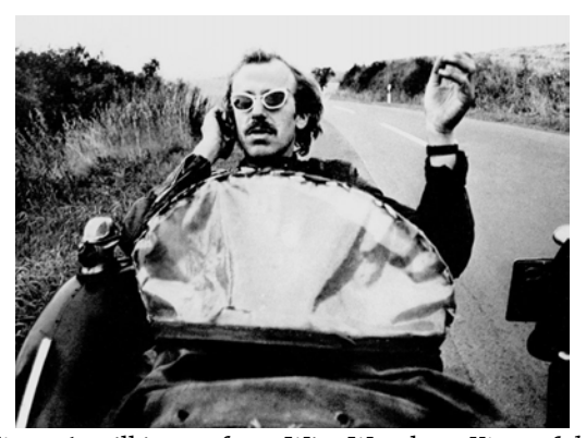
Figure 1. still image from Wim Wenders, Kings of the Road (1976)

Like Milcho Manchevski — but more from the angle of being a critic or a teacher, rather than a highly accomplished filmmaker — I have frequently been stunned, bemused, or frankly puzzled at what people take or experience to be real in any given film. This is not, in any simple or primary way, a matter of the conventional distinction in cinema between documentary