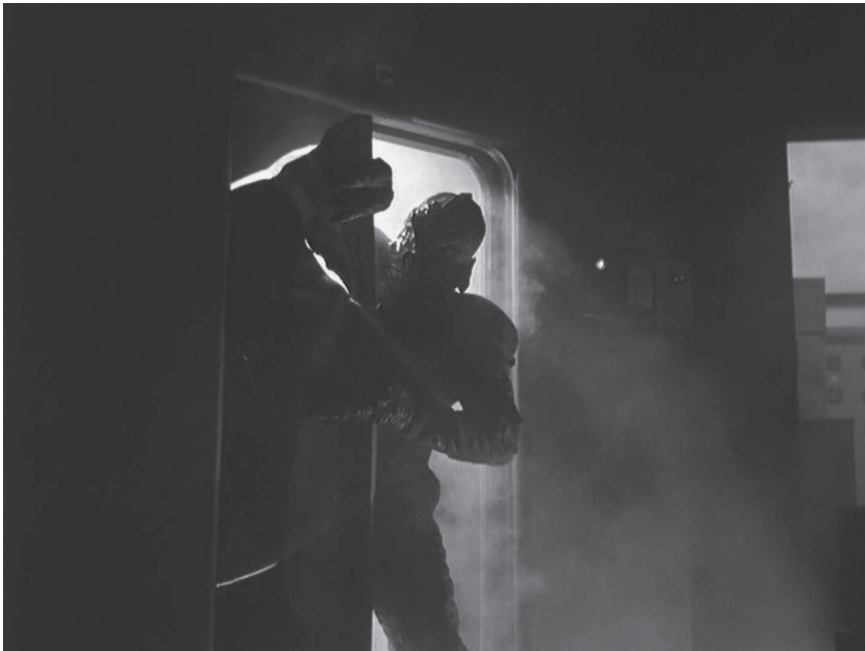
Figure 5 Shot in silhouette amid the smoke, the creature's defining feature becomes the blackness of its skin in It! The Terror from Beyond Space .

Moreover, the film invites its audience to compare the beast's black skin with the white skin of its human characters, further suggesting that Britons might have understood the creature as a racialized subject parallel to the country's newly arrived immigrants. Two shots of the beast amid the explosive traps in the lower decks, by now a hazy whirl of smoke, shadow and black latex, book-end a long, slow panning shot of the well-lit, crisply photographed and uniformly white faces of the crew. The lighting even glistens on several of their sweaty faces, drawing further attention to their pale skin. The camera spends a full ten seconds lingering on this pan, giving the audience ample time in which