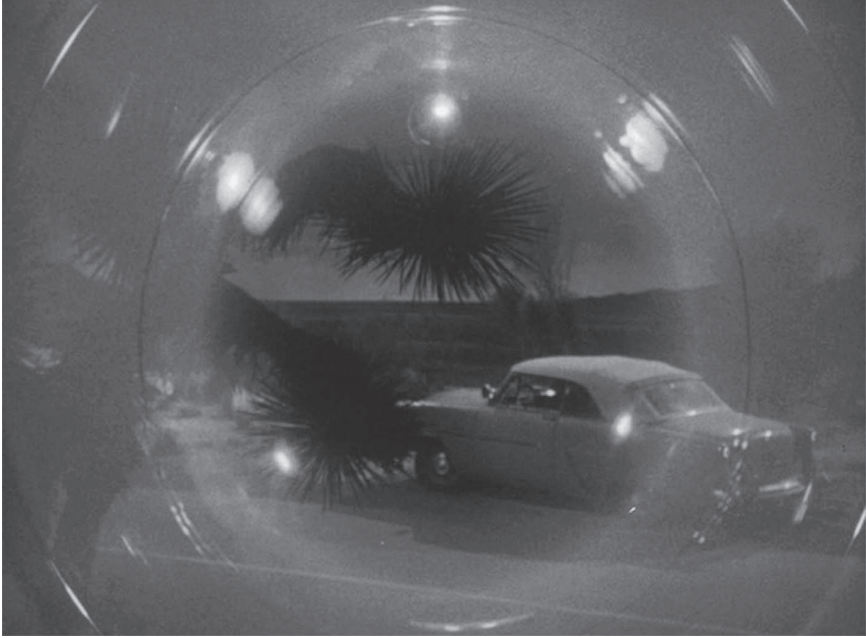
Figure 2 Strange undulating circles indicate that the audience is seeing events from the alien creature's point of view in It Came from Outer Space .

Pedely stressed how effective he believed 'Arnold's directorial trick of putting us behind the enormous eye of the visitor from outer space' to be. 33 Henry Lane, from the same publication, picked up on the fact that the aliens of this film were not 'villainously moronic monsters: they behave in a reasonably credible human fashion – or better-than-human fashion.' 34 Although such reviews do not overtly connect the point of view shots with the film's refusal to demonize the alien, both of these features were commented on in the British press, suggesting that they did have resonance in this country.