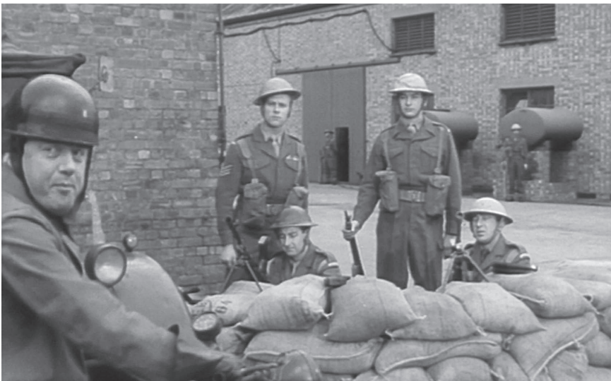
Figure 3 London's defences against the creature resemble the British Home Front of the Second World War in Behemoth the Sea Monster .

It was not only British creature features that made use of this type of imagery. Many American films of this type, such as It Came from Beneath the Sea , also presented their monster attacks through iconography commonly associated with the Blitz. This film begins with a nuclear submarine suffering a strange encounter with a mysterious creature off America's Pacific coast. The military drafts in two scientists, Lesley Joyce and John Carter, to examine flesh that the beast lost in the machinery of the submarine. They hypothesize that a colossal octopus has been forced from its lair in an underwater trench due to contamination by nuclear material. The creature can no longer feed since its prey are sensitive to radiation and can now feel it approaching. The hungry beast has gone in search of other food and found it in the form of humanity. After the existence