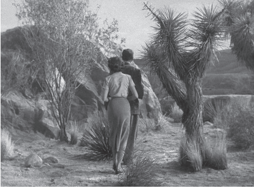
Figure 1 The otherworldly desert landscape of It Came from Outer Space .

on a job that they are attacked and replicated. Only when they leave the familiarity of civilization do they become contaminated by the alien presence. Similarly, the second group of people to be attacked also go missing while out in the wilderness and Fields herself is duplicated after being abducted from a desert highway. Indeed, every time the aliens kidnap a victim and steal his or her identity, the attack is staged in the desert. The desert is thus presented as a dangerous hinterland into which people disappear and return altered. In It Came from Outer Space , the impression is given that leaving the confines of the familiar exposes one to the risk of possession and dehumanization.