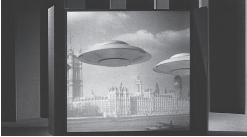
Figure 9 A brief glimpse of Britain, seen on a screen in an alien spacecraft, in Earth vs. the Flying Saucers .

This reading would almost certainly not have occurred to the vast majority of US audiences of this film since it relies on particular attention being paid to the positioning of Britain within the narrative, something that most American viewers might not have been overly concerned with. However, in Britain, a nation already primed by the crisis in Suez to speculate about its place in the rapidly changing world of 1956, this interpretation had the potential to be particularly relevant. Given the ways in which Flying Saucers uses science and technology to draw comparisons between Britain and the United States, this film was particularly suited to act as a site of confluence for the various public debates that produced, negotiated and intensified anxieties about Suez, the rise of America and Britain's new place in the global order.