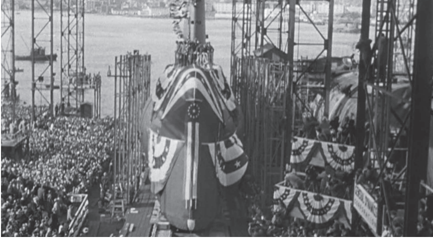
Figure 4 The launch of the nuclear submarine is cause for great celebration in It Came from Beneath the Sea .

Even after the octopus attacks the nuclear submarine and exposure to radiation becomes likely, this is not presented as a great danger. One crew member informs the captain that he just got married and was ‘counting on a family’, but he had heard that radiation, such as that leaking into the submarine around them, ‘makes it so you can’t have children’. The captain’s response is a not overly concerned promise to have them out of the compartment as soon as is practical. There is no great rush to evacuate in the face of the radiation and the clicking of the on-board Geiger counter goes unnoticed for some time before this exchange. Similarly, when it becomes clear that part of the hull of the submarine has become radioactive, the divers sent to examine it are not instantly recalled from the water, but are rather advised to ‘stay clear’ of that particular section during their investigation. Radiation is dangerous, the film admits, but not pressingly so. If one is sensible and is only exposed to it in reasonable quantities, there is no need to be anxious. Beneath the Sea thus mirrors the claims of British promotional films by companies such as Unilever, which tamed the threat of radiation by stressing its presence in the daily lives of ordinary Britons.