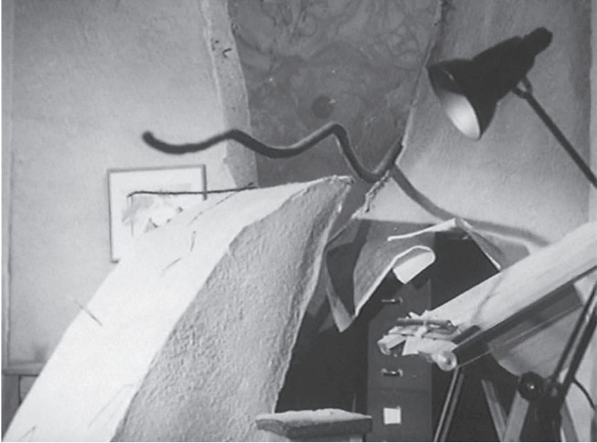
Figure 6 The staring eyeball creature extends a phallic tentacle towards the sleeping Anne in The Trollenberg Terror .

the eventual revelation of their sexualized nature and their desire for her only underline this further.