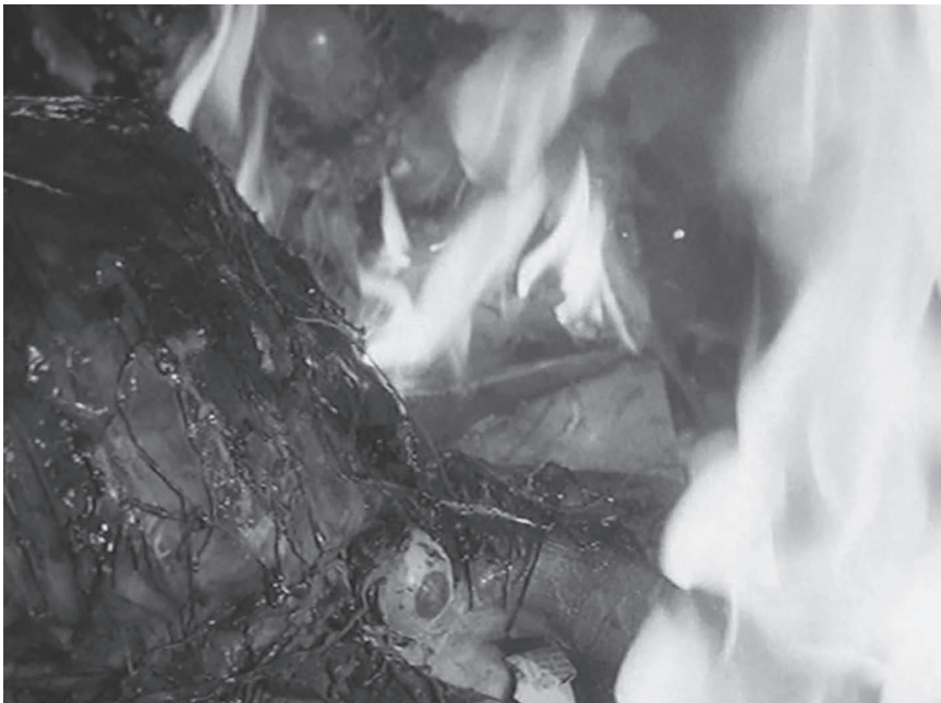
Figure 8 The inferno engulfs an alien's body, its tentacles still twitching, as its screams fill the air in The Trollenberg Terror .

This positioning of the alien as a sympathetic creature and the resultant questioning of the boundary between Self and Other were not limited to these two