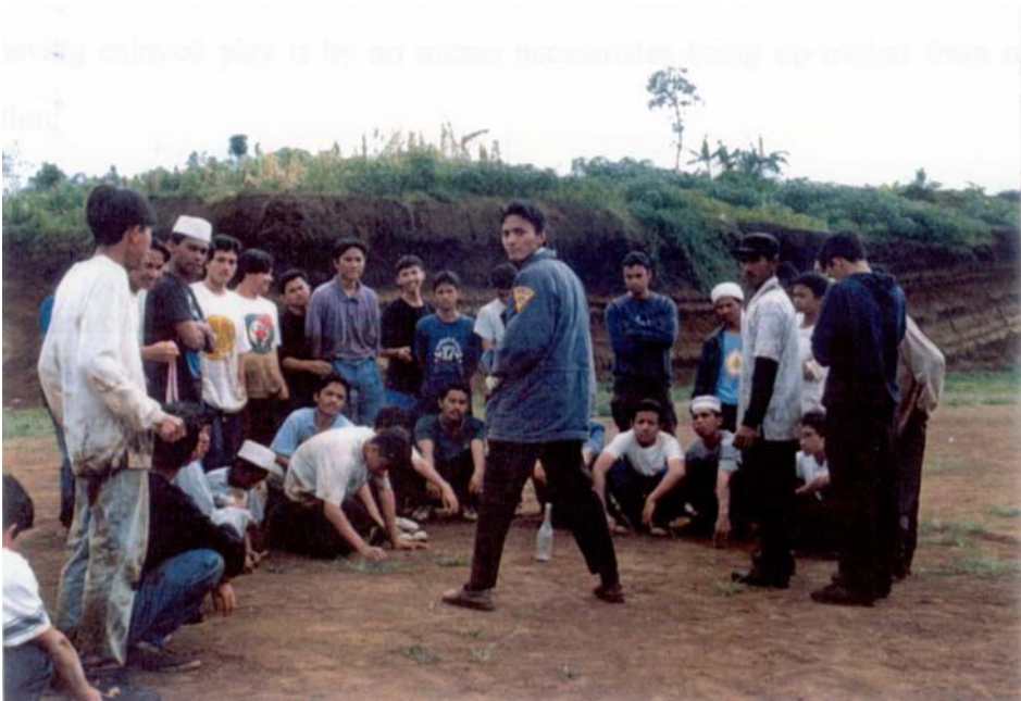
Photograph 13 An example of game: to put a nail in a bottle