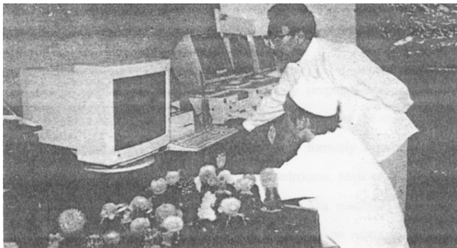
Photograph 15 The computer centre: for use as well as for rent

Coming into the Daarut Tauhid complex, one might be surprised by the glamour of its mosque, the modern-styled mini-market right beneath the mosque (ground level), and the wartel (telephone shop) next to it. The high-standard sound system of the mosque, the computer-equipped official room of the mosque, and a Western-style clock—showing the am-pm time system that is locally uncommon— all of these things in the mosque may surprise visitors. These things might well lead one to consider that Daarut Tauhid is quite modern in outlook.