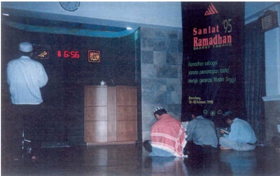
Photograph 17 A few followers, who have come early for the Taushiyah Penyejuk Hati , recite the Qur'an or perform the optional shalat .

Although the Taushiyah Penyejuk Hati on Sundays formally begins at 1.30 PM, some of the audience come as early as 12 PM, which is the due time for performing shalat dhuhur (afternoon worship). Those who come this early usually perform shalat dhuhur together with the santri. Aa Gym acts as the imam of the shalat if he is available. The most frequent case finds Aa Gym most often fulfilling some invitation to preach outside Daarut Tauhid. Those who come later have commonly performed shalat dhuhur at home or at a neighbouring mosque. When entering the Daarut Tauhid's mosque, they commonly perform the optional shalat of two cycles, which is recommended by Islam to respect the mosque as a holy place and is thus called shalat tahiyatul masjid (greeting the mosque).