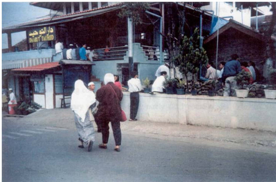
Photograph 7 The mosque was fully filled.

has been taken. However, during gatherings of the pengajian , they fill not only the double-storeyed mosque, which has a capacity of at least two thousand, but also flow onto the stairs, yard, and the street. This gathering, known as the Taushiyah Penyejuk Hati , is held twice on Sundays afternoons and Thursday evenings. It is the occasion for a large number of followers to come together and thus the best time to gauge the size of Daarut Tauhid's following. Here one can see over two thousand people.