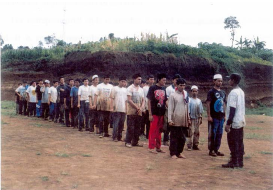
Photograph 16 Participants of the rihlah ordered to line up in a military style.

Although the term ajudan might also reflect the influence of kingly or governmental tradition (see footnote), I believe it is adopted from military tradition both because Aa Gym was a Menwa (Student Regiment) commander and because of other military terms used at Daarut Tauhid. The term komandan (commander) is also used at Daarut Tauhid in much the same way as it is applied in the Indonesian Armed Forces. The head of the daily picket at the pesantren complex is called komandan piket , the head of operational activities is called komandan lapangan (field commander), and so forth. The 'operations room' itself reflects the influence of military style, since it is "the model of a military command" which forms part of the "push for integration and unity" in Indonesia (Guinness 1994:272).