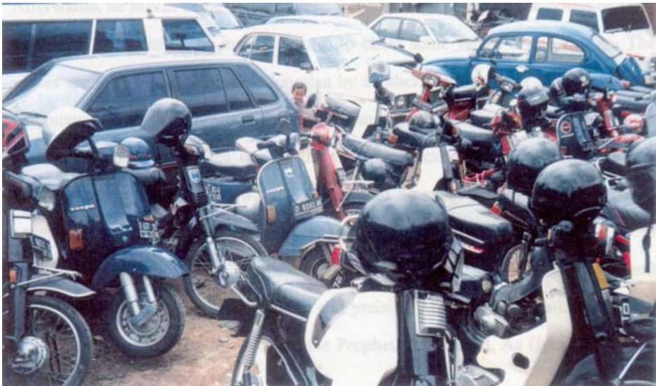
Photograph 18 Many followers come by motorbike or car.

While waiting for the commencement of the Taushiyah Penyejuk Hati at 1.30 PM, the audience are recommended to do tadarrus (reciting Qur'an) individually. It is interesting the way this recommendation is done. Rather than an announcement through the loud speaker system, the organising santri simply distribute a huge number of the holy Qur'an, which are available at every corner of the mosque to the audience by passing them along from a person to another until each one gets a copy. This has been the tradition and without any explanation, each starts doing tadarrus of their own.