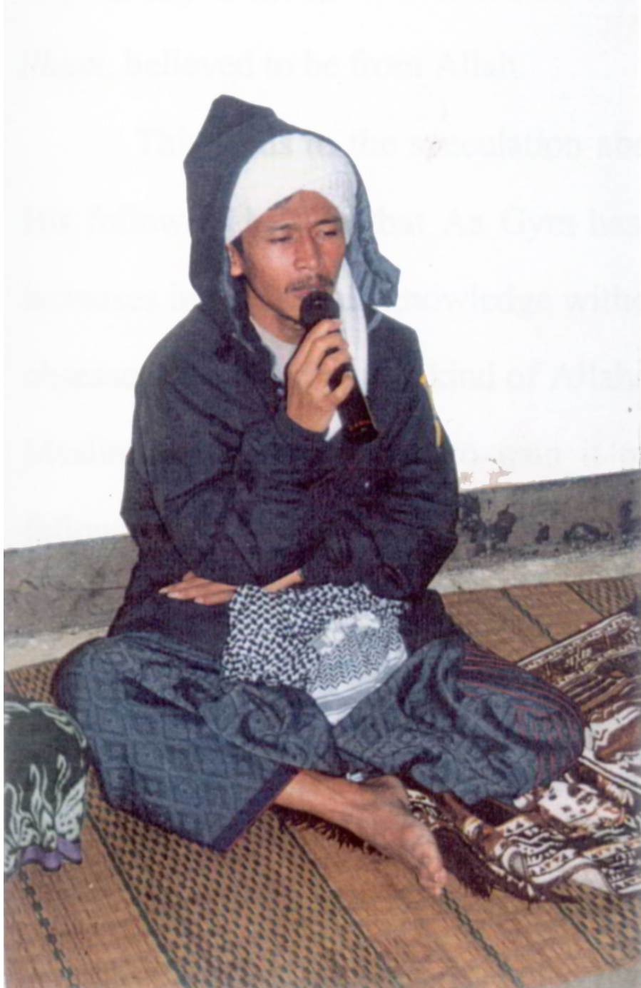
Photograph 6 Aa Gym: a young kyai with extraordinary qualities though without pesantren education.