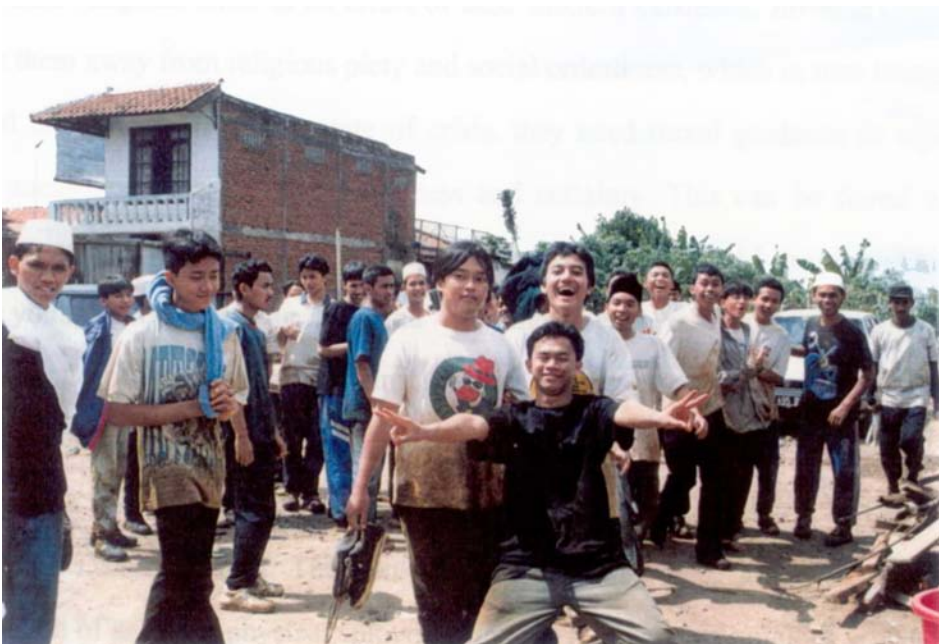
Photograph 12 The rihlah having just finished, the followers arrive back at the pesantren complex.

as “grave-and-gift” religion ( kuburan dan gandjaran ), for it is primarily concerned with life after death and with the gaining of blessings from God.