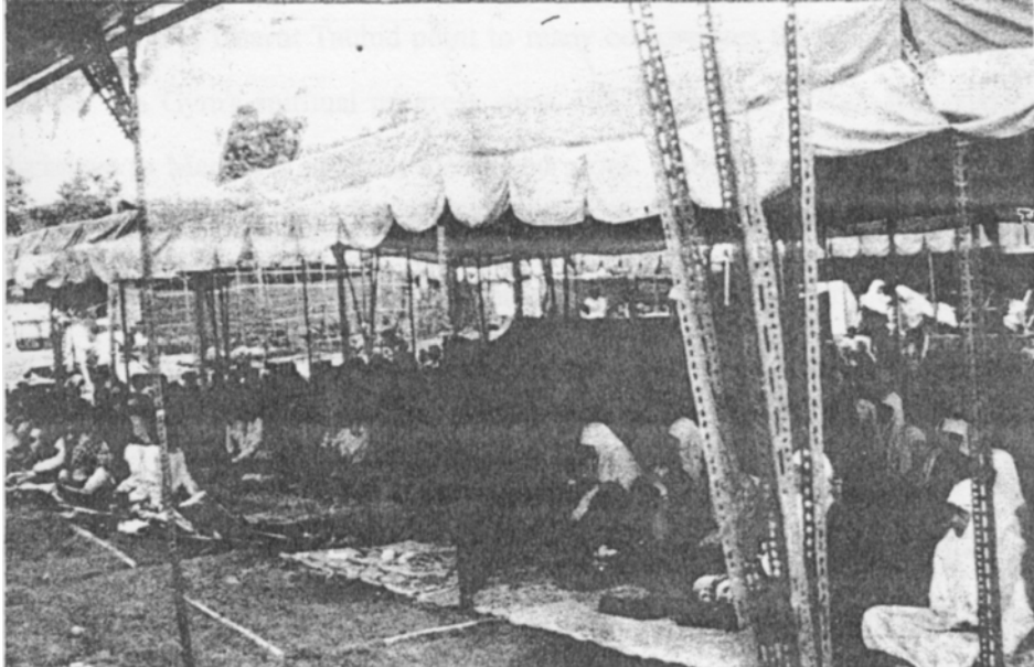
Photograph 5 Tents were built to accommodate the massive number of followers.

Given the massive following, Aa Gym felt it necessary to set up a formal institution and organise the pengajian . On September the fourth 1990, Aa Gym and the KMIW therefore founded a yayasan (foundation) called Yayasan Daarut Tauhid , with Aa Gym as its chairman. The foundation of the yayasan was accordingly the official foundation of Pesantren Daarut Tauhid , formalising the pengajian activities that had been ongoing since late 1987. The yayasan form was chosen because it encompasses both religious and economic activities and provides the legal and formal requirements for those activities. 25