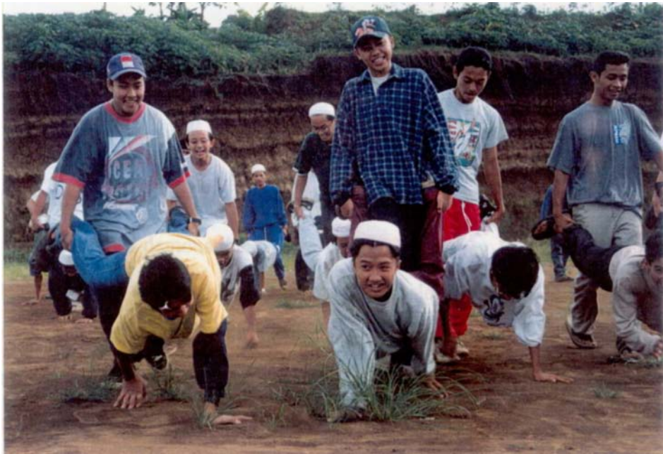
Photograph 14 Another example of a relaxing game