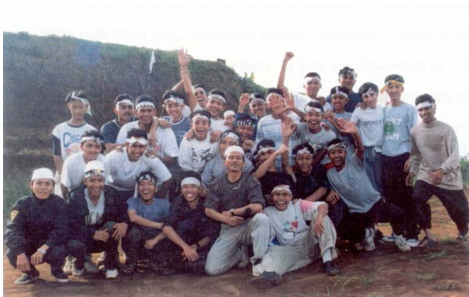
Photograph 9 A number of followers having their picture taken together with their beloved and much admired kyai (holding the microphone): an intimate relationship as part of the charisma.

Finally, there exists what can be termed an entrepreneurial relationship. As briefly mentioned earlier, Daarut Tauhid runs a number of businesses ranging from computer rental and selling handicrafts, to a mini-market and a mini-bank. The entrepreneurial relationship between pesantren Daarut Tauhid and its followers is vital to the economic endeavours of the pesantren.