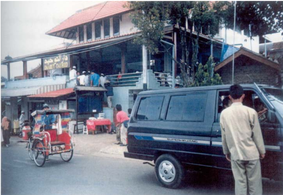
Photograph 1 Daarut Tauhid mosque as the centre of activities. Pedicab, car, and the busy street in front of the mosque suggest the urban location of the mosque

The capacity of all pondok together, apart from the mosque and the study spaces, is enough for no more than about a hundred santri. There are two reasons for this limited pondok facilities. First, Daarut Tauhid was officially founded only in 1990; this, together with the present rental conditions, reflects the early stage of the development of this pesantren. Second, at least up until now, most of the followers did not stay in the pesantren but attended the pesantren's activities without necessarily staying in the pesantren complex. 21