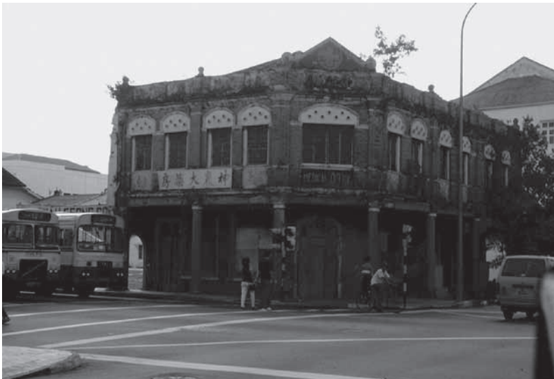
Figure 8.1 Shen Nong Medical Hall at Bras Basah Road, now demolished