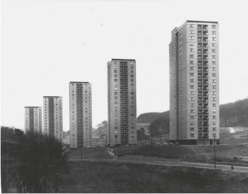
Figure 9.2. Mitchellhill in Castlemilk.