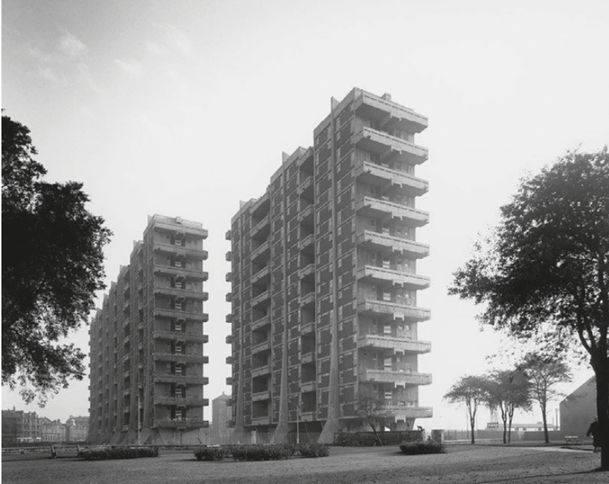
Figure 9.1. Queen Elizabeth Square pictured shortly after completion in 1965.