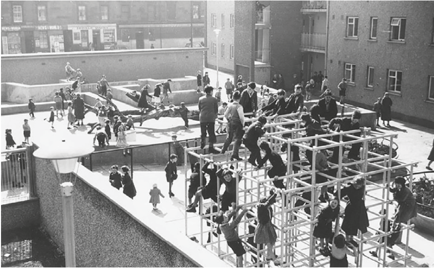
Figure 9.3. ‘The jumps’, a ‘modern’ experimental playground.