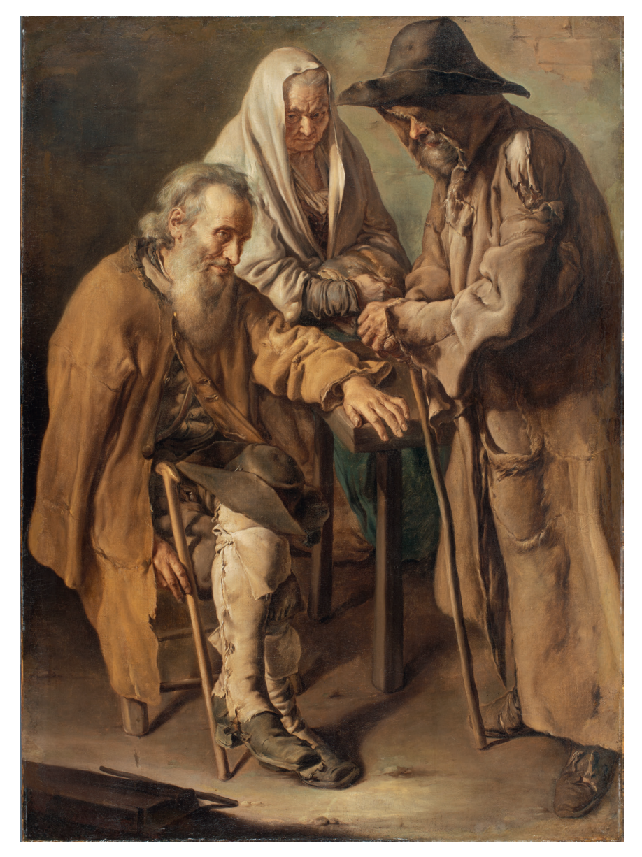
Figure 3.1 Giacomo Ceruti (known as 'Il Pittocchetto'), Group of Beggars , c. 1737.