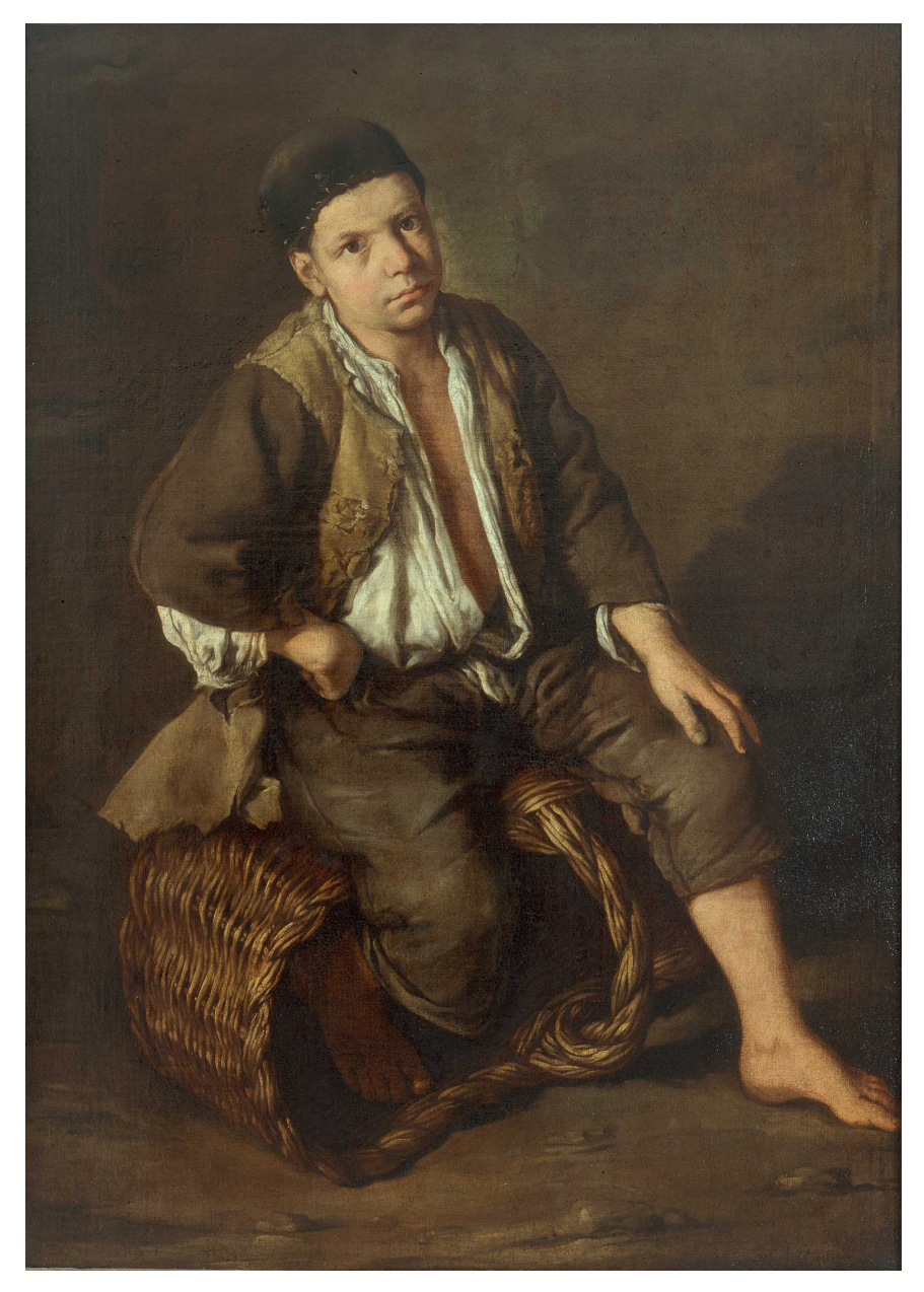
Figure 3.2 Giacomo Ceruti, Errand Boy Seated on a Basket, c. 1735. © Pinacoteca di Brera, Milano.