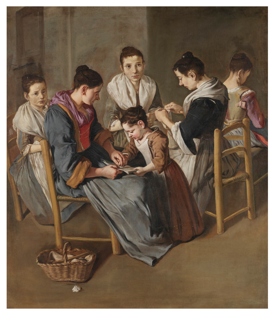
Figure 3.3 Giacomo Ceruti, Scuola di ragazze , c. 1720–1725. Pinacoteca Tosio Martinengo