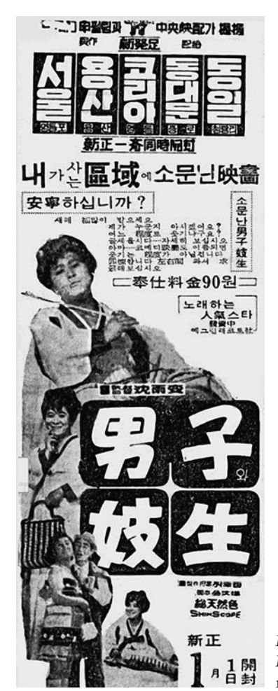
Figure 5.1 Newspaper advertisement for Male Kisaeng in Kyönghyang Sinmun, December 30, 1968.

cheap theater rental fees of the day. Male Kisaeng , for instance, was distributed to five second-run theaters just before New Year's Day (figure 5.1). The film's advertising blurb, "Watch a famous film in your neighborhood," makes it clear that the distributor was targeting the so-called second-runners of Yŏngdŭngp'o (Seoul Theater), Yongsan (Yongsan Theater), Myŏngdong (Korea Theater), Chongno (Tongdaemun Theater), and Ch'ŏngnyangni (Tongil Theater). In addition to highlighting the convenience of not having to travel to a first-run theater in the city, distributors emphasized their low admission cost (90 wŏn, compared with 130 wŏn at a first-run theater).<sup>36</sup>