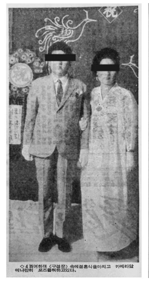
Figure 6.3 Dyadic sartorial practices. Caption reads: Posing side by side in front of camera after (1970) wedding ceremony attended by approximately 400 guests (sightseers). Figure 6.4 Their nondichotomous counterparts. Caption reads: Same-sex couple seated at home after their (1970) wedding ceremony.

of queer self-fashioning, one central to an erotic system premised on women publicly recognizing one another as women . Such sartorial complementarities occasionally came to light in weeklies' photographs that sought to visualize the intimate lives of these women rather than focus on their matrimonial rites. A report published in 1970 (discussed later) reveals considerable differences between the dichotomous sartorial style of the couple's formal wedding portrait (figure 6.3) and a far less binary image of the newlyweds, as they both relax at home in Western-style clothing (figure 6.4).<sup>59</sup>