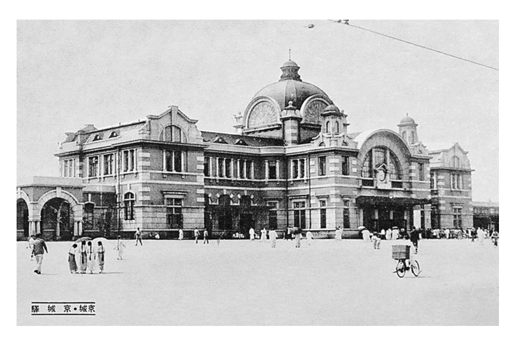
Figure 2.1 Clock tower on Seoul train station.

The next night, the woman encourages Na to stay out even later than usual. This time, he takes refuge at a café within the train station proper: