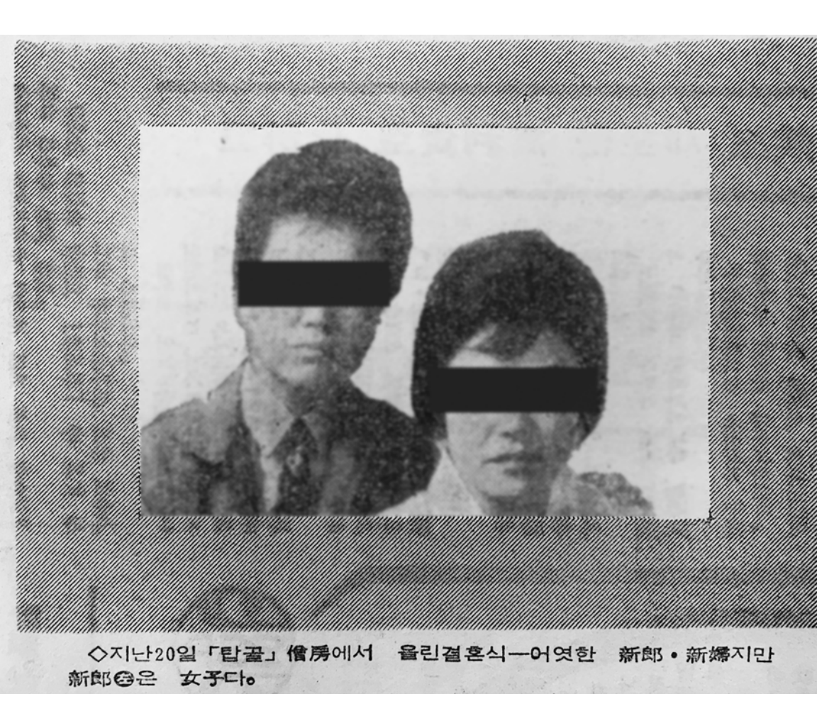
Figure 6.2 South Korean wedding between "millstone couple." Caption reads: Wedding ceremony conducted on November 20, 1965, at T'apgol Nunnery. Full-fledged bride and groom, but groom (left) is female.

already published their address, the article also revealed that journalists from other weeklies continued to hound the couple to obtain further details about their unusual relationship.<sup>58</sup> One zealous reporter even claimed to have been dispatched from a police station and proceeded to use this mantle of official sanction to indiscriminately take a picture of their faces, not unlike the photograph that appeared in the Chugan Han'guk exposé (figure 6.2).