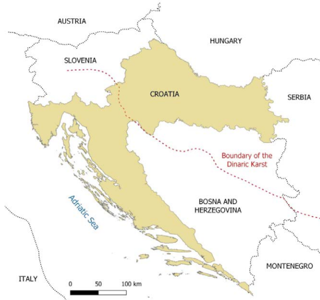
Figure 1 – Boundary of the Dinaric Karst (red dashed line).

Water is the lifeblood of all life, so people congregate near fresh water sources. People congregate near the coast for economic reasons as well. Dinaric karst covers nearly half of Croatia's land area (Fig. 1).