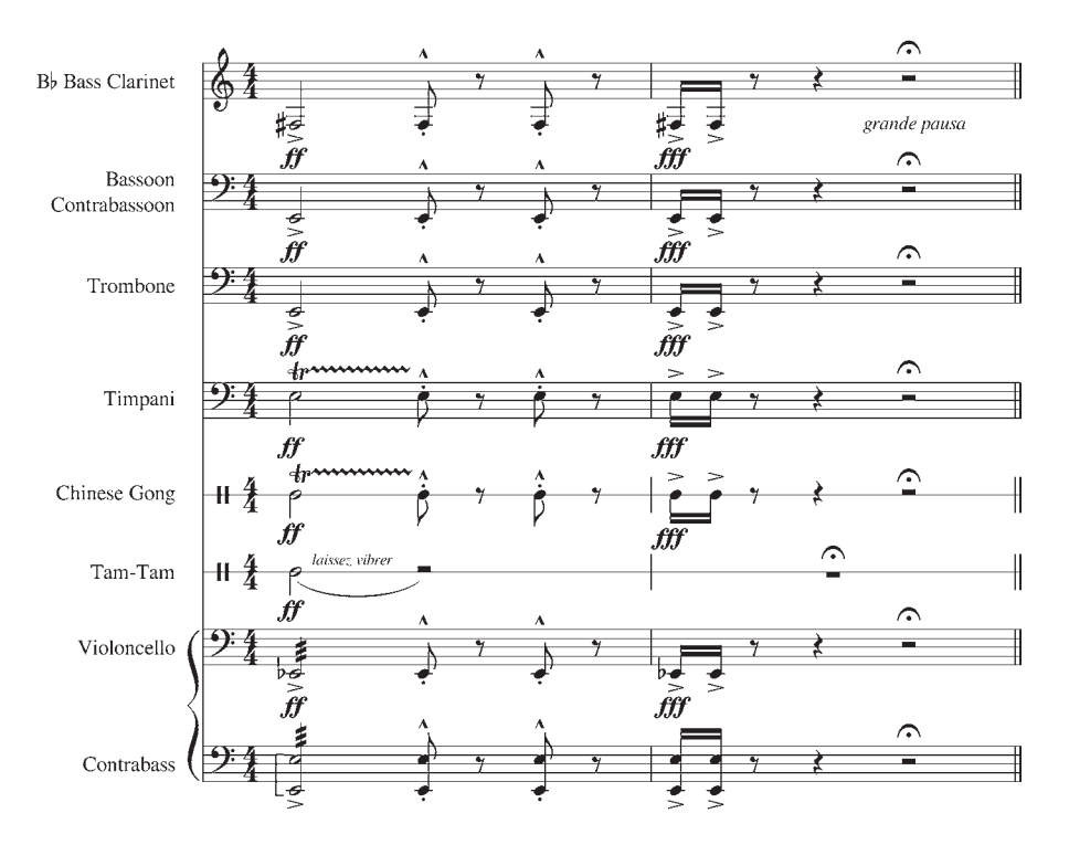
Music Example 3: Puccini/Alfano, Turandot , Act 3, scene 1, 10–11 bars after number 38.