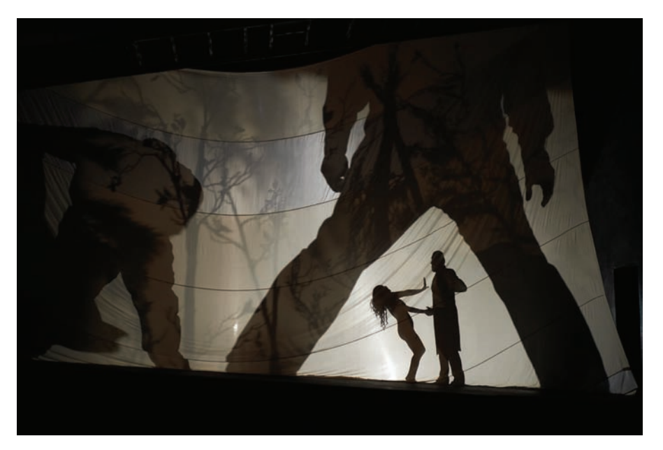
Fig. 3. Salome struggles against her attackers during the Dance of the Seven Veils. Salome, directed by Atom Egoyan.

iour."<sup>16</sup> A preoccupation with finding logical, comprehensible motivations for Salome's monstrosity seems to be one of the guiding aspects of all of the Salome productions in this chapter, and Egoyan articulates it clearly here. This interest in locating Salome's behavior in her psychology, and even manufacturing life experiences to lay the groundwork for that psychology, allows us to reimagine Salome as a post-Freudian pop-psychology story which has a certain modern-day appeal. But it also serves to strip Salome of her choices in a tangible way. The story becomes about what—or who— caused Salome to take these actions.