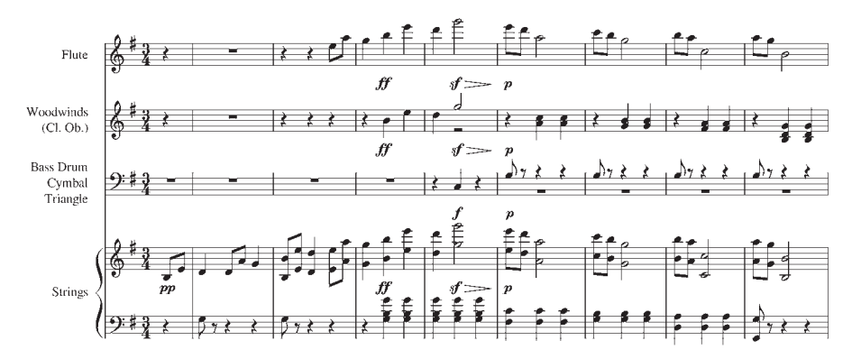
Music Example 2: Rossini, Guillaume Tell , Act 3, scene 2, no. 16, beginning of Allegro vivace.

sized beat. A little while later, this theme appears twice more (17 mm. before letter A in the Allegro Vivace). The first time, the emphasized beat at the top of the arpeggio coincides with Gessler suddenly grabbing the woman's face. He holds her tightly and slowly moves in to kiss her lips. The phrase repeats for a final statement, and this time the woman, in a desperate attempt to escape, pushes Gessler away just before the accented beat. It is possible that this was simply a small mistake in the execution of the complicated choreography of this scene, but I interpreted her timing as an interruption of his next intended move. It begins to feel as if in the world of the opera, Gessler is intentionally mapping his movements onto the dance music he hears for fun. He certainly conceives of his torture of this woman as a game; is it also a dance?