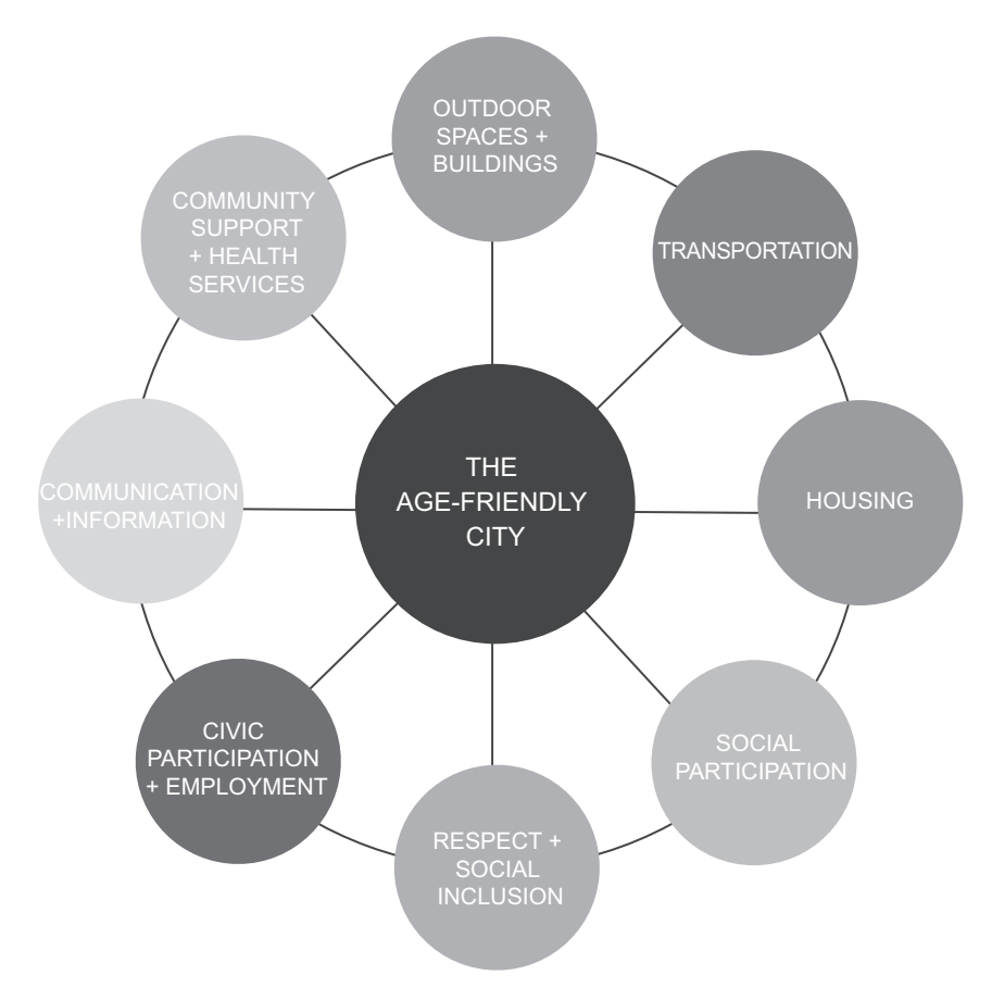
FIGURE 2.1 Eight domains of the age-friendly city

Cities and Communities". The Network, established initially with 11 members, grew at a modest pace for the first 5 years of its existence but expanded rapidly after 2015, reaching a membership of nearly 1,450 cities and communities in 51 countries by May 2023. The WHO Network is supported by a range of age-friendly groupings, at international, regional, and national levels, with examples including the International Federation on Ageing, Age Platform Europe, AARP Network of Age-Friendly Communities (USA), the UK Network of Age-Friendly Communities, the Pan-Canadian Age-Friendly Communities Initiative, and the Spanish National Programme on Age-Friendly Cities (see further WHO 2018).<sup>1</sup>