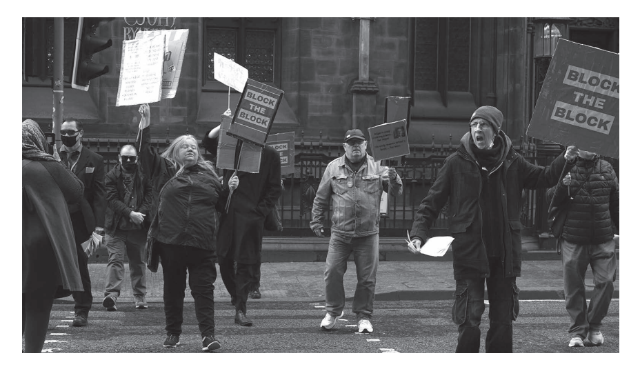
FIGURE 8.2 The Block the Block campaign led by older people in Hulme, Manchester

Salles (2020) conducted an ethnography with older people living in a tower block in a council estate in Hulme, an inner-city neighbourhood in Manchester within walking distance from the city's main universities. Older people in the area had set up a campaign group, Block the Block , to voice their opposition to plans to demolish a vacant pub to replace it with a 13-storey student accommodation block. The community-led group has been active in running demonstrations, advocating for age-friendly social action and mobilising community support for older people and vulnerable groups in the neighbourhood (see Figure 8.2.). Some older members of the group also participated