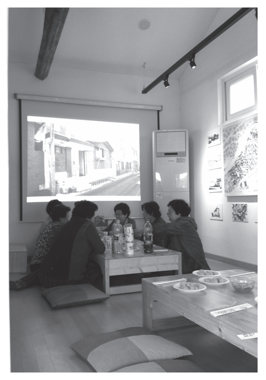
FIGURE 8.3 A village museum set up by and for older people to re-create a sense of community in the face of urban regeneration in Jangsu Village in Seoul, South Korea