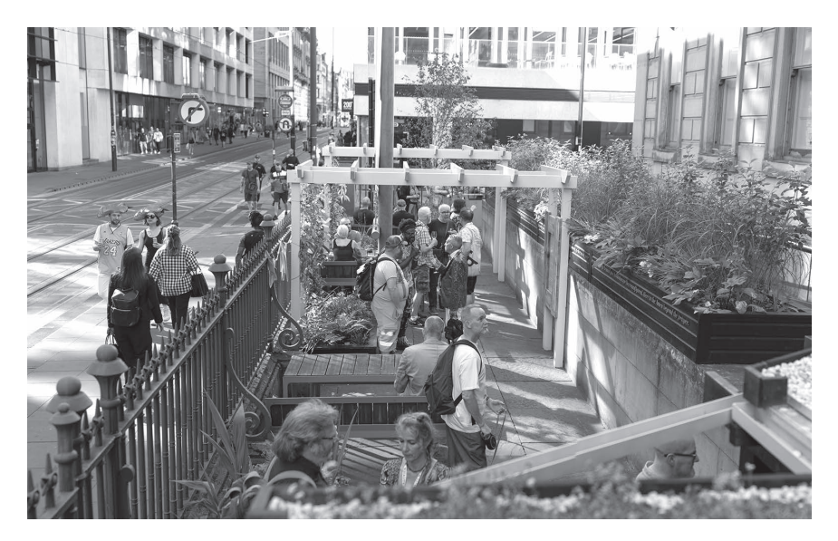
FIGURE 8.1 The Derek Jarman Pocket Park: a green shared space developed with and for older members of the LGBTQ+ community in Manchester