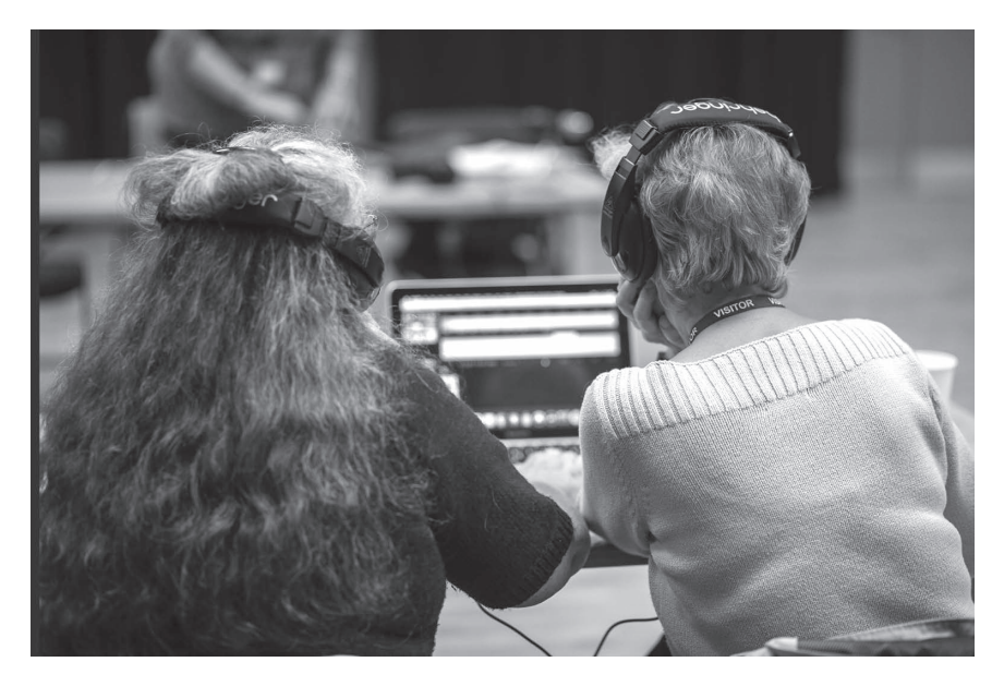
FIGURE 8.4 The Later Life Audio and Radio Co-operative, a community radio where older people play a leading role in advocating age-friendly issues