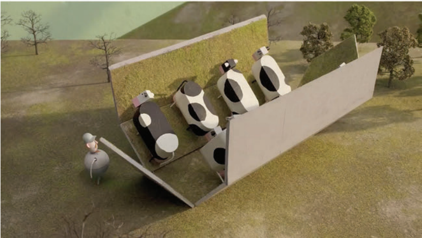
Fig. 6. A mechanized tracking shot of industrialized slaughter gives way to an unencumbered mobile camera as Chipotle goes "Back to the Start"

cess of meat production. Their tour of a hypergeneric meat-processing facility conforms to the slaughterhouse aesthetic: shot in familiar tracking shots, it proceeds along the conventional trajectory, beginning in a high-density feedlot and ending with a delivery truck brimming with processed beef. Yet Meat and You outdoes the anesthetized educational films it parodies, glossing over the interior space of animal slaughter and disassembly entirely. When McClure guides Jimmy inside the facility to see the kill floor (which, he reassures the boy, "is more of a steel grating that allows material to sluice through so it can be collected and