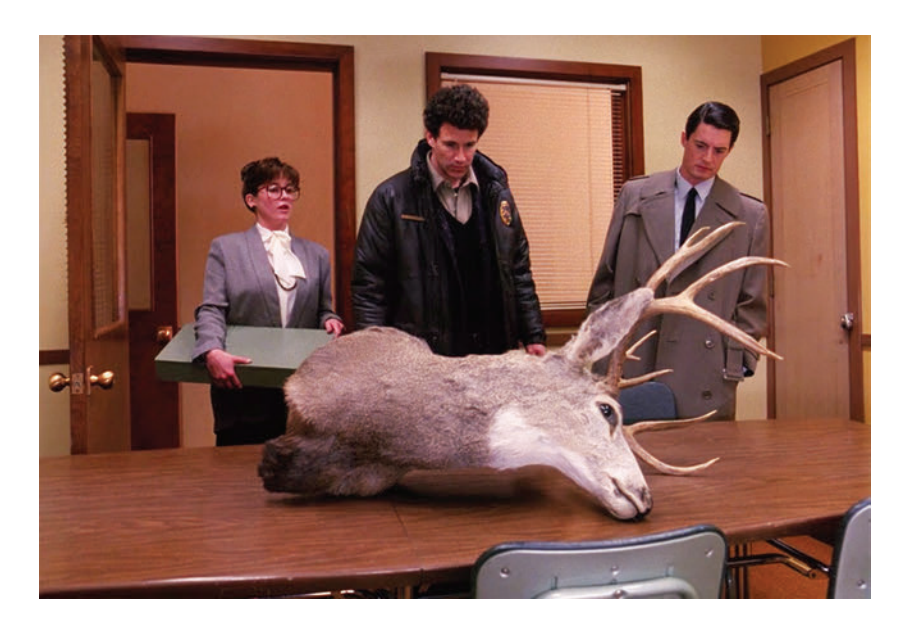
Fig. 20. An overturned buck mount inexplicably appears in Twin Peaks

tige drama seems far afield from the sitcom lineage this chapter has thus far staked out, it's worth recalling Twin Peaks ' driving fascination with exploring horror in the domestic everyday—as well as Glover's remark that making " Twin Peaks with rappers" was the impetus for Atlanta .<sup>71</sup>