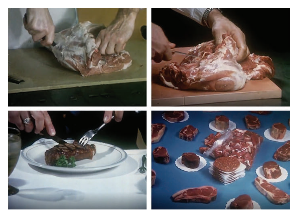
Fig. 4. A series of close-ups of hands cutting meat punctuated by a spectacle of an assortment of meats in This Is Hormel's montage of meat production

chopped-up parts invites the spectator to imagine her violation of the parts that appear within the frame, all the while forgetting that those parts constitute an unseen whole. As a matter of course, the slaughter-house aesthetic compositionally cuts up a particular type of body: the living-then-dead animal body. And in doing so, it solicits violation in a specific form of consumption: eating. This Is Hormel , like "Taking the Mystery Out of Pork Production" and most films sponsored by the meat industry, excises the scene of slaughter—the exact moment of death—from its overview. According to the film's constructed geography, the kill floor is located in a separate, unseen space; the sequential overviews of pork and beef production each begin with carcasses, and thereby suggest that meat production begins with raw, inert material. By divorcing the act of killing from the production of meat, the film further sanitizes the routinized violation and consumption of the animal body.