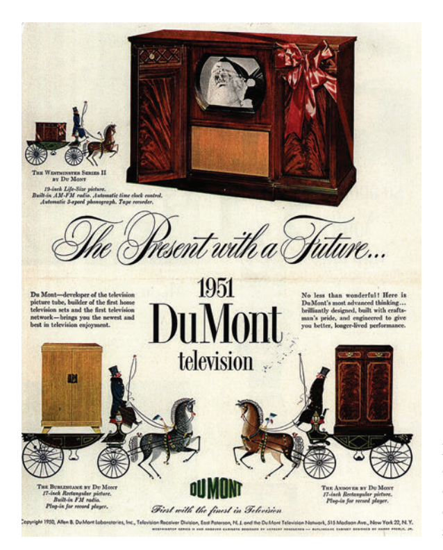
Fig. 13. Horse-drawn chariots display closed television consoles in DuMont advertisement

topped by a bronzed sculpture of a horse in full gallop. 115 An earlier Motorola advertisement presents a less ostentatious version of the same design: five cabinets, the central one ornamented by a stylized drawing of an equine sculpture. 116 In another Motorola ad, four men watch football, the glare-free screen lit by a lamp with a metal horsehead base.<sup>117</sup> This small assortment of ads shows up the symbolic versatility of horses. 118 They are, first and foremost, status symbols, yet depending on breed and function, they can signify working-class prosperity or upper-class pedigree. Horses are also working animals, and, as Lippit's observation about horseheads affixed to trams indicates, their labor is primarily associated with transportation and movement. This combination of status and mobility makes them an apt figure to escort television into the home.