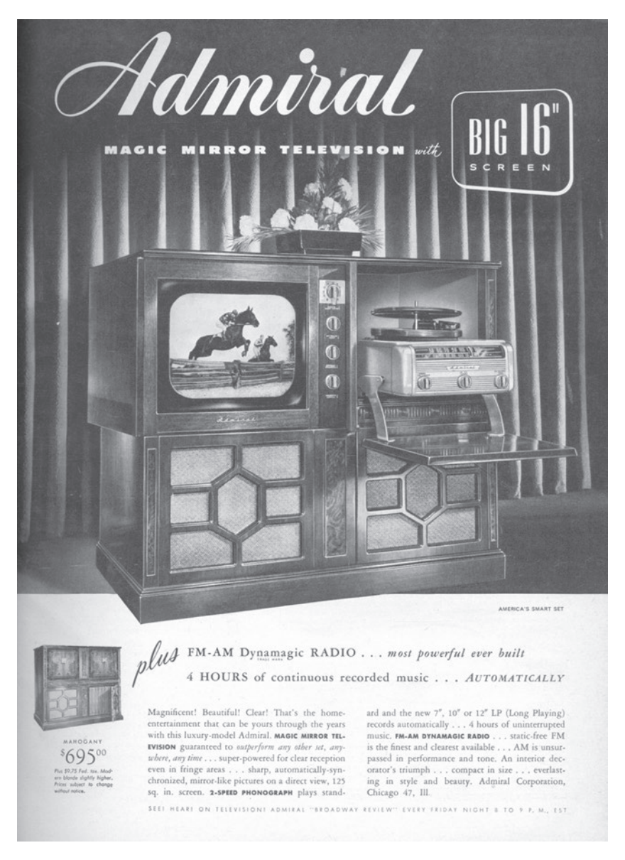
Fig. 14. Admiral advertisement evokes horsepower