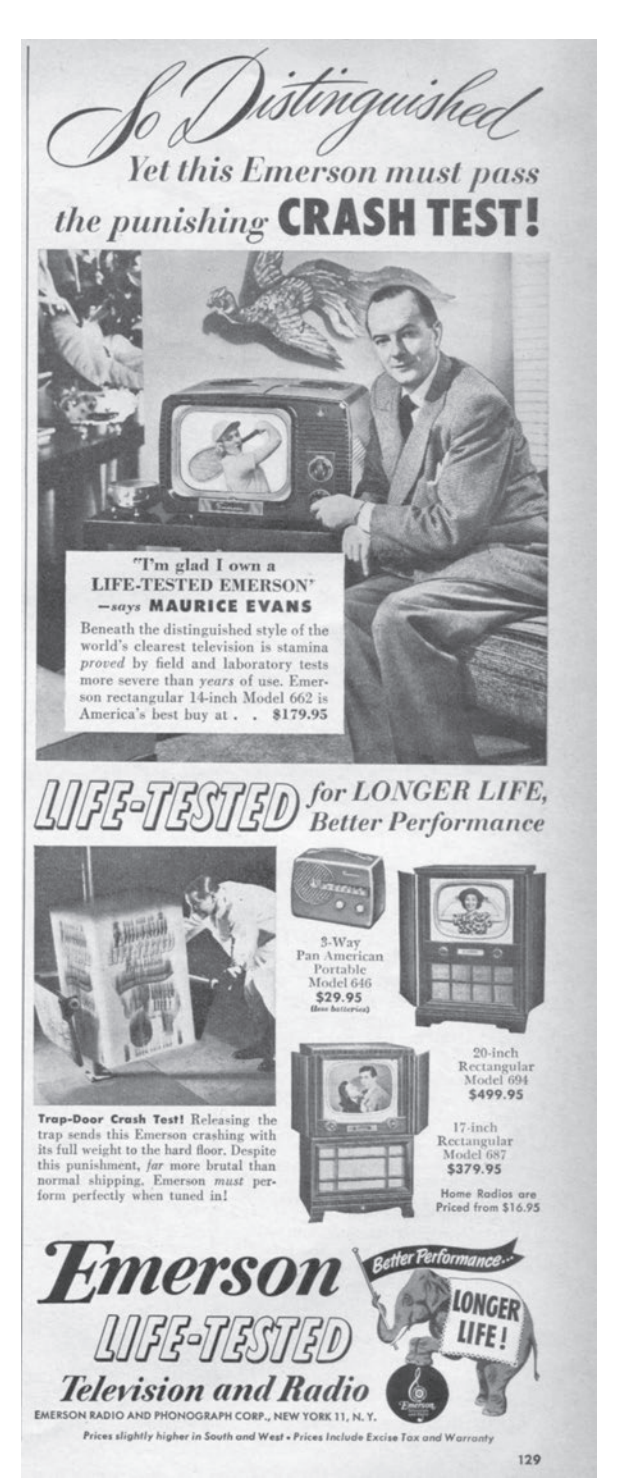
Fig. 12. A taxidermic mount complements a television set in Emerson advertisement