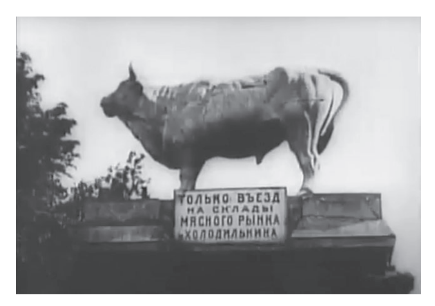
Fig. 1. A statue of a bull marks the site of the slaughterhouse in Kino-Eye

ing animal. Intertitles declaring the Kino-Eye's powers of reanimation punctuate these shots: "We give the bull back his entrails," "We dress the bull in his skin," and "The bull comes back to life." The bull is then led from the holding pen into the stockyard, absorbed into a herd of cattle, packed onto a freight train, and dispatched to the farm from whence it came. The train masks the transition back to forward motion. Abstracted in close-up shots, it is impossible to tell whether this machine (second in Vertov's oeuvre only to the camera) is coming or going; thus, as the train returns the cattle to the field, the film fluidly rights itself in a forward progression.