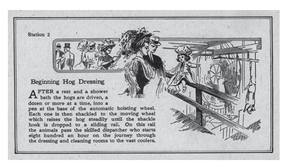
Fig. 3. Swift's Visitors Reference Book deploys a girl guide in slaughterhouse tour

subtext in how these slaughterhouses were presented on tours was "There are no black hands touching the meat." But of course there were all kinds of black hands touching the meat—that was just happening in other parts of the slaughterhouse. 92