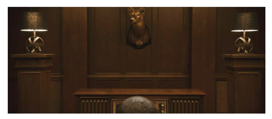
Fig. 17. Chris is held captive with television and deer mount in Get Out