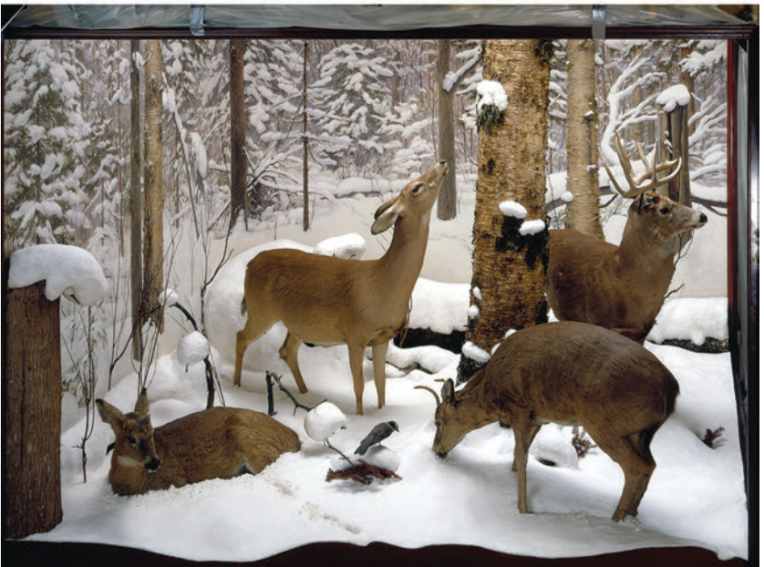
Fig. 15 (above) & Fig. 16 (facing page). Three wintry scenes display the aesthetic affinities of television, dioramas, and cinema

side (figs. 15 and 16). She has traded the stultifying mediation of television for the authenticity of human connection and communion with nature. Or so the surface-level message of the film asserts. Attention to "the fissures lurking under the [film's] glossy surfaces," coupled with my discussion of the congruencies of taxidermic and televisual display, suggests that Cary in fact turns away from her children's gift of television.