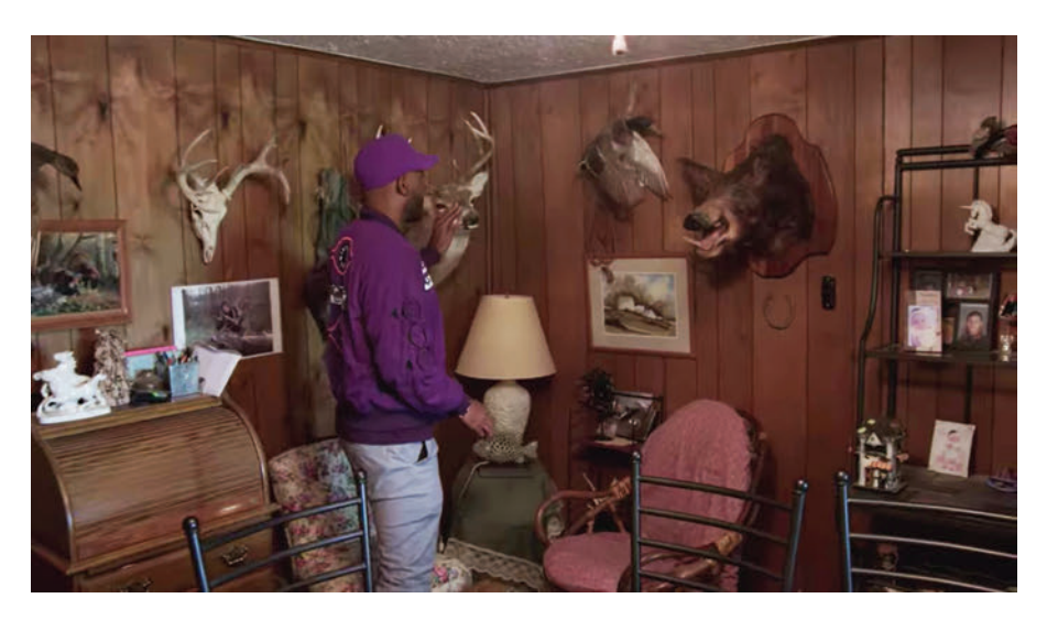
Fig. 8. Karamo Brown reaches out to pet a deer mount in Queer Eye 's "From Hunter to Huntee"