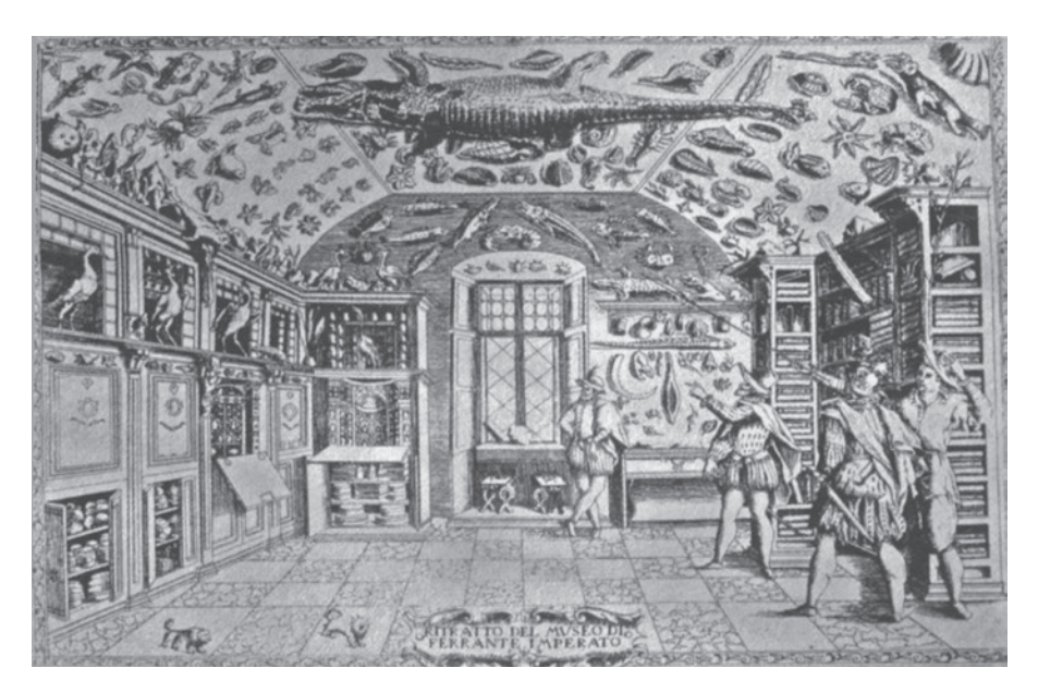
Fig. 10. First known published image of a natural history display, Ferrante Imperato's curiosity cabinet in Naples

a centuries-long "compulsive culture of hunting and collecting" and, in Steven Asma's, speaks to a long-standing impulse "to hoard dead things and display them in groups." The domestic precursors of museums, curiosity cabinets assembled the organic spoils of empire. A prized feature in the homes of European royalty, aristocrats, and members of the merchant class, they sometimes began as small collections in cupboards or boxes, but frequently their contents multiplied until they filled entire rooms, and these rooms were in turn bedecked with shelves and the kind of furniture display cases that we now refer to as cabinets. An engraving of the Italian noble and apothecary Ferrante Imperato's curiosity cabinet, published in his 1599 Dell'historia naturale di Ferrante Imperato napolitano Libri XXVIII and renowned to be the first image of a natural history collection, suggests a set of representational strategies translated from individual boxes to entire rooms: the ideal view, arranged along a linear Renaissance perspective, takes in the full array of objects (fig. 10). 87