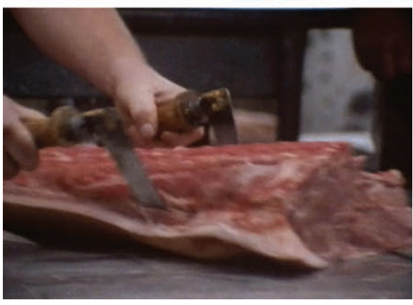
Fig. 5. A series of handheld shots of hands stunning, slicing, and cutting flesh in American Dream