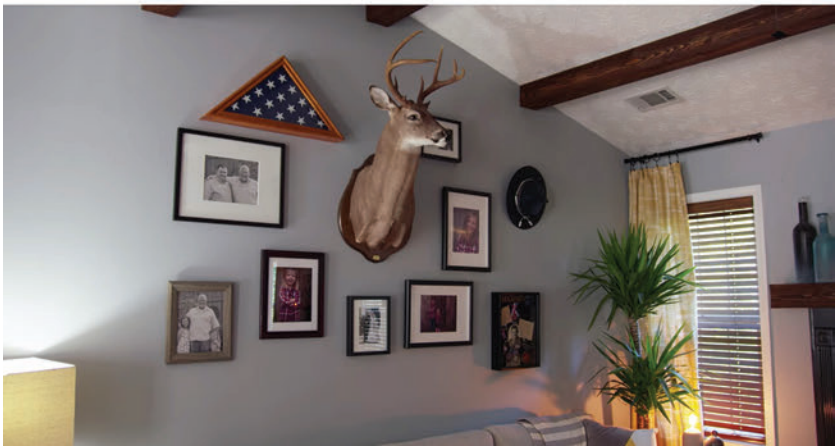
Fig. q. A deer mount is elevated from the detritus of Cory's basement man cave to prominent living room display in Queer Eye's "Dega Don't"

buck mount surfaces amid a raft of party costumes and NASCAR memorabilia in the cluttered basement mancave of white police officer Cory Waldrop, who lives in Winder, Georgia; in the "after" reveal, the same mount is moved upstairs to serve as the focal point of the newly redone family room, and Cory's wife Jennifer says approvingly of its elevation, "[The Fab Five] did it, so it's okay" (fig. 9). As in Jody's dining room, reconfiguring taxidermy in the social space of the Waldrop family's living room involves replacing most of the mounts with elegantly framed family photographs. The effect in both Queer Eye episodes remains disturbing: far from being assimilated into the family fold, the three-dimensional