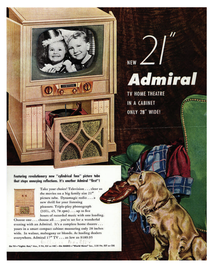
Fig. 11. A dog awaits the return of his owner, who has been transported by television, in Admiral advertisement

argument that human-pet relationships began to assume increasing intimacy in western Europe and North America in the nineteenth century because, given the seismic shifts toward industrialization and urbanization, "humans needed an outlet for their gestures of affection [as] this was becoming more difficult to find in modern society as it began to segment and isolate people into their private spheres." <sup>104</sup> Tuan's expla-