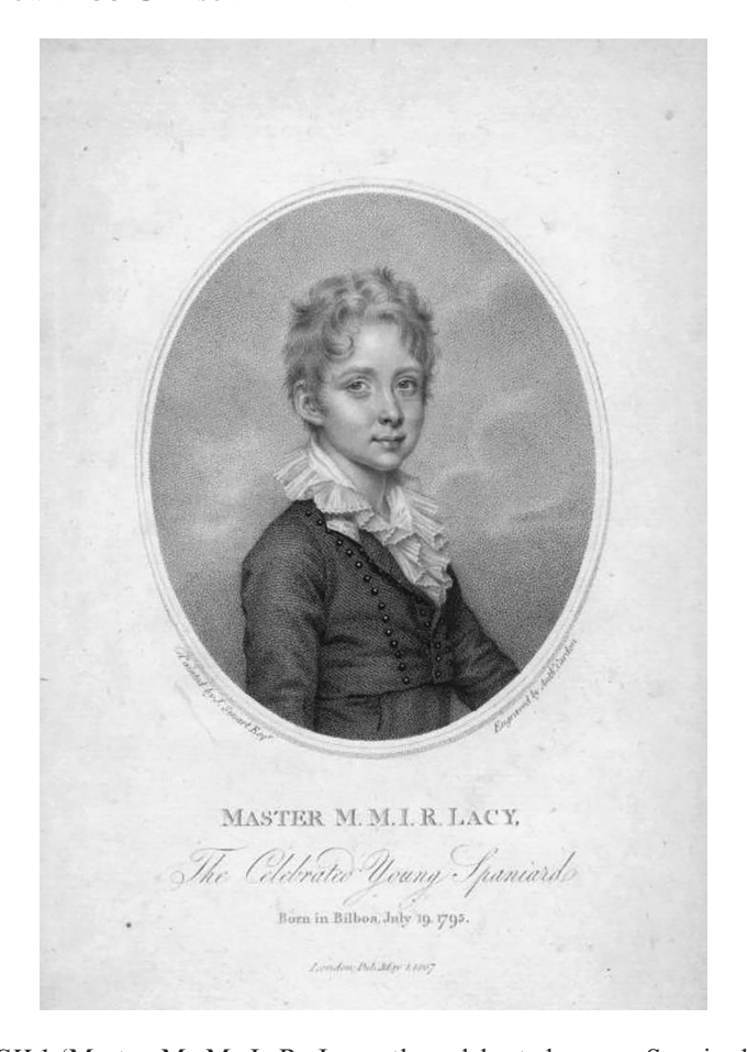
Figure SII.1 'Master M. M. I. R. Lacy, the celebrated young Spaniard', courtesy of New York Public Library Digital Collections, Music Division, http://digitalcollections.nypl.org/items/510d47df-f944-a3d9-e040-e00a18064a99.

DOI: 10.4324/9780429330636-15 This chapter has been made available under a CC-BY-NC-ND license.