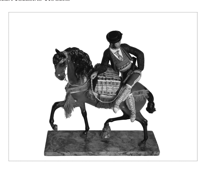
Figure SII.2 Sculpture in terracotta by José Cubero Gabardón (1818–1877) at National Trust Tyntesfield.