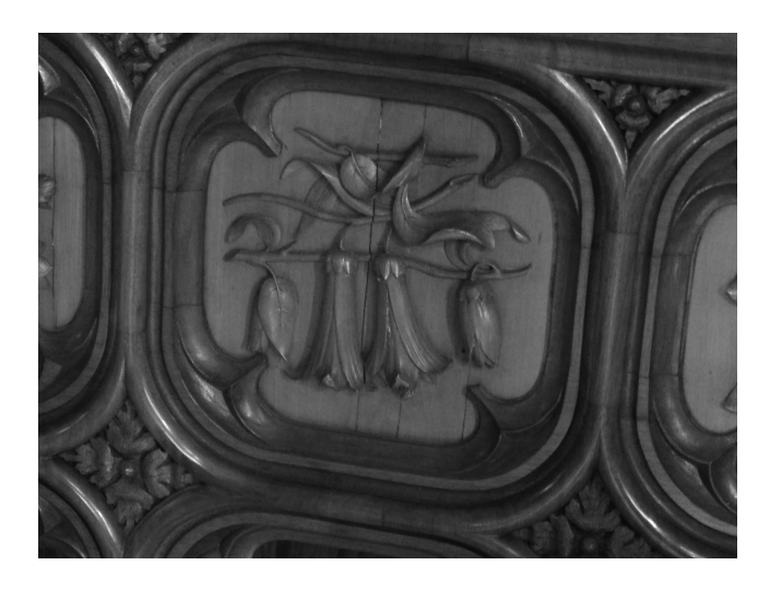
Figure SII.6 Detail of wood-panel at NT Tyntesfield.

Andrés Baeza Ruz and Graciela Iglesias-Rogers