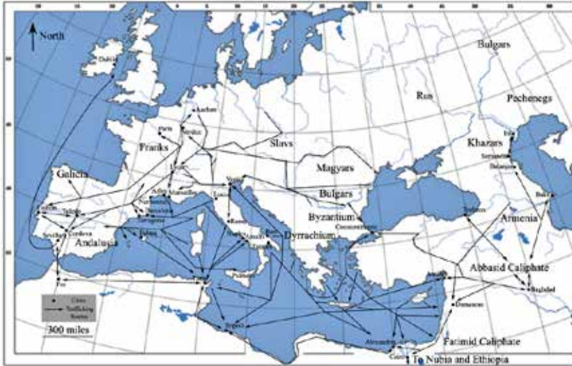
Map 2.2: The Southern Arc from the Ninth to the Twelfth Century CE

intermittent enough to make the risk of long-distance trade worth the effort. If anything, the combination of intensifying long-distance trade and political instability made the Mediterranean ripe for a robust traffic in human bodies.