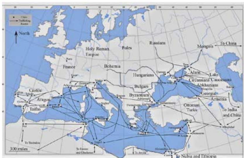
Map 3.1: The Southern Arc from the Twelfth to the Sixteenth Century CE

reclamation of the throne of Constantinople by Greek emperors in 1261, Eurasian slaves began to pour into Genoa, such that by the early fourteenth century they accounted for the majority of Genoese slave imports. 20 In Venice, despite official prohibitions, by the end of the thirteenth century Black Sea slaves were entering Venetian markets for local purchase or trafficked farther beyond into the heart of Italy. 21