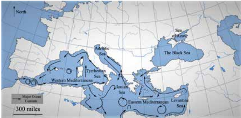
Map 0.1: Major Mediterranean Sea Currents

The crossing of cultural border zones isolates the enslaved, which reinforces their dependency upon their owners. Particularly in areas where differences in physical characteristics may be too subtle to serve as meaningful identifiers, cultural practices and patterns of speech, such as dialects, accents, and colloquialisms, help to identify enslaved individuals as outsiders and to delineate them from the wider community. Yet despite these cultural markers, escape is not impossible. The proximity of neighboring regions, especially in the case of terrestrial border zones, means that flight is always a possibility; a source of hope for the enslaved and of fear for their new owners. In the Vita Sancti Emmerami , 'a certain pious and wise old man' ( religioso et prudente ... senex ) was kidnapped on the road as he went to worship at the Church of St. Emmeram in Ratisbon (Regensburg). 'He came upon bandits who robbed him and having tied his hands and gagged his mouth so that he was unable to utter a word, took him over the frontier and sold him among the Franks. And the one who bought him then sold him to someone living in the northern territories of the Thuringians.' 50 The newly enslaved old man proved profitable to his new