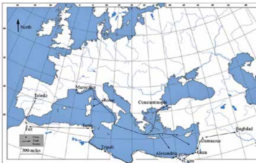
Map 2.1: Italy–Aegean Trade Routes

pilgrims and officials, as well as traders – and thus traffickers – across the Muslim world. 7