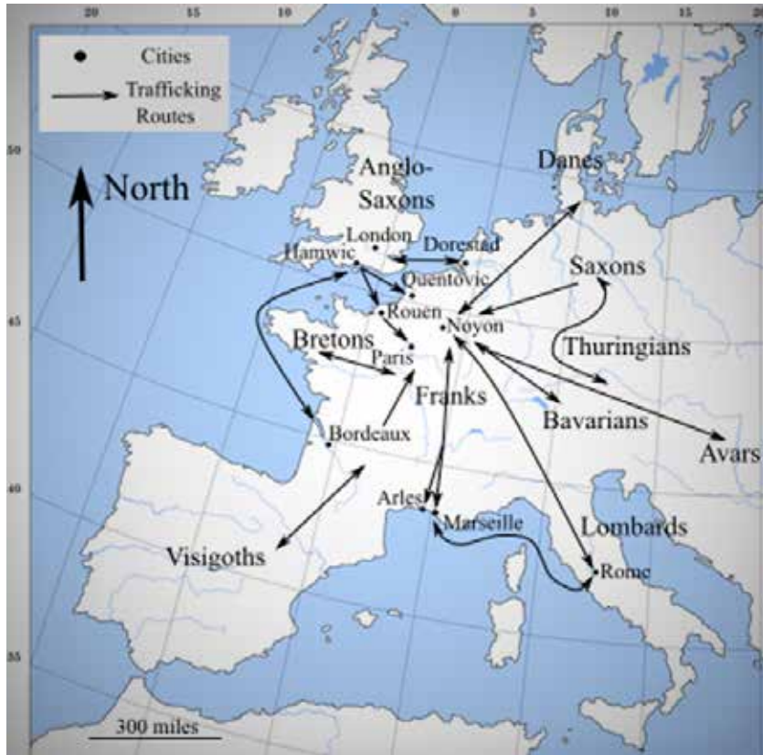
Map 1.2: Continental Western European Trafficking Patterns from the Fifth to the Seventh Century CE

land routes. In the Balkans, major thoroughfares such as the Via Egnatia fell out of use between 550 and 650, possibly because of Slavic settlement in the area. Although sea routes were still available to carry communications, goods, and people between the eastern and western portions of the former Roman Empire, the rapid closure of fluvial and overland transportation arteries nevertheless exacerbated the regionalization of the period. 92