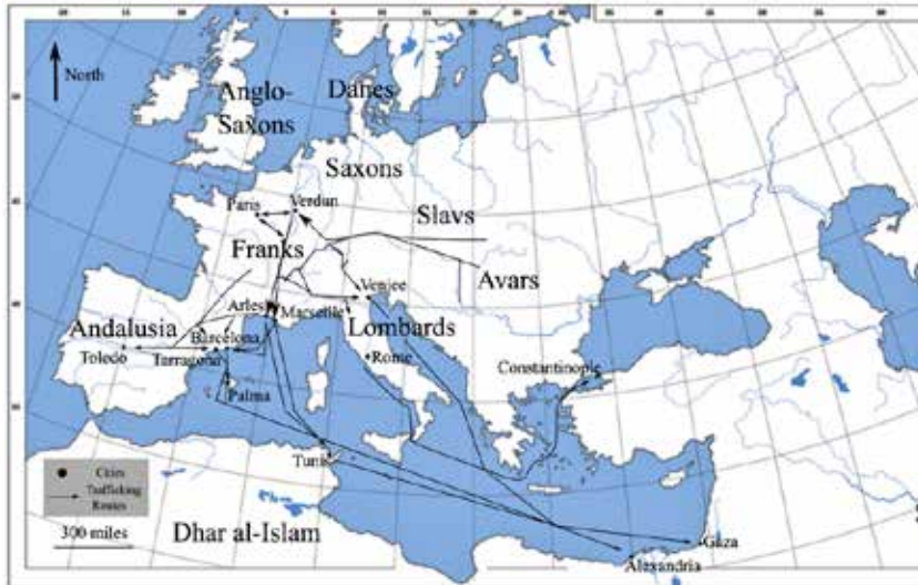
Map 1.3: Trafficking Routes in the Eighth Century

and Julier–Maloja passes. 111 Once across the Alps, trade routes again forked, turning south towards Rome and southeast towards Venice; the Venetians transported their captives by sea down the Adriatic towards Byzantium and the Muslim markets of the Levant, particularly to ports like Gaza and Alexandria. While Byzantium maintained some degree of control over the Italian coast of the Adriatic, emperors like Leo V (r. 813–820) were nevertheless unable to prevent the Venetians from trafficking people across the Mediterranean into the Abbasid Caliphate, the enemy of Constantinople. 112