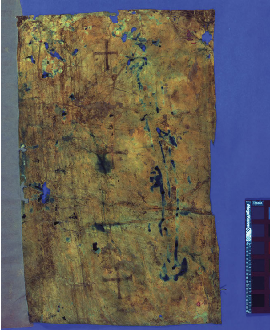
Figure 2: London, British Library, Additional 38651, fol. 57r (multispectral image).