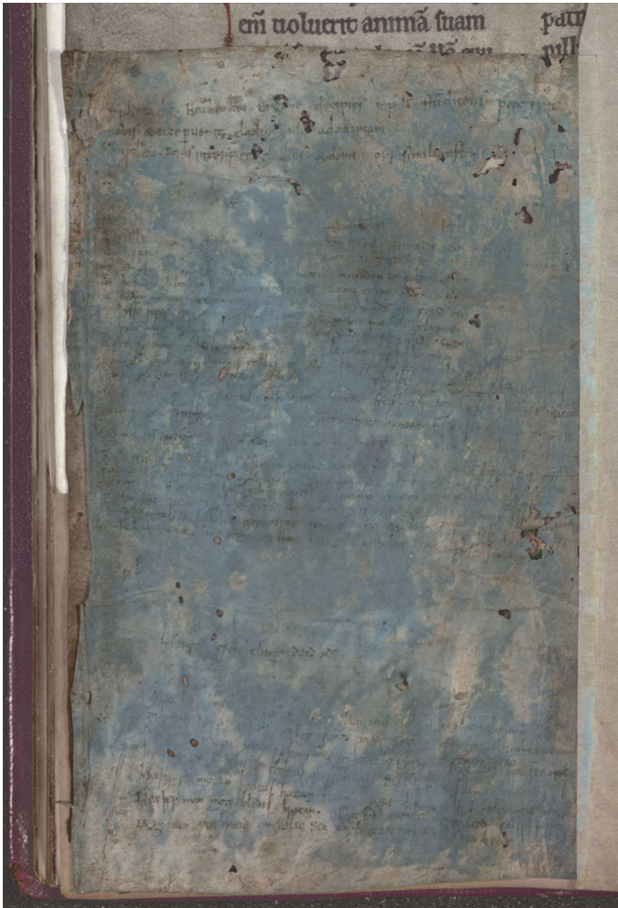
Figure 3: London, British Library, Additional 38651, fol. 57v (multispectral image).