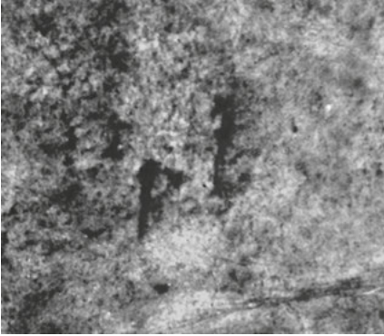
Figure 1: London, British Library, Additional 38651, fol. 57v/29 (detail, multispectral image). Wulfstan’s own signature as bishop?