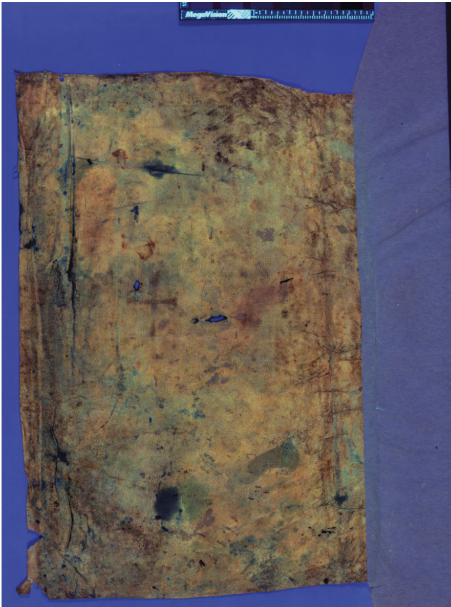
Figure 5: London, British Library, Additional 38651, fol. 58v (multispectral image).