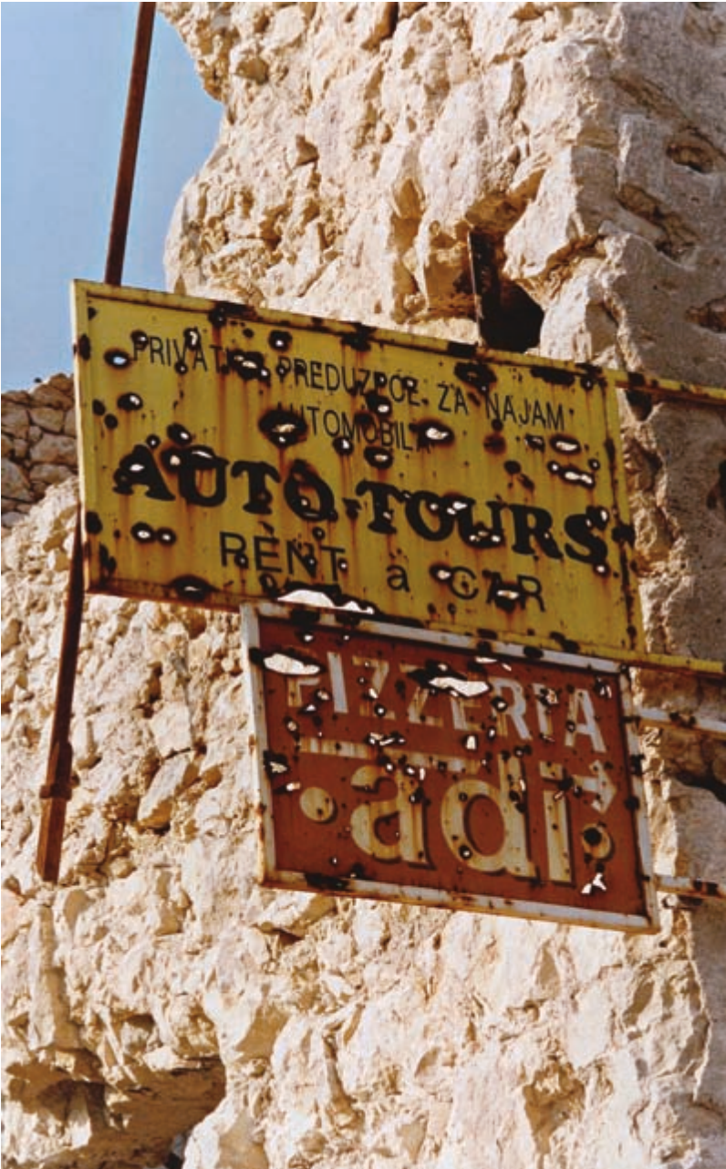
Remnants of better days in Mostar. July 1997.