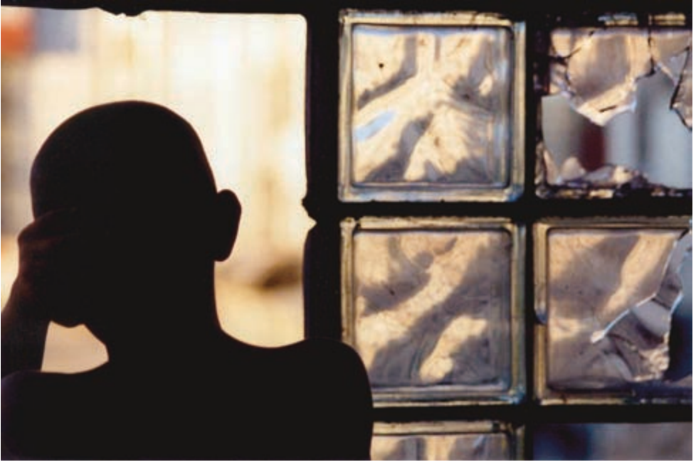
Shattered dreams in Dobrinja. December 1995.