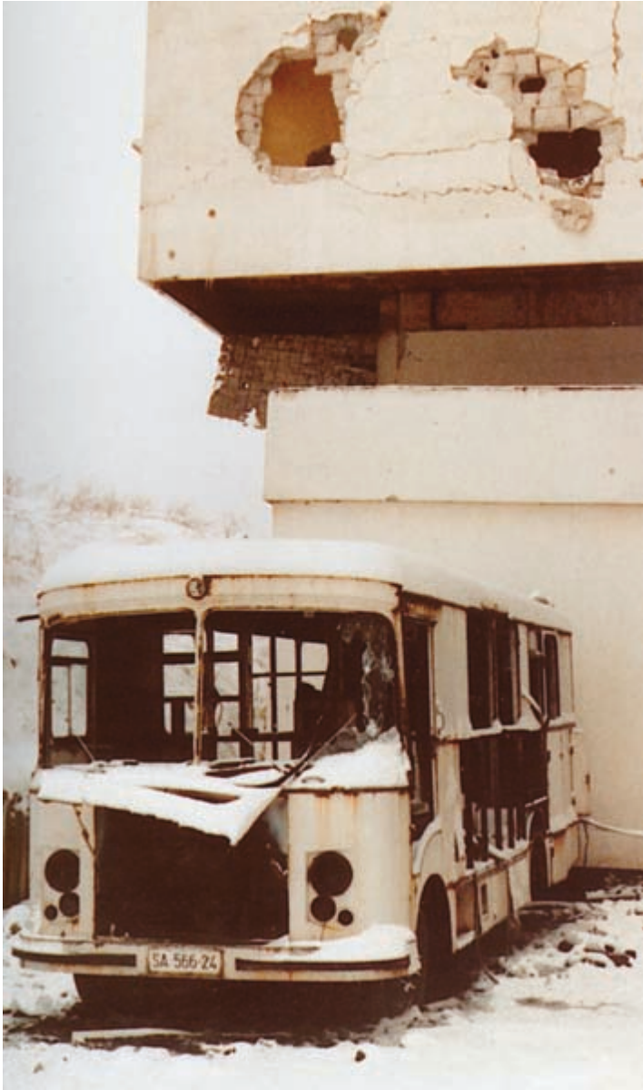
Civilian targets. Bus outside the Sarajevo maternity clinic, in the line of fire of Serbs shelling from the surrounding hills. December 1995.