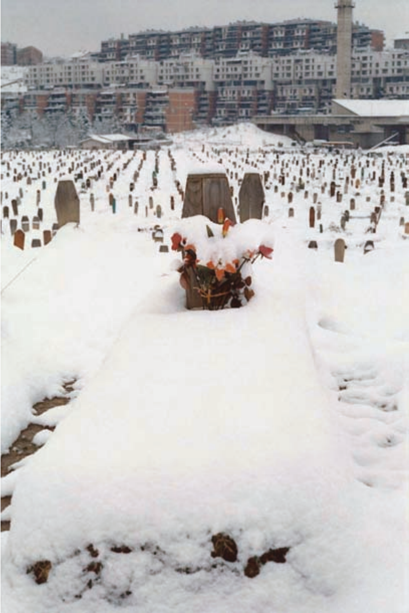
Sarajevo soccer field. December 1995.