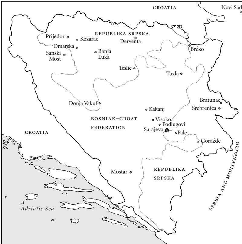
Bosnia and Herzegovina.