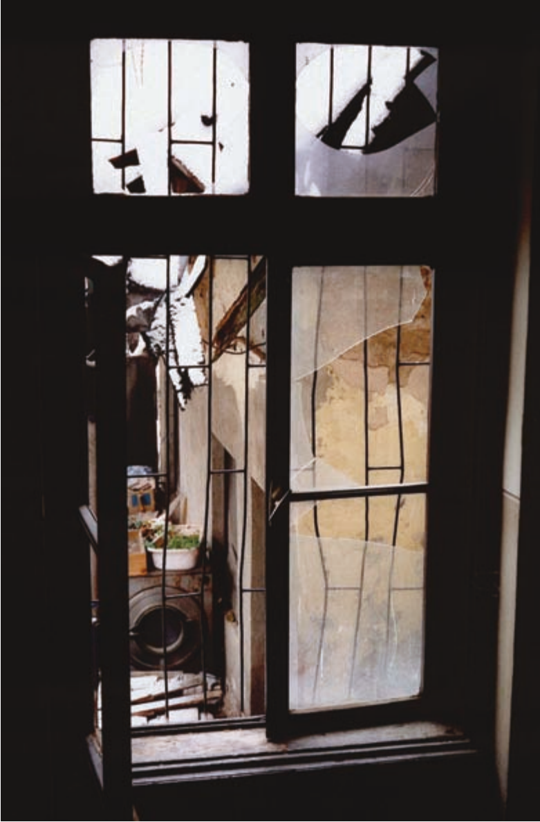
From the stairwell to the Zena 21 office. December 1995.