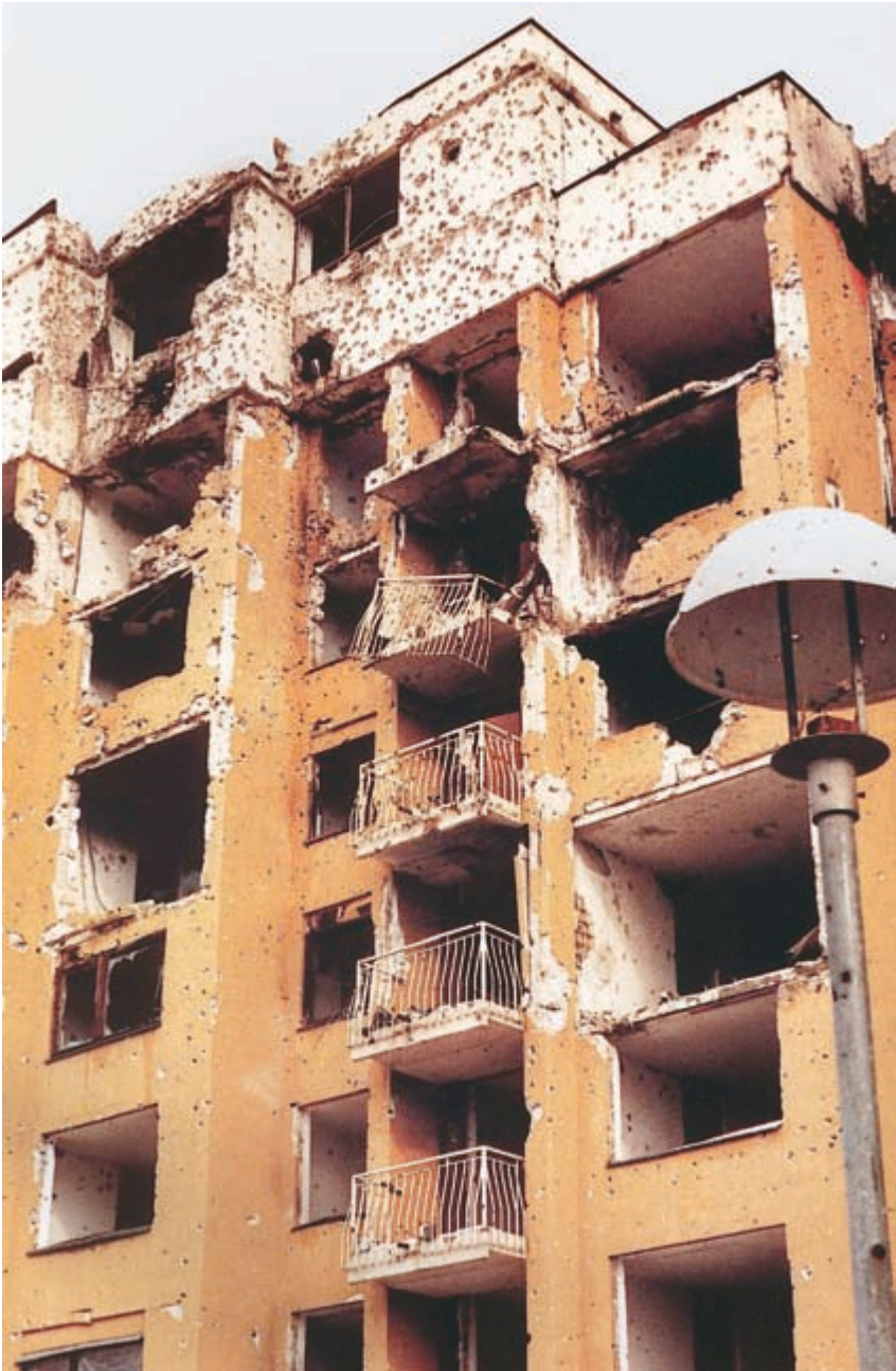
Olympic Village on the outskirts of Sarajevo. December 1995.