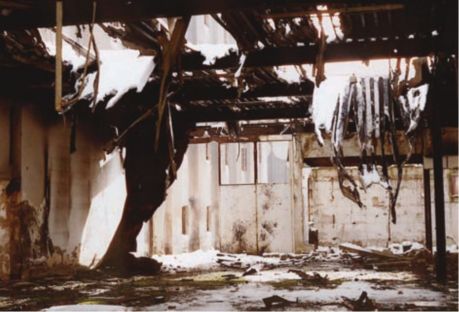
Along the main road from the airport to Sarajevo. December 1995.

had to protect themselves, psychologically as well as physically. We were on our own—defending our people.