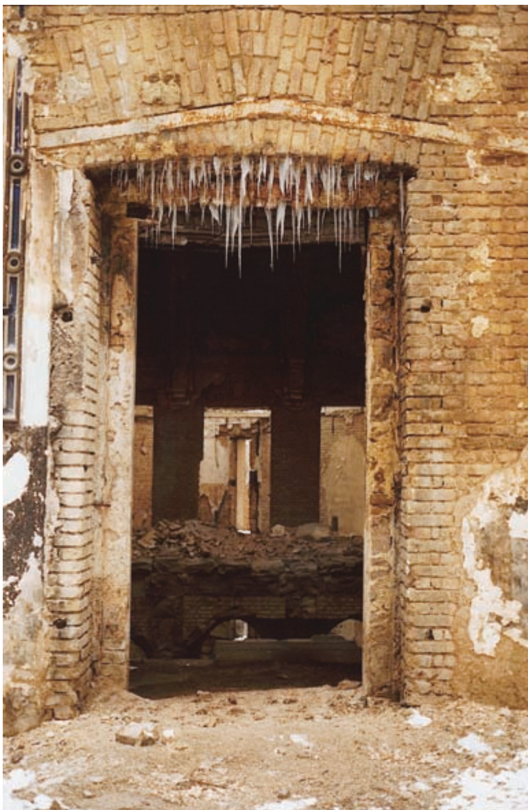
Inside the National Library in Sarajevo. December 1995.