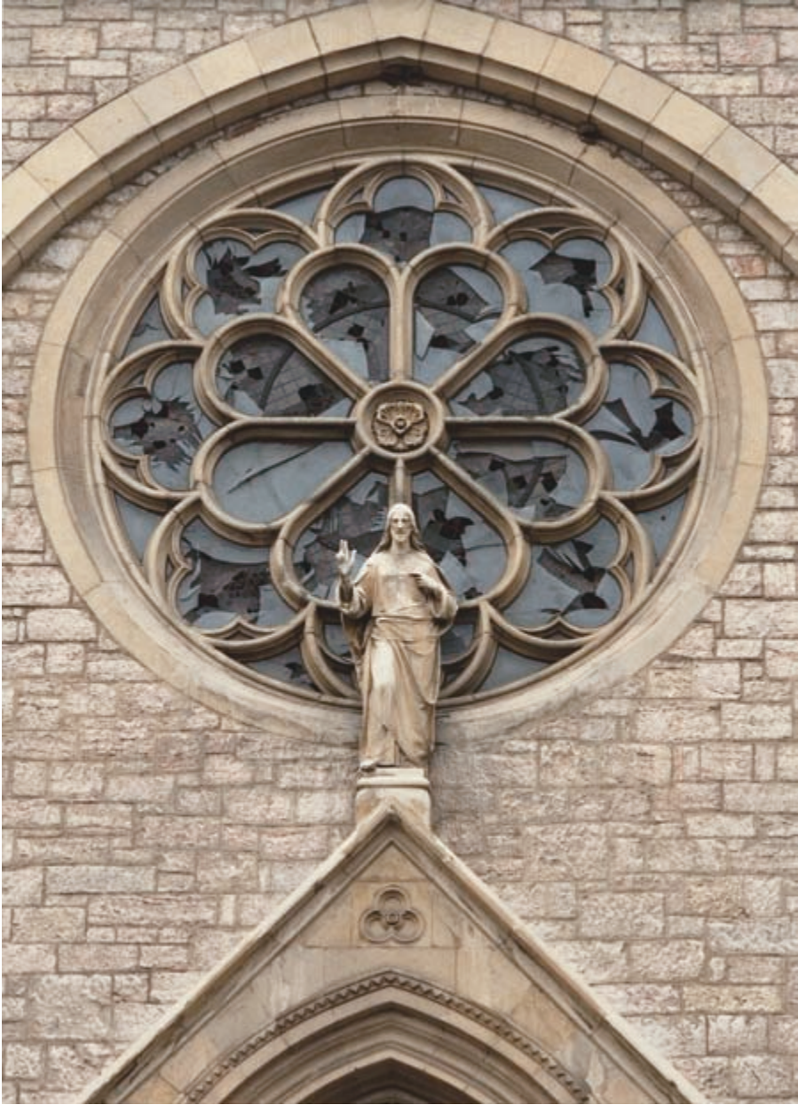
Shattered blessing. December 1995.