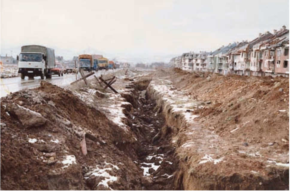
Exodus of Serbs from Sarajevo, alongside trenches used to avoid snipers. December 1995.

They had a vacation home in the mountains an hour-and-a-half from the town where they lived.