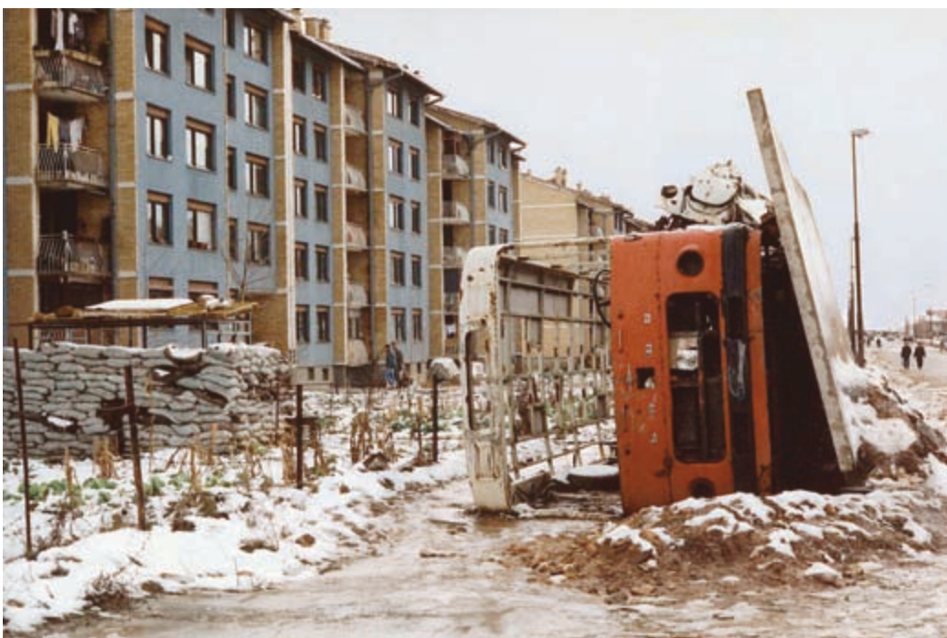
Bus becomes barricade. Dobrinja, suburb of Sarajevo. December 1995.