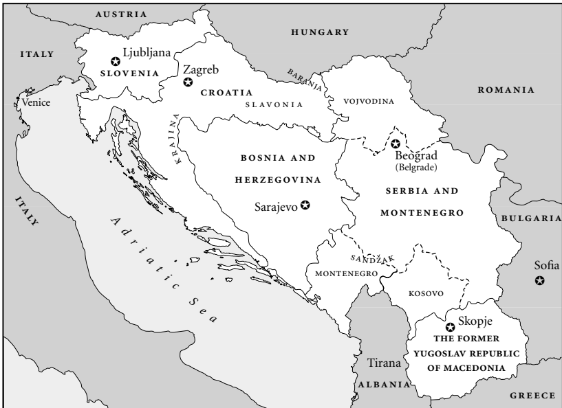
Former Yugoslavia.