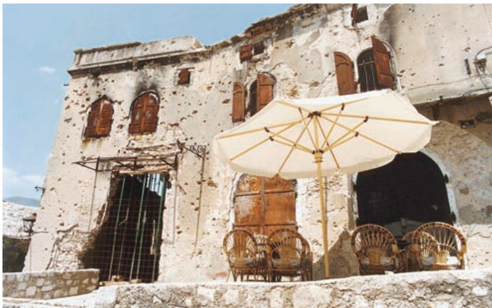
Mostar café life. July 1997.

respect. That sense of self is critical, for ultimately she has no one to turn to except herself. If I hold myself back, I can't expect someone to come along and rescue me. In fact, even comfort from others comes at an unacceptable price. No one can feel the pain of my wound. They can only show compassion. Then I feel like I've become a beggar. I feel better when I protest.