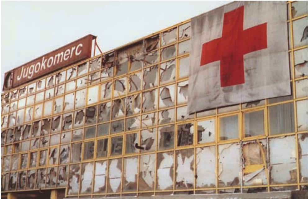
Commerce shattered under siege. December 1995.