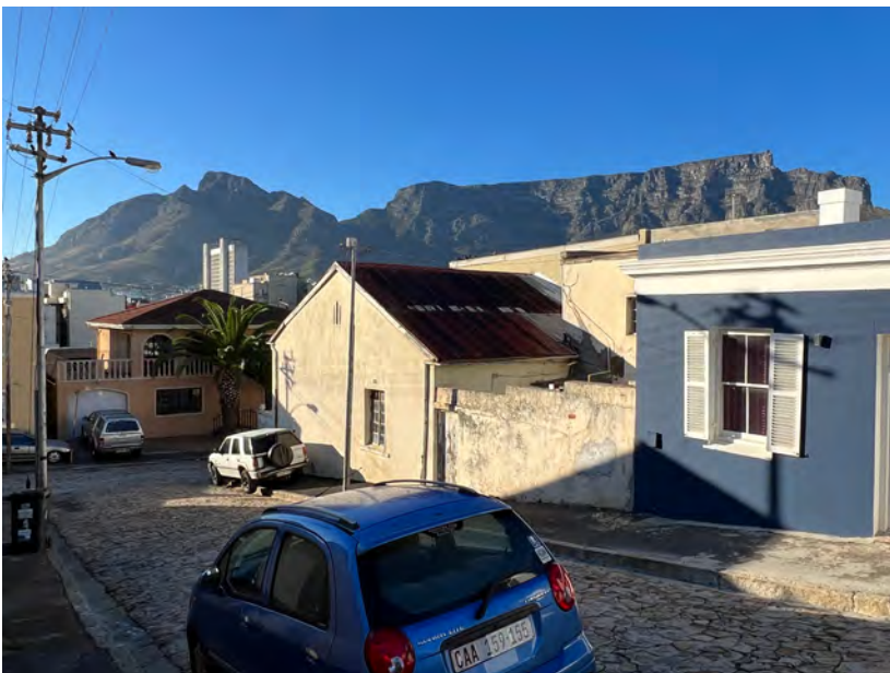
6 Morris Street, with Table Mountain in the background, as viewed in February 2022