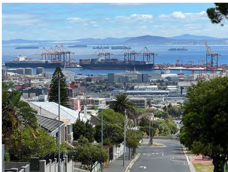
Rhoda’s house, on the slopes of Devil’s Peak, overlooked Woodstock below and Table Bay beyond