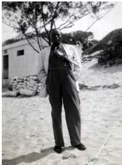
Clements Kadalie, undated