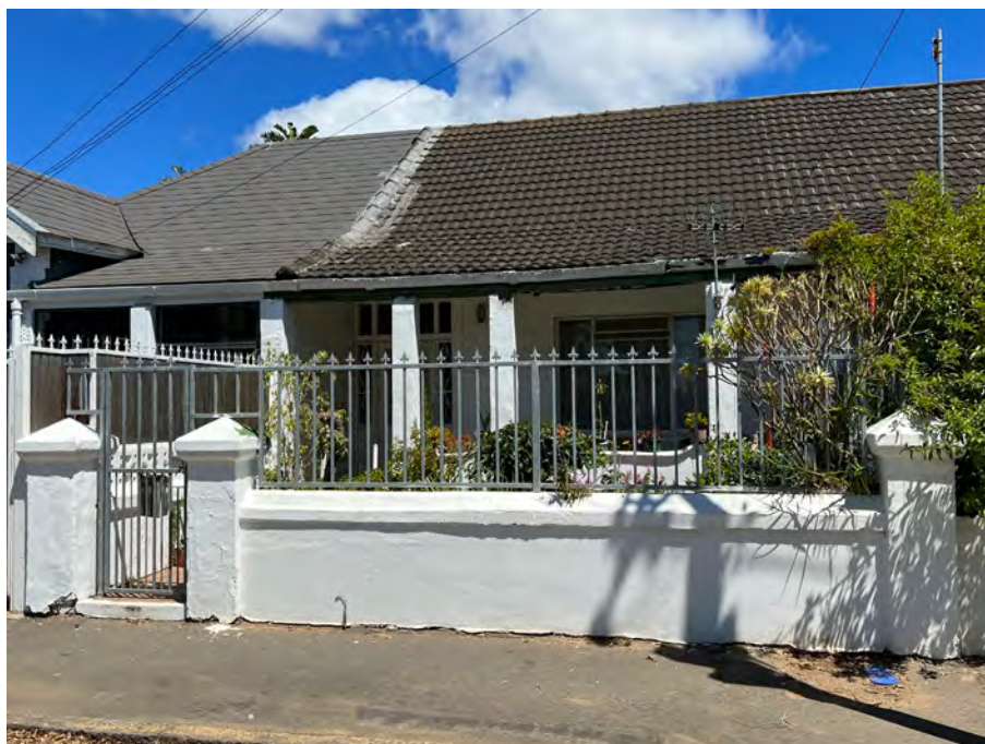
Rhoda and Richard’s first home in Observatory as viewed in February 2022

Rhoda’s memory of moving in was similar: as she remembered, their neighbor informed them: “Don’t worry – your neighbours are either drunkards or dykes. You’ll just fit in.” 23