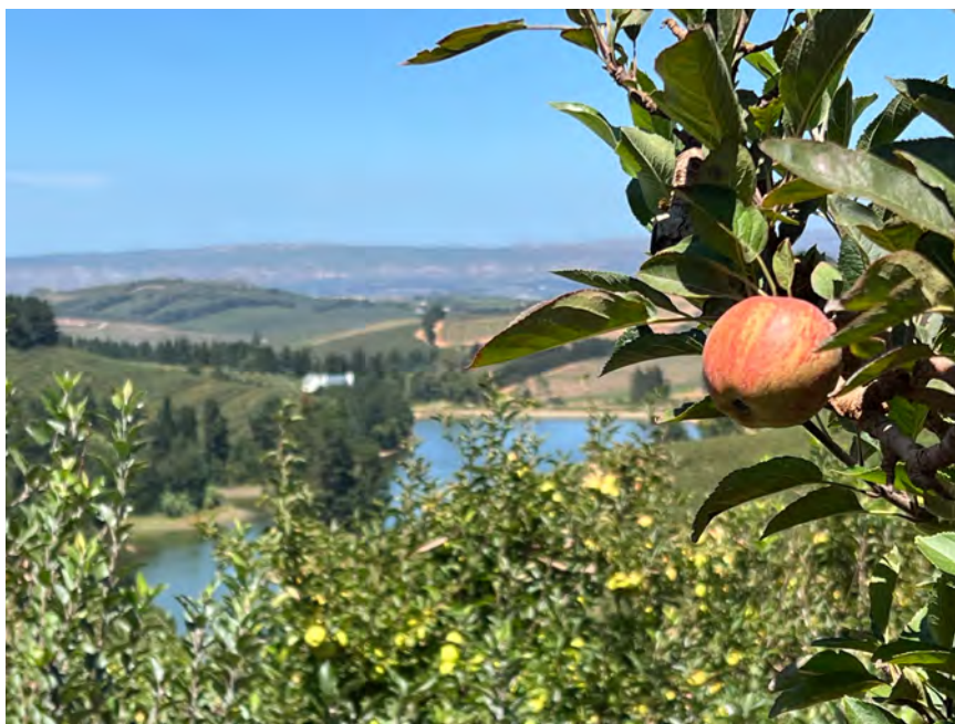
A ripe apple growing in a hillside orchard on the Molteno Brothers farm, Grabouw, Western Cape

Rhoda: 'Comrade Kadalie, You Are Out of Order!'