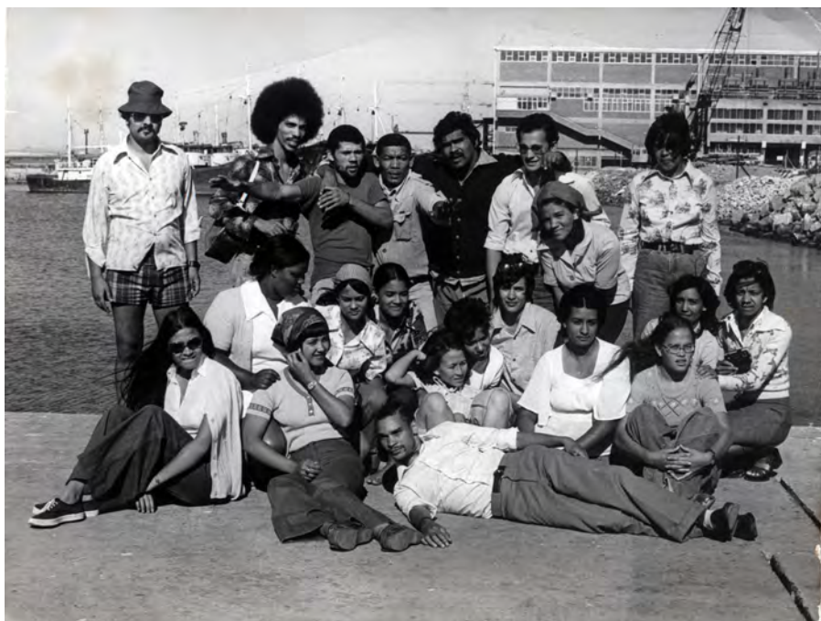
UWC Anthropology Society, in Saldanha, Western Cape, c. 1975

Rhoda: 'Comrade Kadalie, You Are Out of Order!'