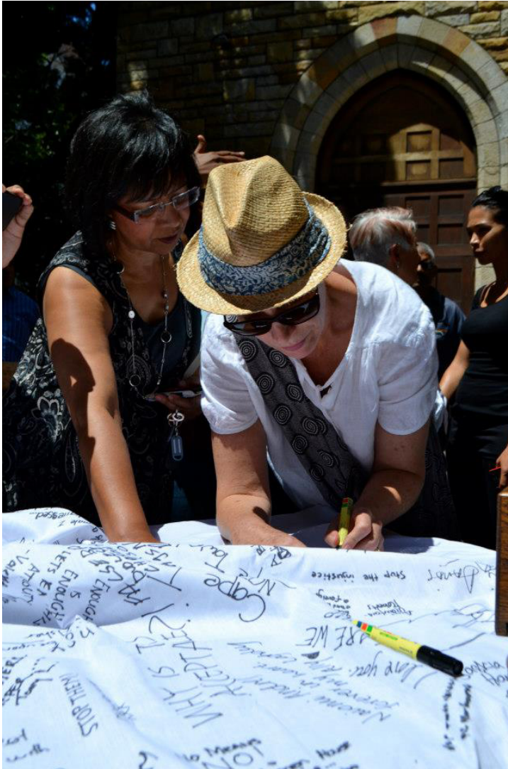
Rhoda watches as Eurythmics legend Annie Lennox signs a petition against rape outside St. George's Cathedral, Cape Town, 2013 (Courtesy Rhoda Kadalie)]

She continued to use her column to speak out about the “silent epidemic” of rape preying on South African women and girls. 74