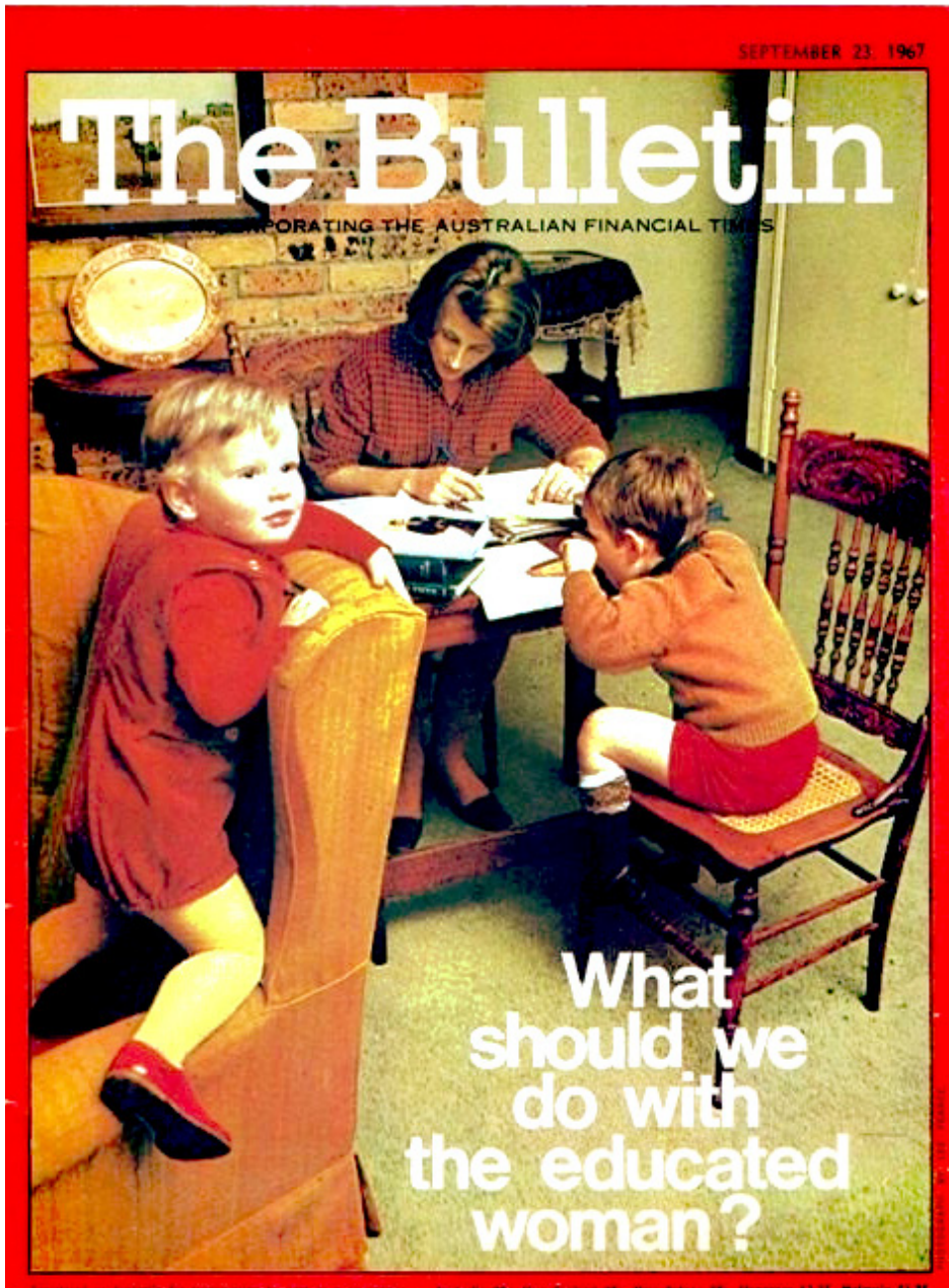
Figure 3.1 Cover story, The Bulletin , 23 September 1967

of women into higher education and the increased demand for women in the labour market. Attitudes were slow to shift, however, and were patronising in a way that would be totally unacceptable today.