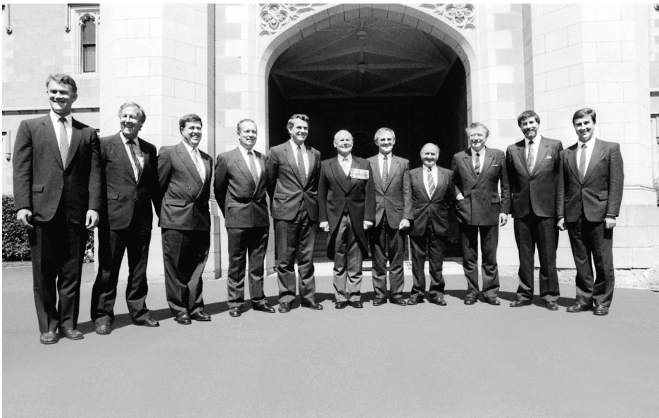
Figure 3.3 Tasmanian Cabinet. The Mercury , 19 February 1992, p. 2

vigorous action to ensure the presence of women in their parliaments, and more than 100 countries have adopted some form of electoral quota for women. The presence of women in elected office at local government level was even lower (28 per cent) than at the parliamentary level across Australia (31.6 per cent). 14 Nonetheless, it is now widely accepted in Australia, as elsewhere, that male-dominated political representation implies a democratic deficit, making it clear that there is ‘something wrong with the picture’ in cases such as the all-male 1992 Tasmanian Cabinet.