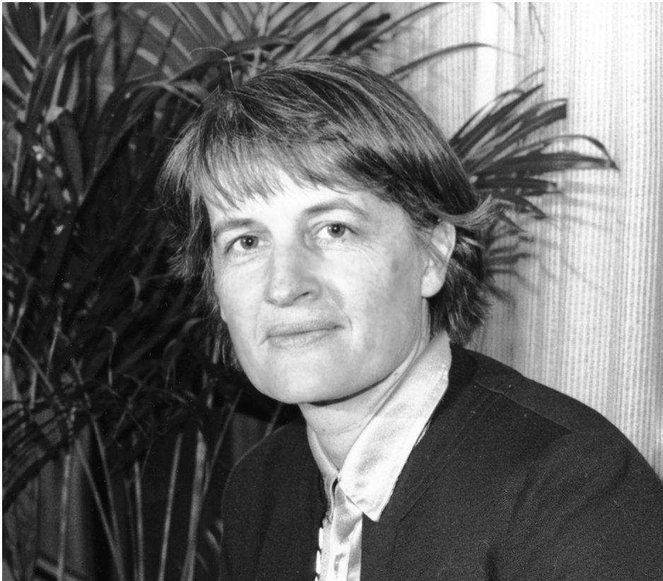
Figure 3.4 Justice Elizabeth Evatt