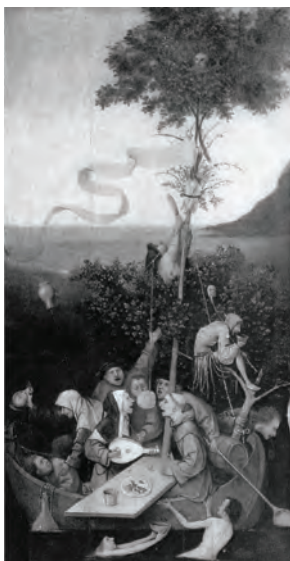
Fig. 1. Hieronymus Bosch, Ship of Fools (1490–1500)