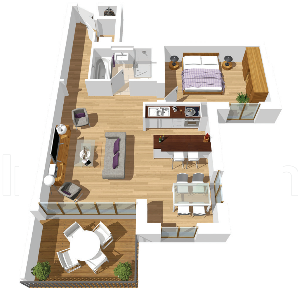
Figure 1. Model of the apartment used in the competitions.