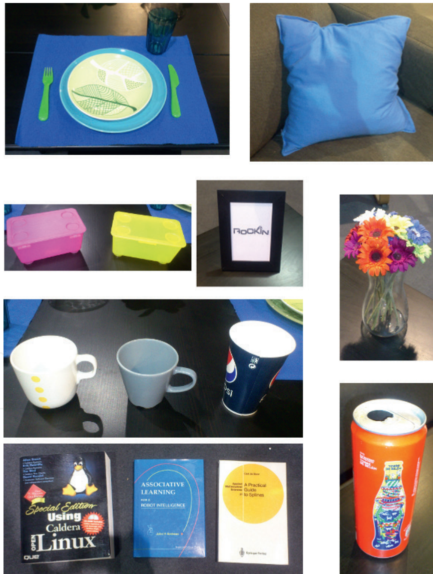
Figure 2. Objects used in TBM1.