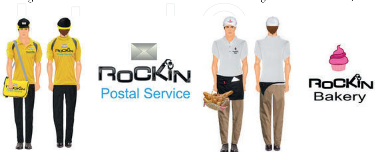
Figure 3. Visitor uniforms for TBM2.