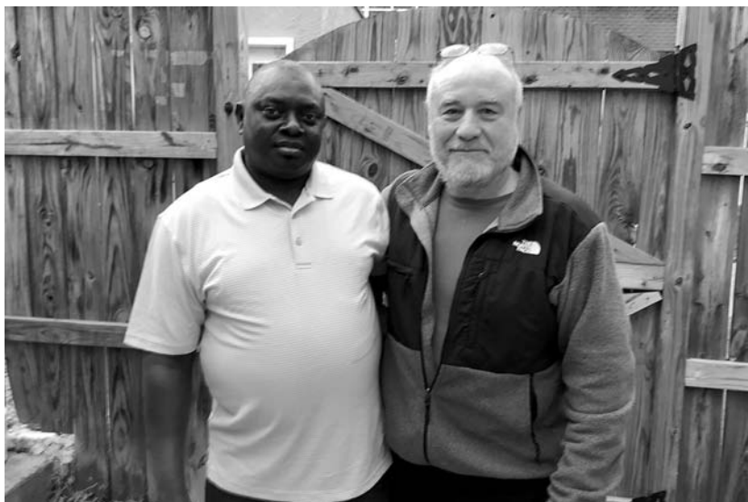
With the school director in Washington, DC, November 2017.

than my wife, not a single person knows, not even my children.” “Will you tell them before you leave?” I asked. “Only the night before, and only my children.”