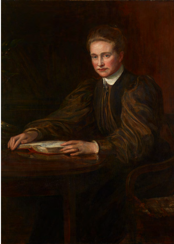
Figure 6: Millicent Fawcett, oil on canvas, by Theodore Blake Wirgman, 1898. Royal Holloway, University of London. Licensed for use.