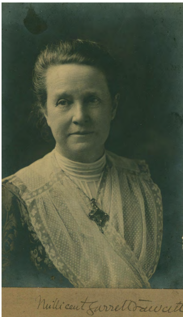
Figure 16: Millicent Garrett Fawcett by Lena Connell , 1914, with Fawcett's signature. From the Women's Library at LSE. No known copyright restrictions.