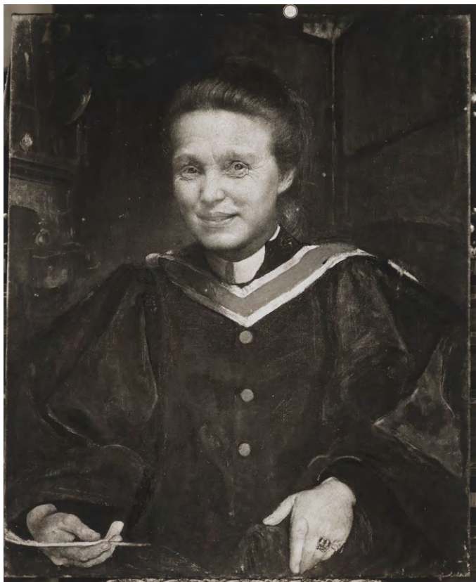
Figure 12: Dame Millicent Fawcett, CBE, LLD, by Annie Louisa Swynnerton. Preparatory oil painting, likely painted c. 1910. Sold at Christie's London in 1959 (when the photograph was taken), Sotheby's in 1970 and Christie's again in 1973. Current whereabouts unknown.