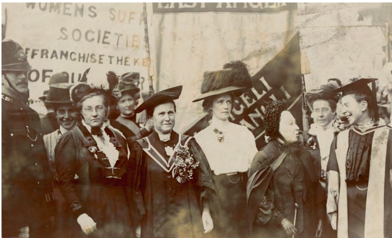
Figure 7: NUWSS procession, 13 June 1908. From front left to right: Lady Frances Balfour, Millicent Fawcett, Ethel Snowden, Emily Davies and Sophie Bryant.