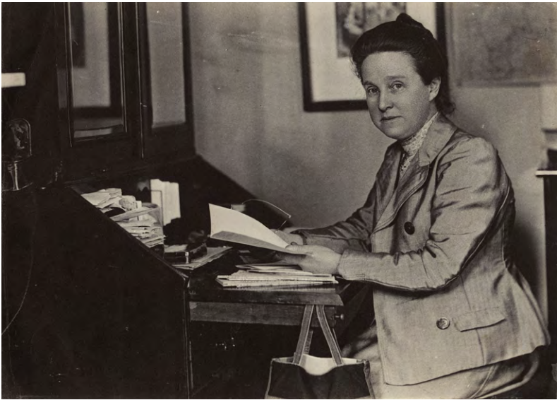
Figure 8: Millicent Fawcett, 1908, matte bromide print by O. and K. Edis.