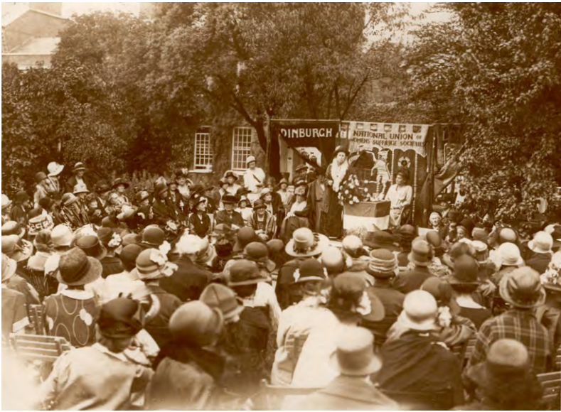
Figure 18: Dame Millicent Garrett Fawcett speaking in the garden of Aubrey House at a party organised in her honour by NUSEC on Thursday, 23 July 1925.