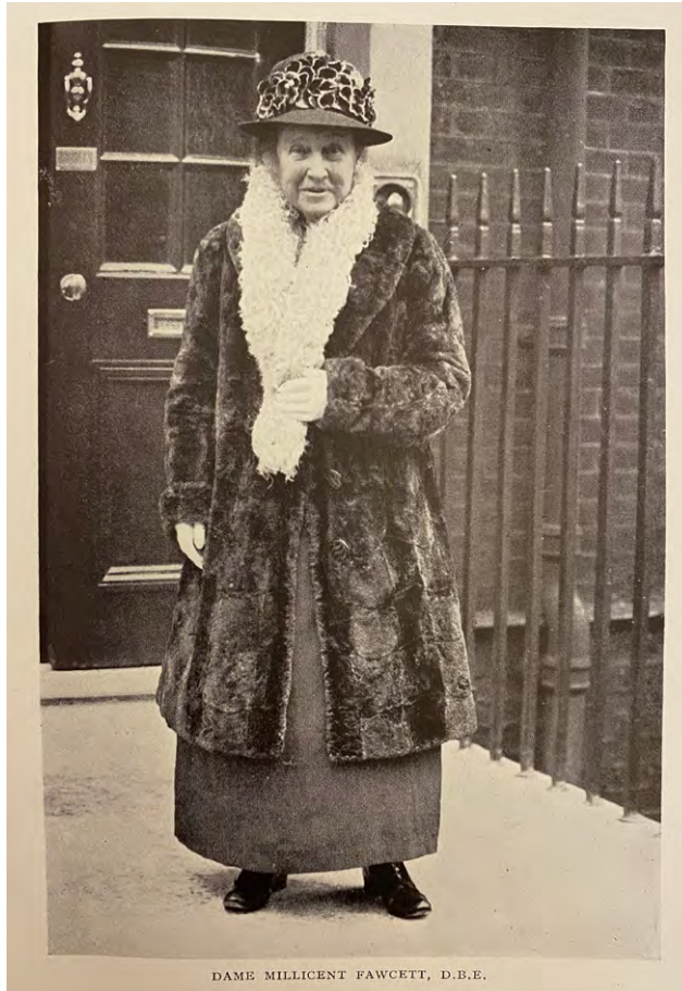
Figure 17: Fawcett photographed outside her home at 2 Gower Street, London, on the day of her investiture as Dame Grand Cross of the Order of the British Empire (GBE) on Thursday, 12 February 1925. The Topical Press Photographic Agency, 1925. In Lang (1929, 91). No known copyright restrictions.