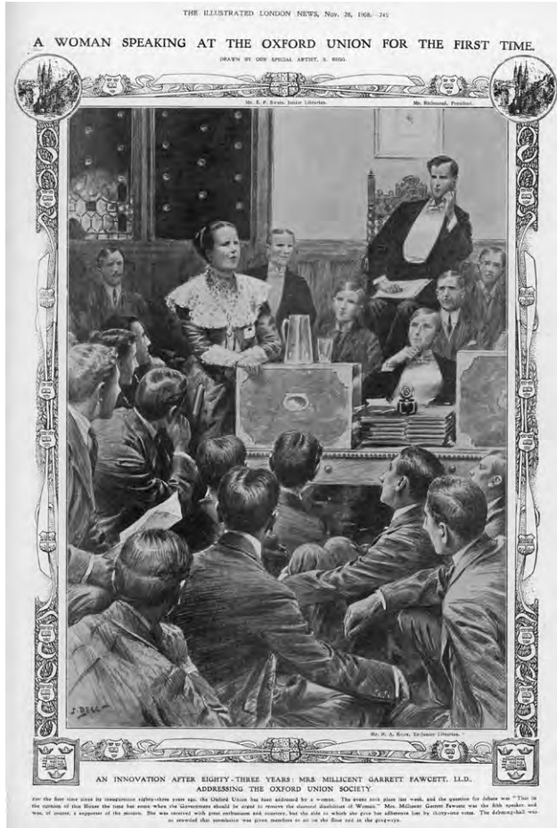
Figure 9: 'A woman speaking at the Oxford Union for the first time'. Illustration by Samuel Begg. Illustrated London News (November 1908, 745).