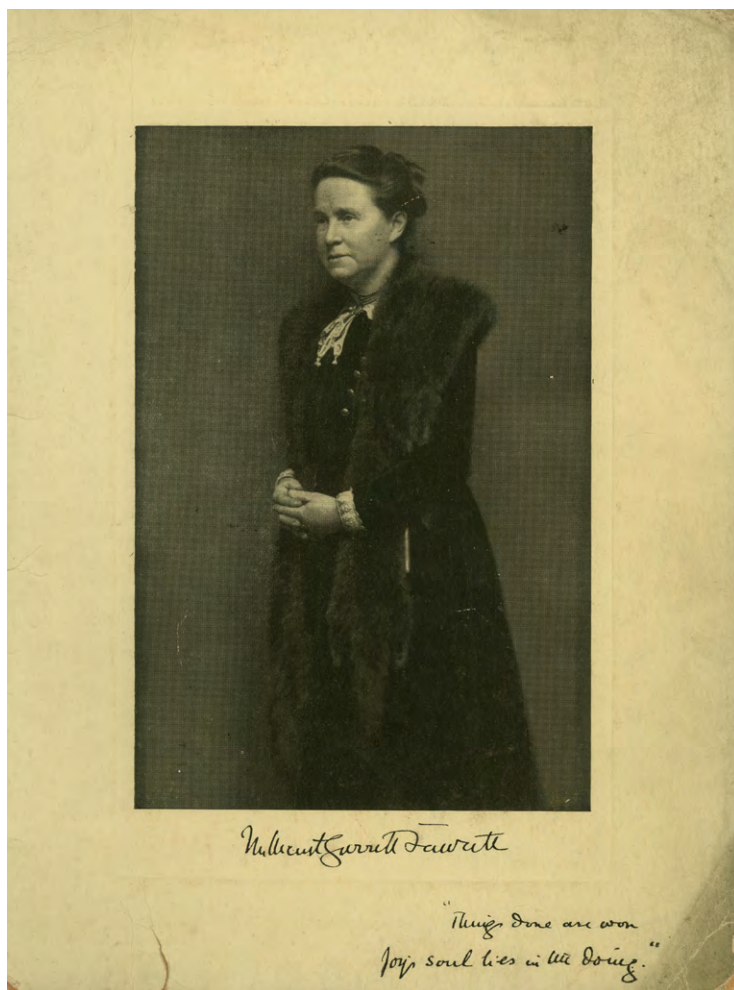
Figure 14: Millicent Garrett Fawcett, bromide print by Lizzie Caswall Smith, 1912, with Fawcett's signature and quote from Troilus and Cressida . 1 From the Women's Library at LSE. No known copyright restrictions.