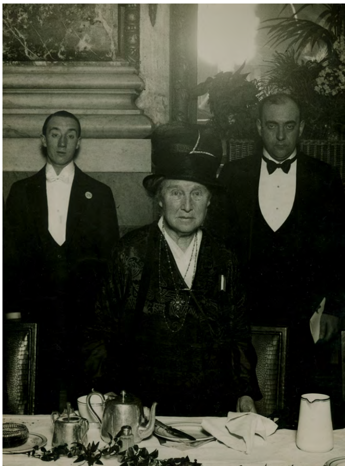
Figure 21: Dame Millicent Fawcett at the Victory Breakfast, Hotel Cecil, Thursday, 5 July 1928. From the Women's Library at LSE. No known copyright restrictions.