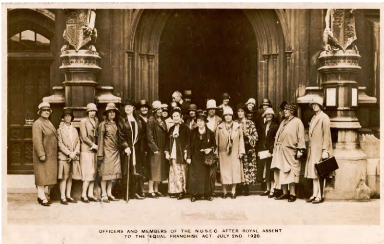
Figure 19: 'Officers and members of the National Union of Societies for Equal Citizenship, after the Royal Assent to the Equal Franchise Act', 2 July 1928. Postcard. From the Women's Library at LSE. No known copyright restrictions.