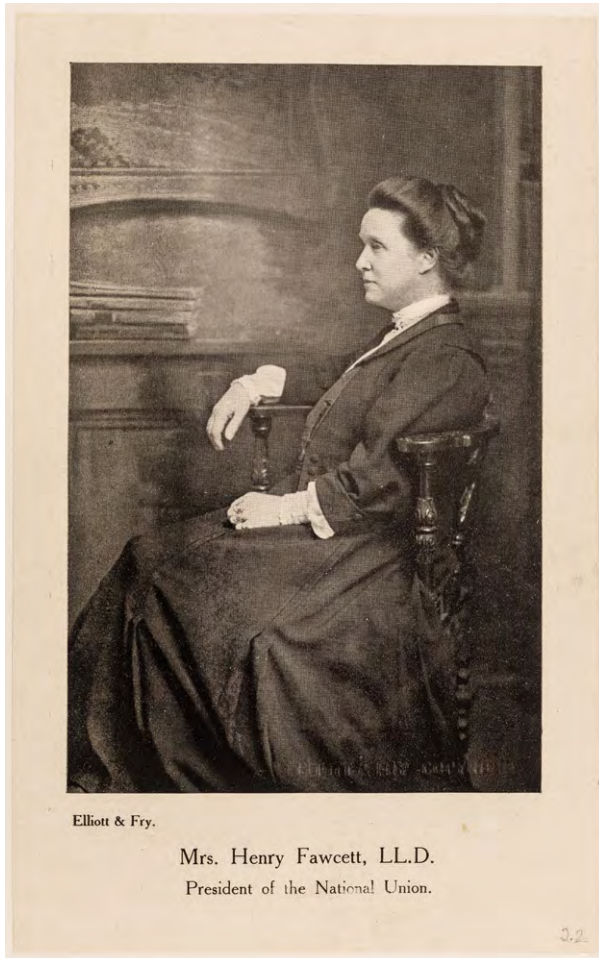
Figure 11: Mrs Henry Fawcett, LLD, president of the National Union, 1909. Elliott & Fry, London. No known copyright restrictions.