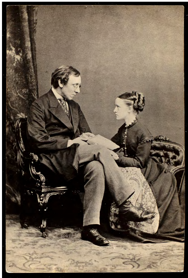
Figure 1: Millicent Garrett Fawcett with Henry Fawcett, 1868, by Henry Joseph Whitlock. From the Women's Library at LSE. No known copyright restrictions.