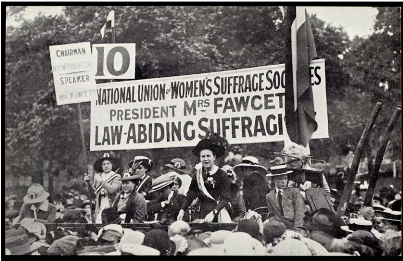
Figure 15: Millicent Fawcett's Hyde Park address on 26 July 1913. Postcard. Photograph taken by Central News Agency, originally featured in the Daily Telegraph on 28 July (1913), reprinted in the Common Cause on 1 August (1913i) and the Illustrated London News (1913) on 2 August. From the Women's Library at LSE. No known copyright restrictions.