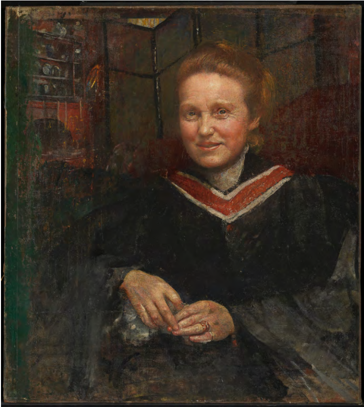
Figure 13: Dame Millicent Fawcett, CBE, LLD, by Annie Louisa Swynnerton. Exhibited 1930, likely painted c. 1910. Oil on canvas.