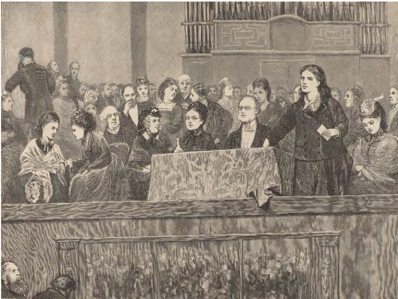
Figure 2: ‘Women’s rights – A meeting at the Hanover Square Rooms’ in the Graphic (1872). No known copyright restrictions. Digitised from editor’s own copy.