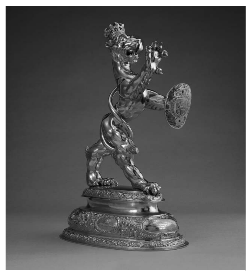
Figure 2: Lion drinking cup, Emanuel Jenner, 1690. Historisches Museum Bern.

bribery to attain political goals. Despite all good intentions, no treaty was concluded in the late seventeenth century, however. Towards the end of the War of the Spanish Succession, there were new talks about a defensive treaty with the Netherlands, which finally materialised in the Alliance of June 1712. Saphorin played an important role in these negotiations. Berne eventually delivered 3,200 to 4,800 mercenaries during peacetime, and a further 4,000 in the event of war, whereas the Dutch would pay contributions to the equivalent of twenty-four mercenary companies should the canton be attacked. It was the first time that a Swiss canton accepted a formal alliance treaty without pension payment.<sup>17</sup>