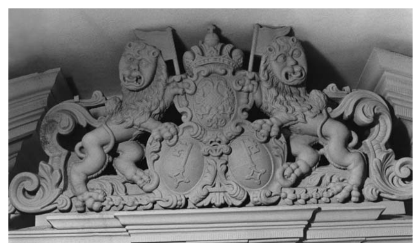
Figure 1: Supraporta of the town hall of Obwalden in Sarnen around 1730.

pointed by the Emperor, but had already been an elected community representative for centuries. Still, the reference to the medieval office of the Reichsvogt shows why the original cantons maintained their imperial symbols for so long. The reeve represented the Emperor as the source of all legitimate authority and his most noble duty consisted of presiding over capital punishment trials. This is why even the patrician governments in Berne and Luzern continued to pronounce the death sentence using the phrase 'according to imperial law' (nach Inhalt keÿserl. Rechtens ) until 1730.<sup>22</sup> This formula did not refer to positive law of the Empire, such as Charles v's Constitutio Criminalis Carolina, but to the Emperor as source of jurisdictional power. However, these references could mean more than just a framework of legitimacy, especially in the Catholic rural cantons. Unlike the hostile Protestant cantons, most of these petty states were so small and weak that their independence depended on the moral and political powers of the Emperor and the Pope. The conservative, static, 'medieval' notion of political order therefore seemed to suit them best.