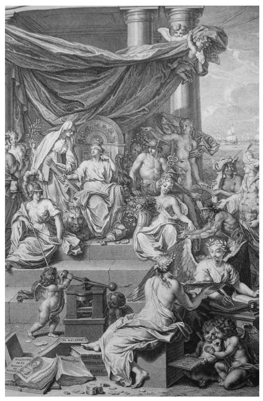
Figure 3: Frontispiece of Jean le Clerc, Histoire des Provinces unies des Pays-Bas (Amsterdam 1723).