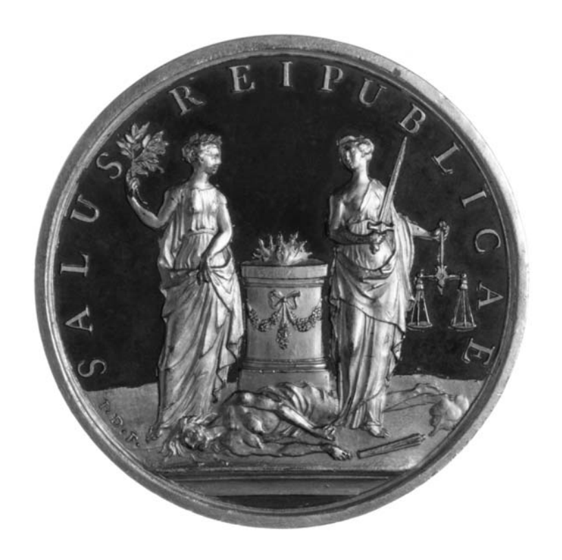
Fig. 9: Jean Dassier, Medal of the Genevan Mediation , 1738, reverse, gilt bronze, 54.7 mm, Cabinet de numismatique, Musée d'art et d'histoire, Geneva.