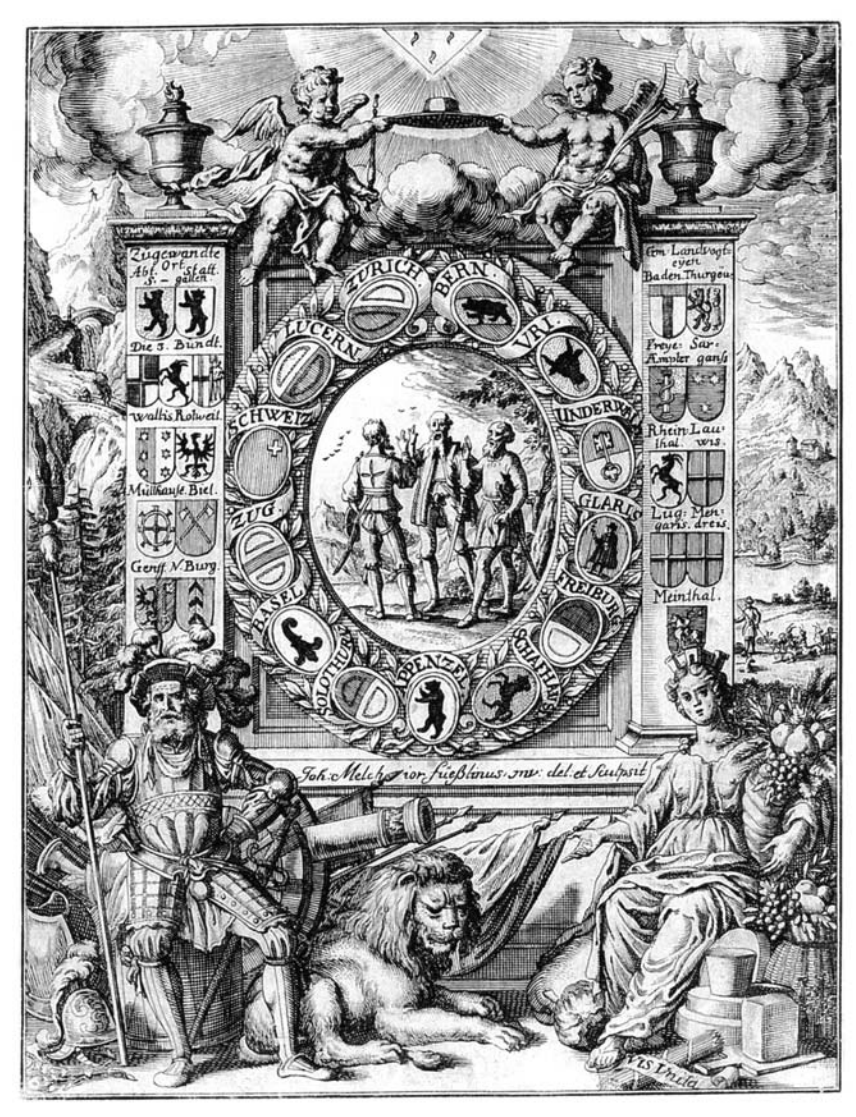
Figure 2: Frontispiece of Josias Simler, Von dem Regiment der Lobl. Eydgenossenschaft (Zurich 1722). Zentralbibliothek Zürich, Switzerland.