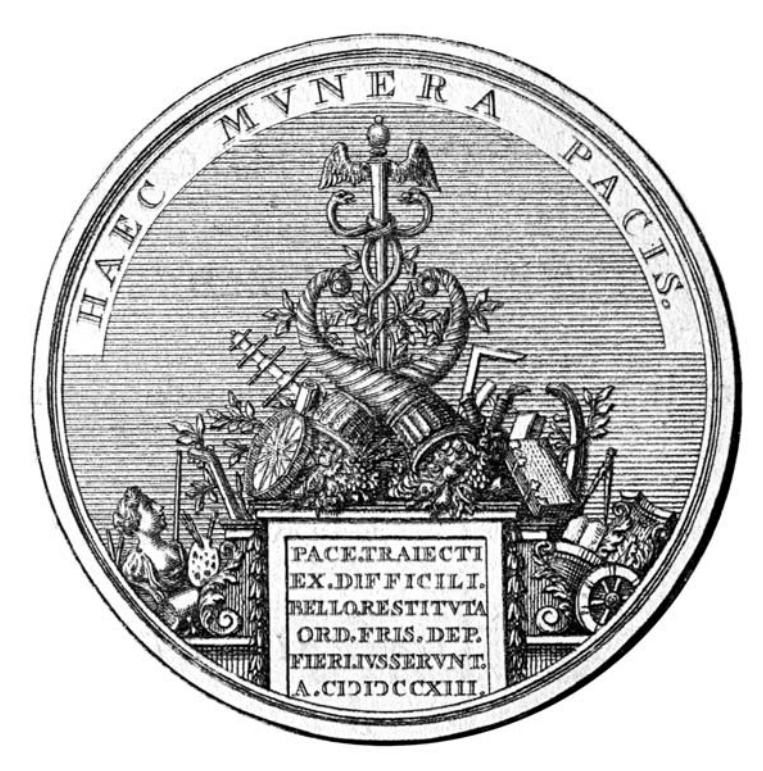
Fig. 8: After Jean Drappentier, Commemorative medal of the Peace of Utrecht (1713), reverse, engraving from Van Loon, v, 1737, p.227, n. 1.

The obverse is a rather free rendition of the standard portrait by the French painter Hyacinthe Rigaud; the rigid formality of the picture is broken by the vivacious expression and dishevelled hair of the medallic bust. Once again, Dassier's model for the reverse was Dutch. Both text and image were based upon a work executed for Friesland by Jan Drappentier commemorating the Peace of Utrecht (1713) marking the victory of the Netherlands and its allies over the ageing Louis XIV (fig. 8).<sup>28</sup> The Dutch medallist designed a trophy composed of the instruments of all manner of art (painting, sculpture, architecture, navigation, etc.) with a caduceus as the central motif. Dassier merely inserted Hercules's club within Mercury's attribute and modified the original legend HAEC MVNERA PACIS. (Such are the fruits of peace) into a text paying tribute to Fleury's sagacious policies which reversed the failures of the Sun King's declining years.