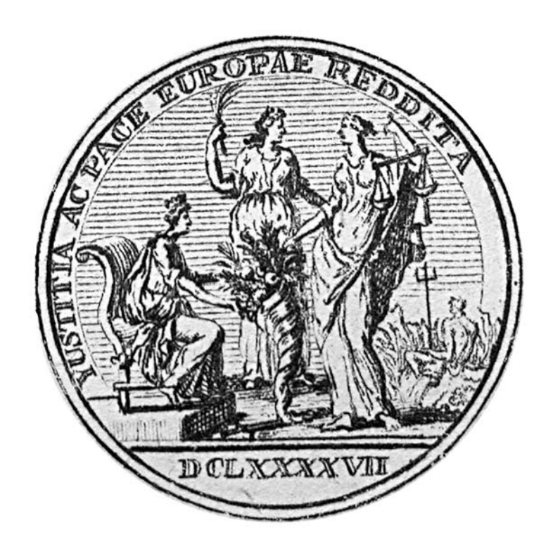
Fig. 6: Unknown artist, Commemorative medal of the Treaty of Rijswijk (1697), reverse, engraving from Van Loon, IV, 1736, p. 266, n. 24.

Dassier's Liberty appears to have been inspired by yet another Dutch medal, celebrating the partial demilitarisation of the Netherlands following the Peace of Aachen in 1668, in which the United Provinces are represented by a standing female figure holding a pole surmounted by a Liberty cap.<sup>24</sup> In contrast to its cold reception of the Le Fort medal, the government's reaction to Dassier's latest venture was positive. The Conseil thanked the artist and offered two louis d'or to his assistants. The favourable response suggested that the government may have considered appropriating the medal for its own political purposes.