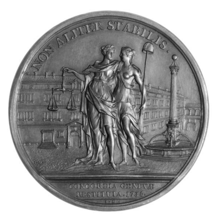
Fig. 5: Jean Dassier, Concord Restored in Geneva (Justice and Liberty), 1736, reverse, silver, 55 mm, Cabinet de numismatique, Musée d'art et d'histoire, Geneva.

led to a bourgeois rally which was promptly disrupted by the government. A truce was arranged on 18 February, after which the regime granted legal representation to the accused, a minor concession in view of the fact that such rights were an integral part of the edict of 1734. Dassier's medal (fig. 5)<sup>22</sup> therefore celebrates an event which could hardly be viewed as a victory for his own faction. The legend engraved in the exergue on the reverse, CONCORDIA GENEVÆ RESTITUTA, distorts its meaning and exaggerates its importance. The work's production can best be viewed as the expression of a desire for peace and reconciliation