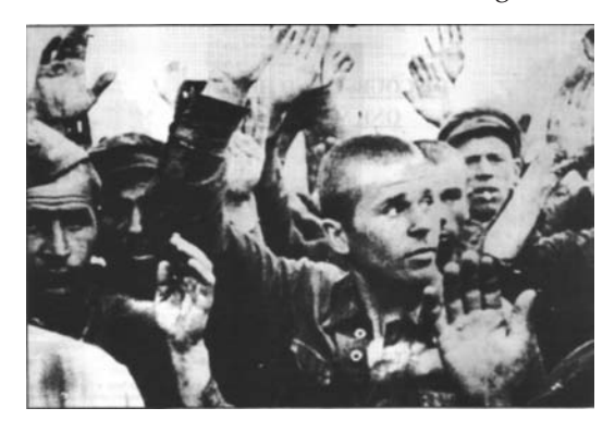
ONE MAN'S WAR

Yes. As far as documentary is concerned, I always feel that fiction films are the best documentaries of any period for they allow the imaginary to speak, which in the bad sense of documentary is forbidden.