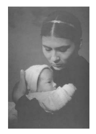
GERMANY PALE MOTHER

hinted at, its other export to the US in the 1970s and 1980s were narratives and images of its national disaster. The New German Cinema became critically successful and culturally significant when it began to "represent" its terrible history in the form of stories about Nazism and the war. Virtually all of the films still remembered from the New German Cinema have this twelve-year period and its aftermath as their direct or indirect topic (The Tin Drum, Our Hitler, The Mar-RIAGE OF MARIA BRAUN, LILI MARLEEN, THE GERMAN SIS-TERS, GERMANY IN AUTUMN, THE PATRIOT, THE POWER OF FEELINGS, GERMANY PALE MOTHER, HEIMAT, and WINGS OF DESIRE). We may think this is because of the quality of the films or the gravity of the subject matter, but in the US it is Nazism that carried a special recognition value for the signifier "Germany" within popular culture. It has been and still is a taboo-breaking, transgressive signifier, emotionally, ideolo-