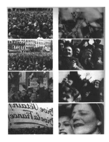
ONE MAN'S WAR

The only such point of reference occurs very near the beginning. After the parade on the Champs Elysées there is a series of shots of German street signs which follow a kind of itinerary from the Place de la Concorde to the Opéra. I kept them as a travelogue of Paris in 1940. Instead of