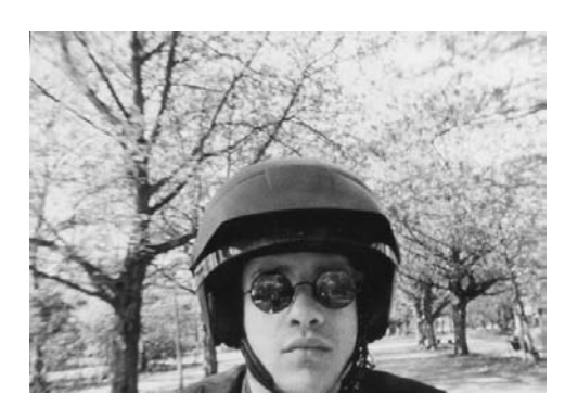
Amsterdam Global village

Perhaps I can illustrate what I mean by the more benign, symbolic and discursive forms that double occupation can take, with a scene from a documentary by Johan van der Keuken, Amsterdam Global Village (1996). By following the delivery rounds of a courier on a motorcycle, the director follows the lives of several immigrants who have made their life in Amsterdam: A businessman from Grosny, a young kickboxer from rural Thailand, a musician from Bogota who works as a cleaner, a woman discjockey from Iceland, a photographer,