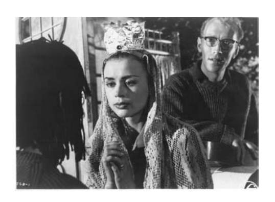
THROUGH A GLASS DARKLY

By making this dialectic of visceral impact and spatial restraint both the center and the structuring principle, Bergman had, in my judgment, created especially with Persona a uniquely modernist film, where the modernist topos of appearance vs. reality found itself explored across that specifically cinematic mode of meaning-making we call "violence," which is not necessarily the violence on the screen, but the always implied violence of the screen. It gave Persona a different kind of vantage point, for it made an appeal to this fundamental tension of the cinema as a medium of reflection across an assault on the senses, in order to give thematic substance and formal coherence to the logic of its