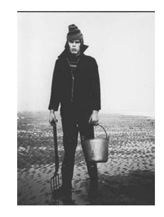
THE FLAT JUNGLE

chanced upon, almost by accident, but which comes to determine the means and manner of communication finally structuring the film as a whole. Then there are others, such as the farm workers and fishermen in The Flat Jungle whose "handicap" is more subtle, and often merely the reverse side of their special gift. Their marginal position in relation to the ordinary world means that they have a much more penetrating and thereby also defamiliarizing perception of what passes as "normal." Hence the recourse in Van der Keuken's films to blindness, deafness, and blocked senses, because they work as magnifying glasses on the broken, blocked and fragmented relation we all have to so-called reality, except that we rarely allow ourselves such an admission, preferring to pretend that we know what is what, and are in control of the bigger picture.