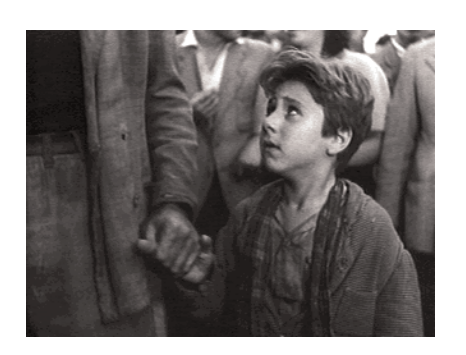
THE BICYCLE THIEF

If this is now a commonplace about Hollywood, it is just as true for European art cinema. The qualities for which filmmakers were praised were not necessarily what the audiences liked about their films, and what made them famous was not always what made them successful. In the case of Italian neo-realism, for instance, the aesthetic-moral agenda included a political engagement, a social conscience, a humanist vision. Subjects such as post-war unemployment, or the exploitation of farm labor by the big landowners was part of what made neo-realism a "realist" cinema, while the fact that it did not use stars, but faces from the crowd made it a "poetic" cinema (to come back to Weightman's comments on Ingmar Bergman). Yet as we know, a film like Rome, Open City (Roberto Rossellini, 1946) which is ostensibly about the bravery of the Italian