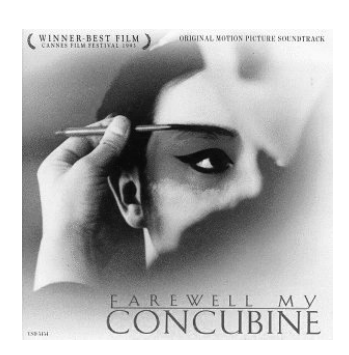
FAREWELL MY CONCUBINE

Together with the winners of Cannes, Venice, Berlin, the Miramax titles thus constitute the season's mini-hits (or "indie blockbuster"), and they often do so, on a global scale, for a world public. For just as one finds the same Hollywood movies showing in cinemas all over the world, chances are that the same five or six art cinema hits will also be featured internationally (titles like Talk to Her, Lost in Translation, Elephant, The Fast Runner, Nobody Knows) as if there is, with respect to cinema, only one single global market left, with merely the difference in scale and audience distinguishing the blockbuster from the auteur film or "indie" movie. The latest medium budget European film will, along with the latest Wong Kar-wai draw – after due exposure at Venice, Cannes,