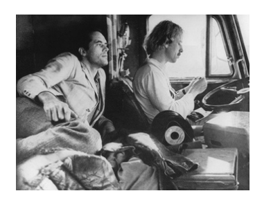
KINGS OF THE ROAD

In Wim Wenders' KINGS OF THE ROAD, perhaps the finest of films from the 1970s to meditate about a "national cinema," one of the protagonists, contemplating