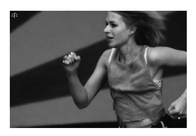
Run Lola Run

otherwise he's dead. Three times we see her start on her "race to the rescue," each time one slightly different micro-incident radically changes the course of events. The first time she arrives too late and Manni is killed by the police, the second time, she is killed trying to shield him, and the third time, she arrives in time, and Manni himself has found the money he had lost to a tramp. It is like winning the jackpot in a computer game that re-sets itself after each bout, but here balanced by the agonized pillow-talk between Lola and Manni separating the segments: "Why do you love me? – Why me?" Lola asks, to which Manni