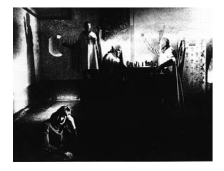
THE HYPOTHESIS OF THE STOLEN PAINTING

A wholly imaginary world comes into being which owes little to reality or fiction, and much to the cinema's power to conjure up presence from absence. The philosophy implicit here evidences a total skepticism about cinema's supposed realism. In one tableau , the voice-over commentary points out that respect for the