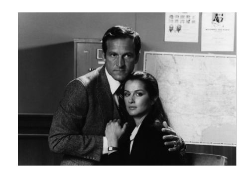
HILL STREET BLUES

With the demand for ever more finely calibrated categories of viewers, however, the rating system has itself entered a crisis and may eventually give way, as the gold standard did, to a more fluctuating and uncertain "exchange rate mechanism," with a "speculative" viewer economy of television in the global context existing alongside the old "ratings wars." In the speculative economy, prime time programs, expensive to make but with a mass-market audience ( Dallas, The Cosby Show ) compete with quality programs for highly defined minority