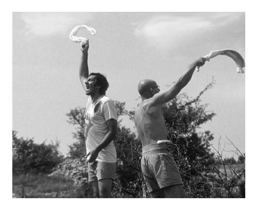
No Man's Land

with the victims ("imaginary identification"), and by making the victims "perform" their victimhood for the camera, the camera reproduces in this gaze upon them also the distance of that gaze (the "symbolic identification"), which is to say, the hidden knowledge that – as victims – these Bosnians (or whoever) pose no threat, make no demands, stake no claims (political, economic, religious) other than that of being treated as victims, which automatically reconfirms the West's position as benefactor, i.e., secure and powerful enough to