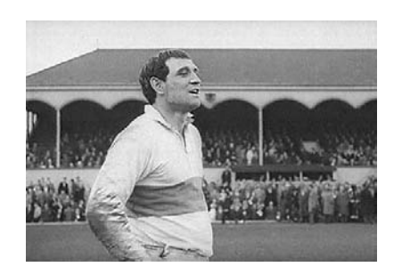
THIS SPORTING LIFE

British cinema celebrates its renaissances with such regularity because it always functions around another polarization – what one might call an "official" cinema and an "unofficial" cinema, a respectable cinema and a disreputable one. The renaissances always signal a turning of the tables, but only to change places, not the paradigms. Official: Basil Dearden, Noel Coward, David Lean; unofficial: Powell/Pressburger, Gainsborough melodrama. Official: Ealing co-