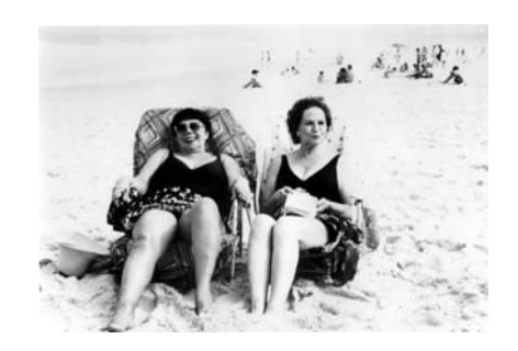
O Amor Natural