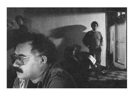
On Top of the Whale

HIGH SEAS is a Franco-Dutch co-production. By another deliberate and perhaps provocative irony, the French contributions – the director and the male star – are thus an Argentinian and a Pole. INA will mainly act as distributor in France and also hold television rights. All the other actors and the crew are