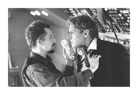
AIR FORCE ONE

Possibly realizing the artistically productive, but economically crippling, miscognitions in this self-understanding of a national or auteur cinema in a rapidly globalizing environment, a segment of Germany's filmmaking community turned away from such tormented love-hate relationships with Hollywood in the mid-1980s. Instead, they transformed the encounter with an imaginary America, mirroring an introspective and retrospective Germany still in thrall to