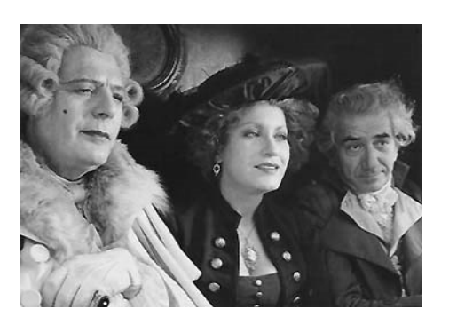
That Night in Varennes

And yet, history is made that night: there is a Revolution in Scola's film. It is not about politics, but about sex, and not about the Rights of Man, but the rights