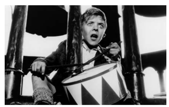
THE TIN DRUM

West Germany's cinephile identity formation around oedipal paradigms was broken up with the screening of the US-television series Holocaust in 1978 and 1979. Such was the shock at discovering American television "appropriating" the German subject par excellence that the New German Cinema "responded" with films by Volker Schlöndorff (The Tin Drum), Kluge (The Patriot), Syberberg (Hitler - A Film from Germany), Fassbin-