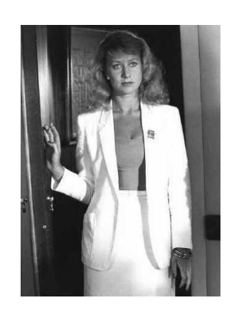
THE LONG GOOD FRIDAY

ing class males, violent and articulate, working class women, sexy and self-confident. No one would mistake this as realistic, yet the films that fit the scheme range from Letter to Breznev to The Draftsman's Contract, A Passage to India to The Last of England, My Beautiful Laundrette to Another Country, The Long Good Friday to Educating Rita. Most of these images of Britain sell better in Birmingham, Alabama than Birmingham, West Midlands, because they encapsulate what "we" try to sell to "them." But on closer inspection, one sees the films that did well in both places, whether coming from the "official" or the "unofficial" cinema, gave the myths a special edge, mixed the stereotypes in unexpected ways, or enacted the cliché to poignant perfection. Thus, they released a rich cultural sediment of meaning by which mem-