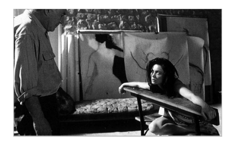
La Belle Noiseuse

Ultimately, it is this capacity to be a "realist text" and allegorical at the same time that makes LA Belle Noiseuse contemporary, and to my mind, an "intervention" rather than a conservative restatement. One might cite Borges and Roland Barthes: Rivette is re-writing a classical (readerly) text as an allegorical (writerly) text. As in the case of Barthes most famous allegorical rewriting of a realist text, Balzac's novella Sarrasine in S / Z , so the realist text of Rivette is also a novella by Balzac, Le