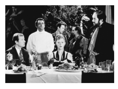
The Cook, The Thief, His Wife and Her Lover

faction about this medium and its history: "Just now that cinema celebrates its first centenary and is a medium ripe for the re-invention of itself, there is evidence to believe that all art moves towards the condition of film." If the "birth" of the cinema more or less coincided with the height of European Wagnerism, when Walter Pater could claim that all the arts aspired to the condition of music, and Stéphane Mallarmé – apparently contradicting, but in fact merely refining this