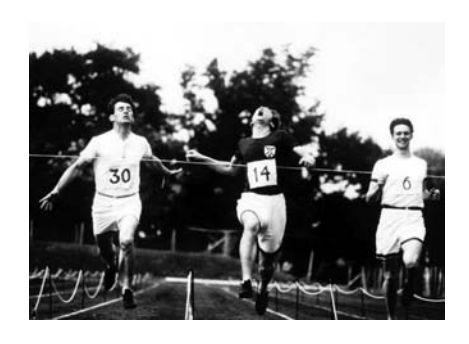
CHARIOTS OF FIRE

The 1980s, too, can boast of a runner's movie. Mention its title, and most people will grimace, trying to hum its theme tune. The three or four chords that make up Vangelis (Papathanassion)'s score have stayed in people's ears longer than they cared for, and now are probably as (in)famous as Beethoven's "ta-ta-ta-taa." This film is, again, set in Britain, even based on historical characters, and it involves class, race and ethnicity in politically correct proportions. Chariots of Fire tells the story of two British track athletes, competing in the 1924 Paris Summer Olympics. One, Eric Lidell, is a devout Scottish missionary who runs for God, the other, Harold Abrahams, is a Jewish student at Cambridge's Caius College, who runs mainly to prove himself in front of the college snobs, and to escape anti-Semitic prejudice.