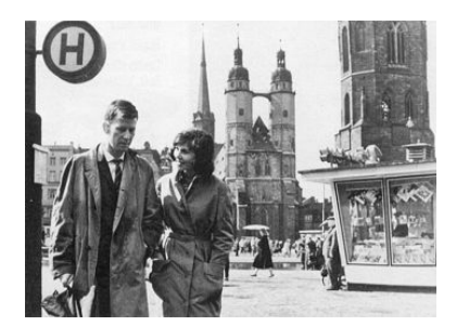
DER GETEILTE HIMMEL

In speculating about the possible reasons for the controversies the film provoked, it may be of significance that these centered not on the hot topics of Republikflucht and the national divide (after all, quite a few films were made in the GDR about the wall before DER GETEILTE HIMMEL), but concerned the film's formal characteristics and its difficult, avant-garde mode of narration. Indeed, it makes