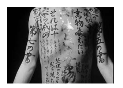
THE PILLOW BOOK

He wants to turn the separating wall, the protective skin and delicate membrane that is the gallery outwards, in order for the city itself to be experienced as an intimate space. What he wants to reach via the gallery is the city, sites and places that are public, because already traversed by different kinds of audiences, forming instant, transient and transparent communities – shoppers, strollers: "a man taking a dog for a walk, a dog biting a man, a man biting a dog." Greenaway has denounced the pseudo-community of today's cinema attendance, averring that even television scores higher as a form of sociability. It almost seems that he has decided that there is no point in making (European) cinema, unless one understands what it is that creates not just audiences – "audiences ... the watchers watched" – but sociable or public audiences, even under the conditions of the "society of the spectacle."