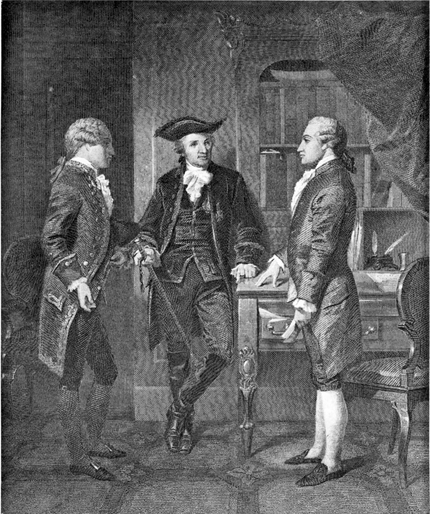
BARON DE KALB INTRODUCING LAFAYETTE TO SILAS DEANE