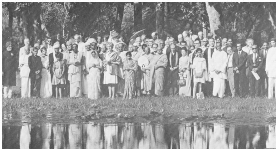
Fig. 2: Common prayer of the participants at the First Spiritual Summit Conference 45

On the morning before the last day of the conference, all those attending gathered together and crossed the Ganges River by steamboat to the Calcutta Botanical Gardens. At this occasion, they offered a communal interfaith prayer on the salvation of humankind.