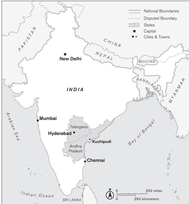
MAP 1. Map of India (2018). Image by Ben Pease.

performing a dance drama in the village of Kuchipudi. He was thought to be so enthralled by the performance that he gave away the village as an agraharam (brahmin quarters) to the brahmin families who dedicated their lives to this art (Jonnalagadda 1996b, 39). Despite the lack of historical record of Tana Shah's gift (Arudra 1994), this story is still told in the village of Kuchipudi to this day, and it is a point of legitimation for its brahmin inhabitants, who repeatedly invoke the image of their powerful Muslim patron.