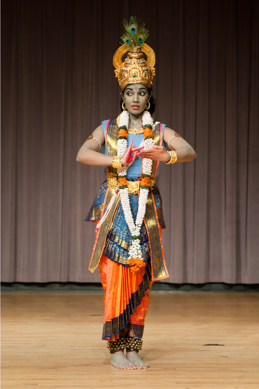
FIGURE 20. Author impersonates Krishna.