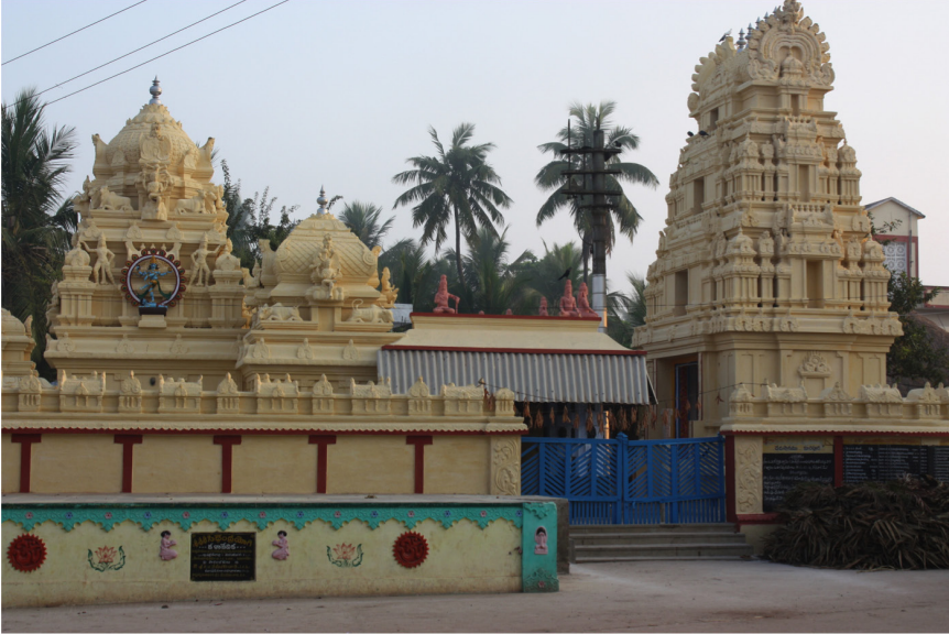
FIGURE 3. Ramalingeshvara and Balatripurasundari temple in the center of the Kuchipudi village.

Kuchipudi's founding saint. Through detailed documentation of historical records and analysis of Kuchipudi's repertoire, Anuradha Jonnalagadda's extensive research (1993, 1996a, 1996b, 2006, 2016) traces the evolution of Kuchipudi from a regional performance form to a classical dance tradition, particularly through the efforts of well-known guru Vempati Chinna Satyam. Davesh Soneji's (2004, 2008, 2012) archival and ethnographic fieldwork with devadāsīs (courtesans) in Tamil- and Telugu-speaking South India point to the complicated relationship between Kuchipudi Smarta brahmins and devadāsī communities and performance. 47 His careful attention to the marginalized histories of devadāsīs provides an important corrective to practitioner histories of Kuchipudi dance, which overlook the significant role that courtesan women played in the construction of Kuchipudi as "classical" dance. Rumya Putcha's (2011, 2013, 2015) work analyzes the classicization of Kuchipudi dance in the mid-twentieth century, particularly in relation to the burgeoning South Indian film industry and key figures, such as Vedantam Lakshminarayana Sastry. 48 Indebted to and engaging the work of these four influential scholars, here I trace the transformation of Kuchipudi from a village in Telugu South India to a "classical" Indian dance tradition.