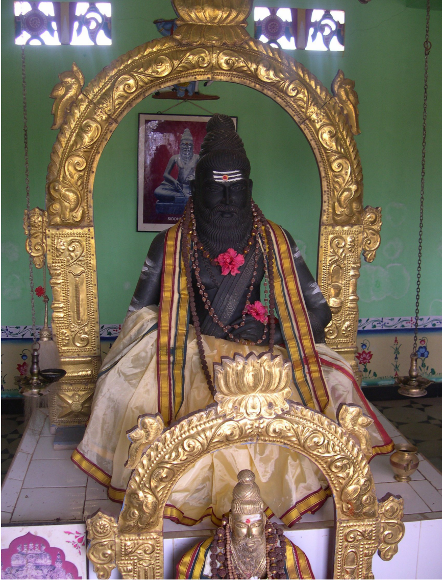
FIGURE 4. Siddhendra's mūrti (image) in a temple in the Kuchipudi village.

considered traitors of Tamil by their adherence to Sanskritic culture. Sumathi Ramaswamy (1997) writes: