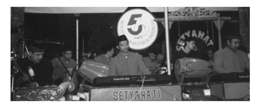
Campursari orchestra at a kampung Independence Day event