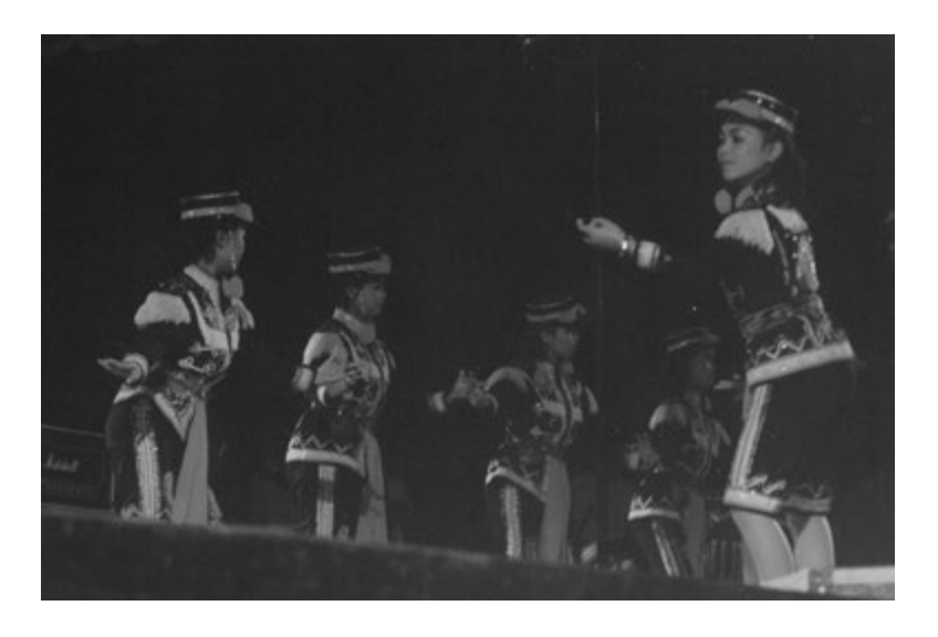
Angguk dance at the Northern Square

The audience for this event was especially diverse, and the acts included Islamic qasidah and the nineteenth-century Javanese angguk dance, through to current popular music and comedy. Housing such varieties of musical act was a unifying force for one of the broad groups of inner-city oriented people I have sought to identify in this monograph. The music on this occasion was on the one hand benignly nationalistic, a matter of some importance given the climate of political, economic, ethnic and religious tension; on the other, collectively the performances were exceptionally varied. As at the State Institute of Islamic Studies, performers and audience alike were keen to share their cultural performances with anyone interested, and evidently did not feel threatened by outside influences. Moreover, the setting of the Kraton promoted a sense of place and of humility in the face of the powers of nature. But the event was of course not magically removed from power struggles: not only did the various acts present versions of urban renewal, traditionalist Java, Islam and the like to a diverse audience, the involvement of the Perhimpunan Indonesia Baru (New Indonesia Association) was made prominent through signage.