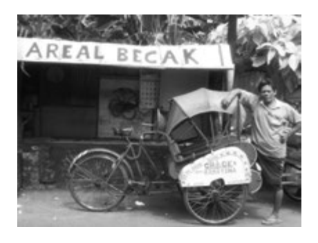
Becak driver at Sosro Bahu, 2009