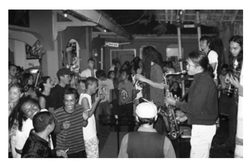
Reggae band in Sosrowijayan, 2005

Based on the material presented in Part One, I suggest that musical group formation and performance in Sosrowijayan provided street workers with an important social and expressive outlet. Musical activities did not eliminate conflict and unify all social groups, but they did give people alternatives to joining and promoting local and party political militia groups (Kristiansen 2003).