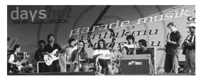
The author performs with KPJM and friends at the Air Force Academy

Non-jalanan associates of the street musicians, such as a newly formed funk band, also performed over the course of the festival. And Air Force members also gave a number of performances. A group of paratroopers enacted a coordinated gymnastic dance to