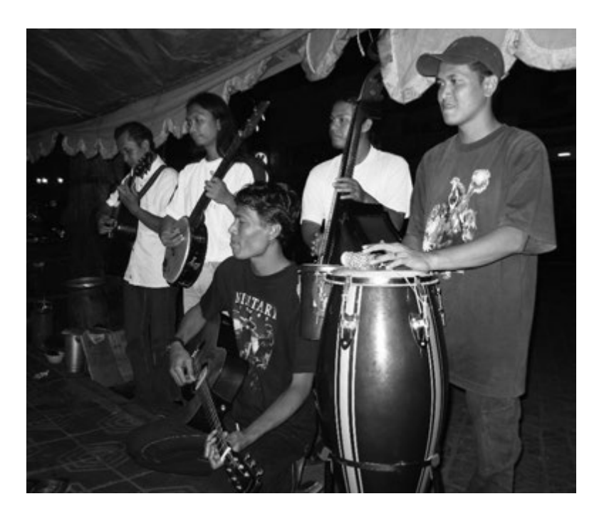
Astro Band playing at Malioboro lesehan, 2001

The second, and more influential, pengamen group featuring regularly in Sosrowijayan's public spaces was the Astro Band. Astro Band's extraordinarily large repertoire ranged from campursari, new and old Indonesian pop and regional favourites, to the Beatles and Latin American songs, some of which they experimented with by blending regional, national, and global musical elements. One song request folder they carried contained the Indonesia categories of 'pop hits', 'nostalgia', kroncong, daerah (regional) and kebangsaan (national). Their second folder contained categories such as 'Bowie - England', 'Eagles - Amerika Serikat' and 'Italy'. The Astro Band comprised a core of six men in their early 20s, some of who had come from Surabaya to live in Yogyakarta over the past few years. Their core instruments were double bass, folk guitars, banjo, and two conga drums with a thin chain strapped to them that could be gently tapped and sharply swivelled. Most members sang harmonies and at different times took the lead vocal position. Numerous others also joined in, including fellow street workers such as portrait artists but also holidaymakers and domestic and international students.