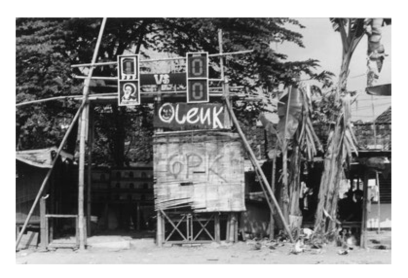
A 'base camp' some 20 metres to the east of the Opposite Resto tongkrongan , where members of the sometimes-militant Gerakan Pemuda Ka'bah (GPK, Ka'bah Youth Movement) gathered

and distant from residents, and therefore not subject to kampung regulations, Opposite Resto had few noise restrictions in terms of both music making and the motorcycles, trucks, and buses that encroached into participants' physical and aural space. Again in contrast to TransWeb, alcohol consumption was popular, participant numbers could reach 30 or more, and music making here sometimes extended into acoustic jam sessions with whole groups singing out choruses.