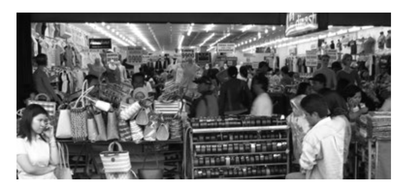
The Malioboro walkway flanked by street stalls and a brightly-lit department store