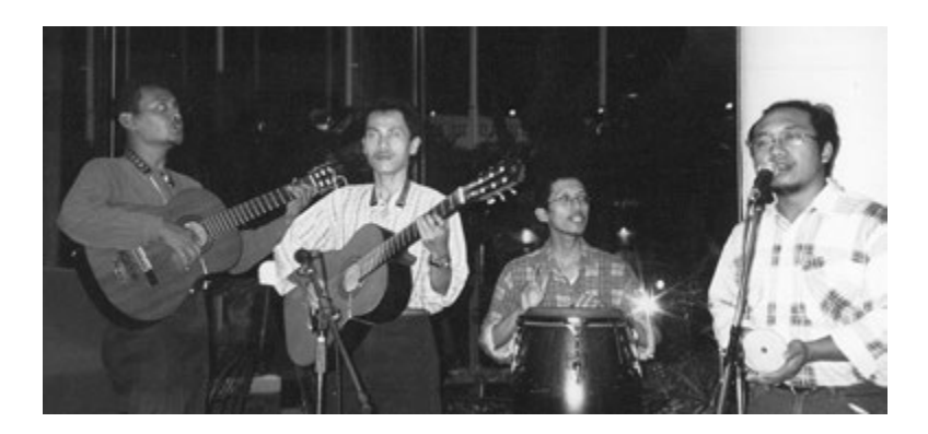
Calypso Band at Santika Hotel

Many people I spoke with in Yogyakarta sought involvement in the high-class hotel scene. However, despite the increasing demand for jazz among the middle classes, musicians often found themselves exploited and under-appreciated in these environments. One case of this was my guitar teacher, who played with his Latin band 'Calypso' at Santika Hotel. On their first night, less than a dozen people attended the hotel's large restaurant. Most did not acknowledge the group and their creatively crafted arrangements, the only exception being three Japanese women who posed for photographs with the performers' guitars while they were on a break. In the cut-throat hotel environment, intensified by the economic crisis and downturns in the tourism industry, the hotel management cancelled the group's contract soon after the show.