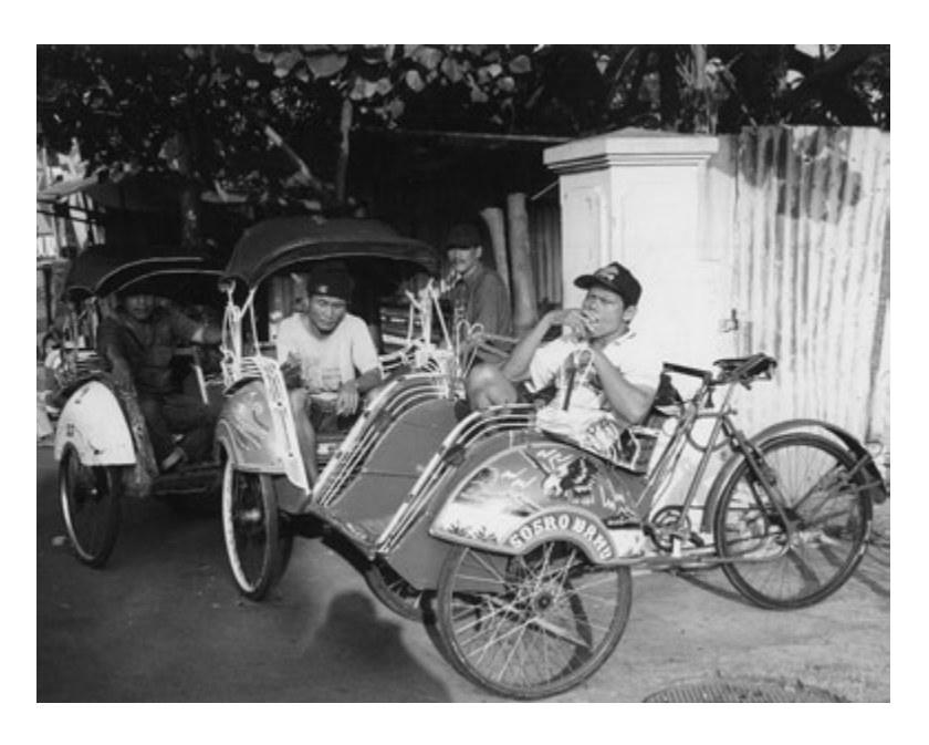
Becak drivers at Sosro Bahu, 2001