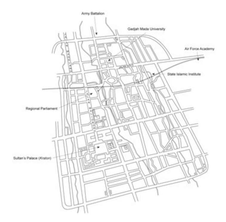
State institutions discussed in Part Three