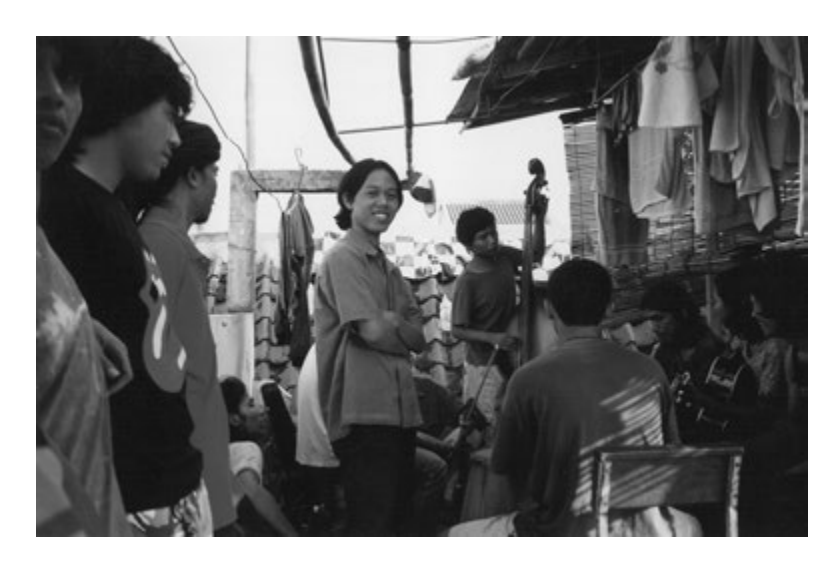
Shower Band rehearsal

a song. However, none of them had the accompanying chords, and similarly the players did not draw on cassettes for reference. Instead, they would settle on matters of musical structure by going through a song, partly from memory and partly with practice.