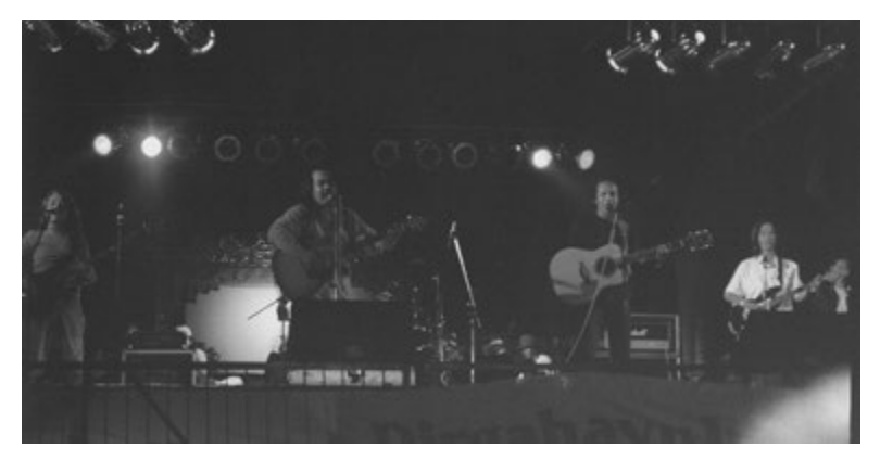
KPJM (Kelompok Penyanyi Jalanan Malioboro)