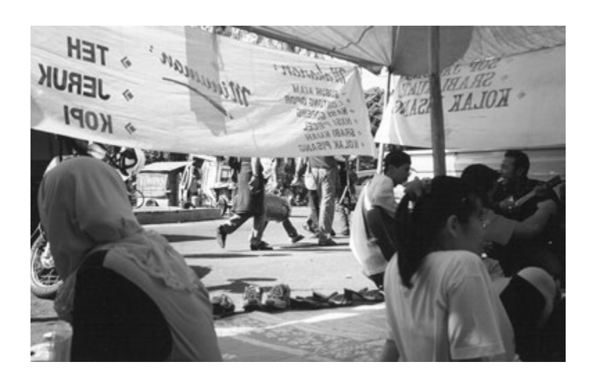
Sunday morning on the Boulevard

All of the above musicians can to an extent be categorised according to musical style as well as motivation and socio-economic position, age, and gender. The sedentary middle-class musicians performed mostly for entertainment, and perhaps also to put their cultural capital on display while at the same time identifying with 'the people'. The mobile pengamen , by contrast, were performing mainly out of a need for money. Middle- to lower-class young men generally played dangdut , Latin, and occasionally campursari . Middle-aged women and older men played langgam and campursari ; the very poor, of both genders and all ages, played langgam songs and, at times, contemporary popular songs in the langgam style.