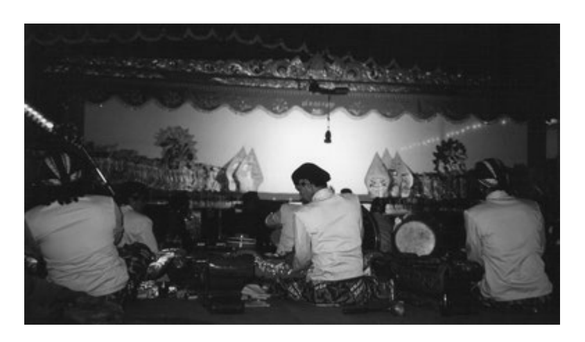
Wayang kulit at the Regional Parliament for Indonesian Independence Day, 2001

The wayang performance brought Javanism and Indonesian nationalism onto the same ground. If grounded cosmopolitanism at the Awakening Day performances could be reduced to imitations of the West, and the Awards Night saw campursari deployed at least in part to convert the capital of physical force into statist capital, the Independence Day wayang kulit performance was neither 'westernised' nor especially party political. At the same time, it was not simply an expression of an unchanging Yogyakarta tradition and Javanese views of the cosmos. The performance of and philosophy behind the wayang was witnessed by perhaps the widest array of occupational types of the several dozen large-scale performances that I attended during my research. The wayang kulit carried particularly Javanese rather than Indonesian messages, especially in the language of delivery; yet the wayang kulit was also tied to the nation through the official theme of national independence and by being held at the Regional Parliament.