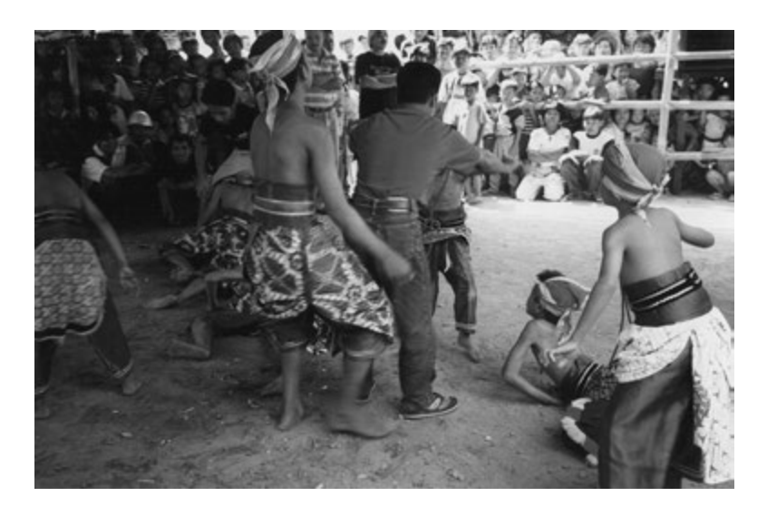
Jatilan dancers in an urban kampung

Kampung jatilan performances allowed onlookers to view familiar neighbours entering into an unfamiliar, other world of trance. Audiences remained physically immobile and separate from (though in thrilling proximity to) the performers, except for the occasional audience member who, entranced, entered the arena. In turn, performer actions on centre stage can be related to gender roles and relations. The shaman (dukun), always a male, along with the deep gong players wielded the transformative power needed to transport the dancers to the other world. The shaman's movements were poised and deliberate, while those of the trance dancers were its unpredictable and unwieldy opposite. These roles in turn can be related to factors of gender, physicality, and power. The 'feminised' appearance and movements of the dancers can be seen to draw on ideas about the subordinate 'irrational' female, something Norma Sullivan (1994:170) points out in her discussion of communal rituals. By contrast, the poised and deliberate moves of the shaman may be seen as masculine and potent (Errington 1990:41-2).