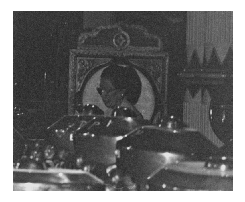
Gamelan performance in the Sultan's Palace during sekaten week

To my knowledge, relatively few jalanan street musicians, and even fewer Sosrowijayan-based street guides, attended sekaten .