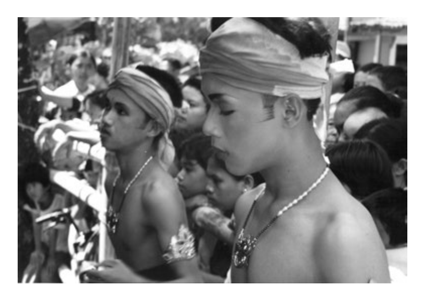
Jatilan dancers in an urban kampung

The first jatilan I witnessed took place late at night in a village north of Yogyakarta, where two rows of four men in matching red costumes and make-up and holding a hobbyhorse lined up, and then began stepping delicately in formation as the music built up in tempo and volume. Within minutes some of the dancers' eyes began to roll, and soon after that mayhem broke out with whip cracking, flame swallowing, and much frenzied running and hopping about, all to great shrieks and laughter among the 200-strong audience. I also watched a number of jatilan events in urban kampung. These took place in the middle of the day, generally around Independence Day, with audiences comprised largely of mothers with young children and young men with dyed hair and other signs of western punk and grunge affiliation. Also in contrast to the village jatilan , where the build-up to the trance was more gradual, in the urban cases all of the dancers simultaneously fell into a violent heap and, upon rising to their feet, began trance dancing together.