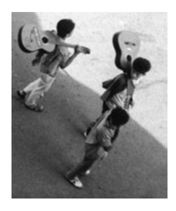
Folk/rock-influenced jalanan ; roaming buskers ( pengamen ) (1988)

A number of musik jalanan groups on Malioboro Street drew on yet other musical elements and cultural influences. Members of the Malioboro Arts Community were not openly disparaging of the kroncong - and langgam -playing buskers, but they rarely played these musics themselves. Although they sometimes played heavy metal or rock classics, the music that enjoyed greatest prominence in this circle constituted a distinct category. Like campursari players, many jalanan performers combined 'Javanese', 'western' and other elements and associations, but they did so in markedly different ways. Guitars were more prominent, for example, yet some of the scales,