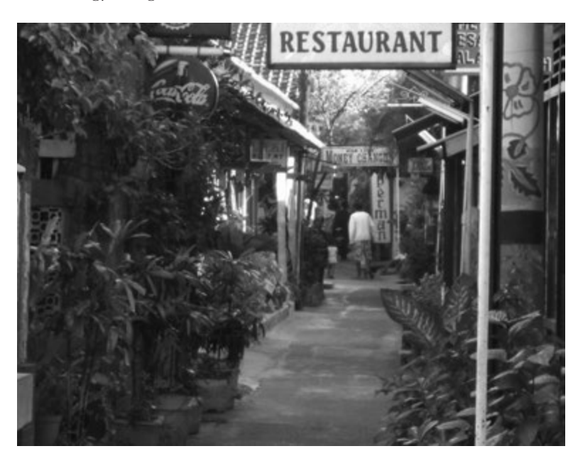
Life is quieter in the kampung