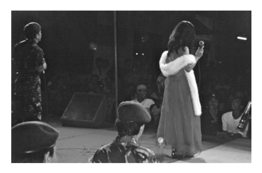
Tombo Sutris perform at an army battalion

Numerous guest appearances added variety to the evening. Three army officers sang dangdut and campursari-ised 1970s Indonesian pop songs. A comedy duo caused shrieks and hoots to ring across the audience. And the orchestra and singers inserted experimental sections into a number of their songs. The guest singers, comedians and MCs all enlivened the crowd, but the female singers produced the most animated response, especially among the younger men. The singers carefully gauged the sensuality of their actions and personas. Nevertheless, many older boys yelled out in the warbling tones of pubescent males, and a number of men in their mid-twenties rose to the stage. One shuffled slowly across the stage, smirking continuously in a self-contained 'other worlds' trance, deriving pleasure simply from being near the singers. Later in the evening, two other men rose from the audience and engaged in a kind of comedy caper, dancing slowly and sensually in front of the female singers but running out of reach when an army officer went to throw them off, only to move back to the middle of the stage each time the officer settled back.