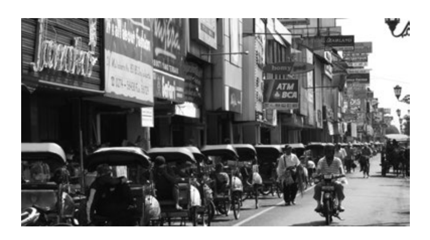
Becak line the slip lane on Maliboro Street