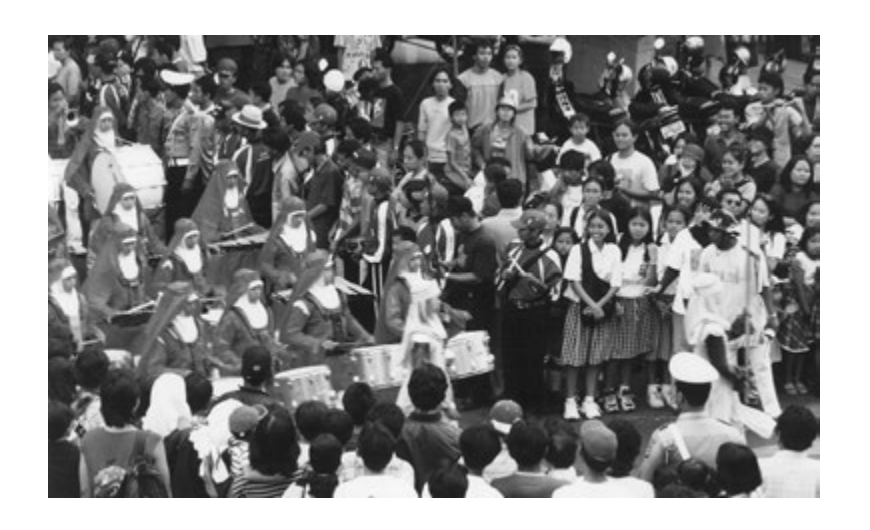
Hamengkubuwono Asia-Pacific marching band contestants exit the Regional Parliament and turn back onto Malioboro Street