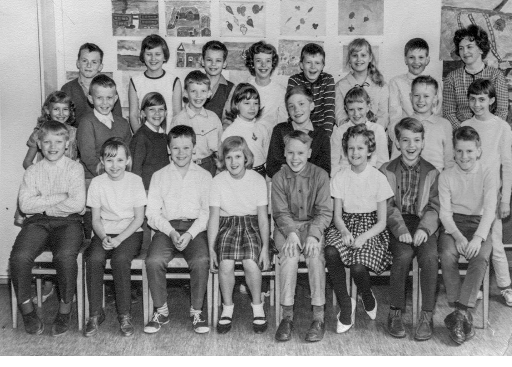
Image 7. Stockholm schoolchildren born in 1953.