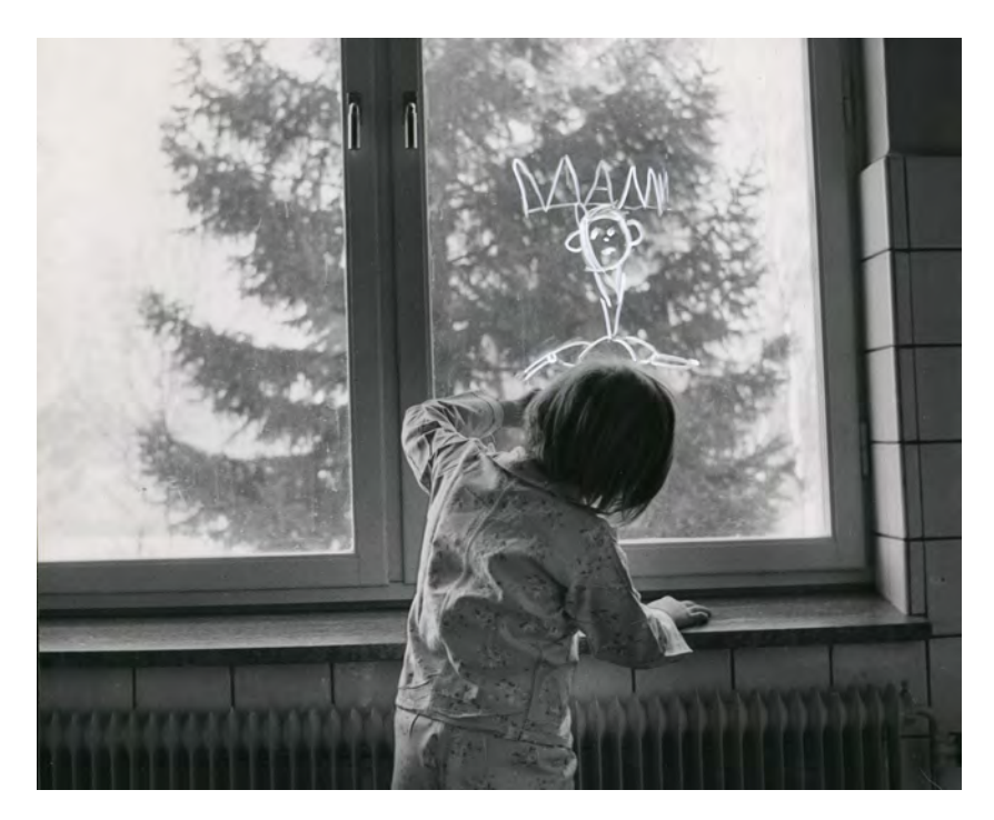
Image 16. A girl draws a picture of her mother, children's home in Örby/Stockholm.

The Project Metropolitan data provide unique opportunities to study the effects of foster care. As of this writing, there is no other data set that provides an opportunity to follow the lives of foster children for such a long period. To date, the data have been used in four studies focused on how foster care placements affected the children's situation as adults.