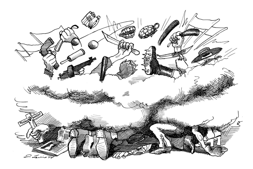
Figure 8 'Argentina' (Cartoon: David Levine)

the caudillo returns to lead his people out of the wilderness and 'resanctify the land' (Naipaul, 1980: 104). Yet in providing a focus for their disputes, Naipaul presciently observes, Peronism will not resolve the people's antagonisms but become ground zero for their detonation. The New Jerusalem it promises is leading the country straight to hell.