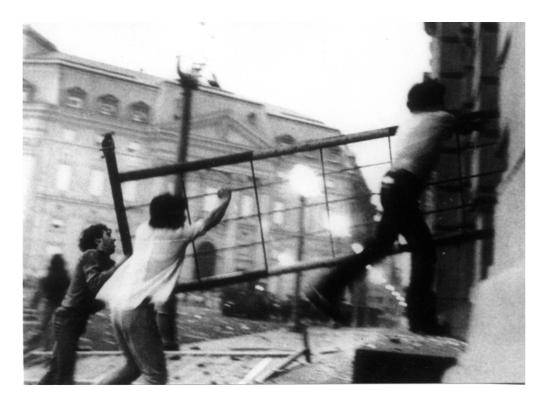
Figure 3 Argentine civilians rioting in the Plaza de Mayo

of what seemed to be an anachronistic gesture and the public's willingness to support it; anxieties about the legitimacy of Britain's continuing status as a world power, the fear that, as the Prime Minister of the day Margaret Thatcher put it, 'Britain was no longer the nation that had built an Empire and ruled a quarter of the world' (quoted in Barnett, 1982: 150). While the British press, with the exception of the Guardian and the Financial Times, remained conspicuously silent about such concerns, parliamentarians from both sides of the House gave vent to their anger over what had happened, and so betrayed their trepidation over what was yet to come. As the Tory grandee, Sir Julian Amery, indignantly observed in the first Emergency Parliamentary Debate called in response to Argentina's seizure of the islands: 'The third naval power in the world, and the second in NATO, has suffered a humiliating defeat' (Barnett, 1982: 38). Patrick Cormack, also from the government benches, noted that humiliation not only engendered the determination to redeem the situation and restore the nation's credibility but also excited the fear that this might not be possible. Indeed, Edward du Cann wondered if the nation