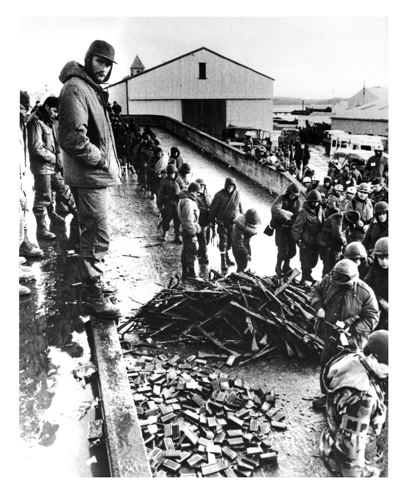
Figure 2 Argentine soldiers surrender their weapons in Port Stanley

'WE'LL SMASH 'EM' and 'STICK IT UP YOUR JUNTA' (Sun, 1982: 3.5.82; 5.4.82; 27.5.82; 3.4.82; 7.4.82). The media's full-speed advance on the South Atlantic, all headlines blazing, left little scope, and few column inches, for the expression of some of the genuine anxieties raised by the nation's precipitate commitment to recover the islands – anxieties about the military's preparedness, expertise and equipment; anxieties about the political pitfalls