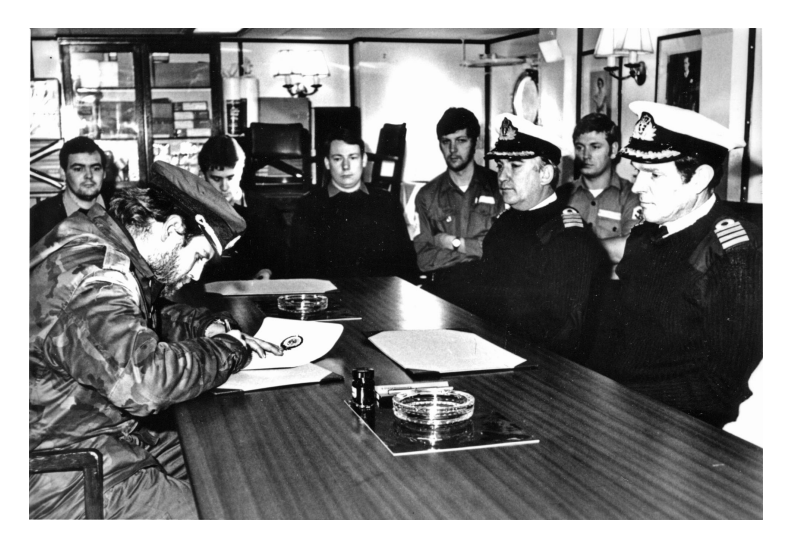
Figure 1 Captain Alfredo Astíz surrenders the Argentine garrison on South Georgia

put up by Argentine land forces, many of them conscripts; and nothing about the many underlying causes of their ultimate defeat – poor training, poor leadership, poor lines of supply. What we see instead is a familiar procession of stereotypical Latinos – cowardly torturers, deflated braggadocios and mobs of unruly civilians behaving with a predictable disregard for decorum. Indeed, what we see in these pictures is less an historical record of Argentina's doomed endeavour to recover the islands than the projection of an ongoing and deeply rooted set of British prejudices about Latin America, its peoples, their histories and cultures. Little wonder that these images say so little about the Argentine experience of the war as it is British perceptions of and responses to it that they principally record.