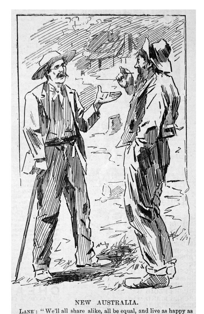
turtle doves." Shearer (whose knowledge of Human Nature is very limited):