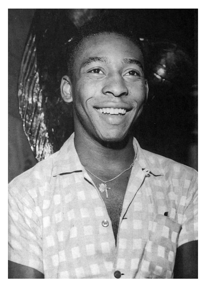
Figure 7 Pelé in 1966: the 'good son, the loyal friend, the patient idol'

Despite his wealth and fame, Pelé remained affable, open and endearingly modest, a magnet for the nation's affection and an embodiment of its highest virtues – in the words of Aldemar