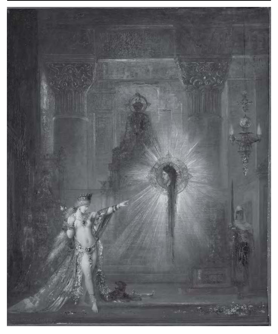
I.2 Gustave Moreau, The Apparition (1876–77).

painting.<sup>35</sup> Comparing Ancient Greek illustrations of Orpheus and the maenads to Mantegna's and Dürer's treatment of the same theme, Warburg observed the return of specific forms of movement, or what Georges Didi-Huberman calls 'a characteristic use of gesture' in his book on Warburg, The Surviving Image .<sup>36</sup> Influenced by Nietzsche's philosophical construction of the concept