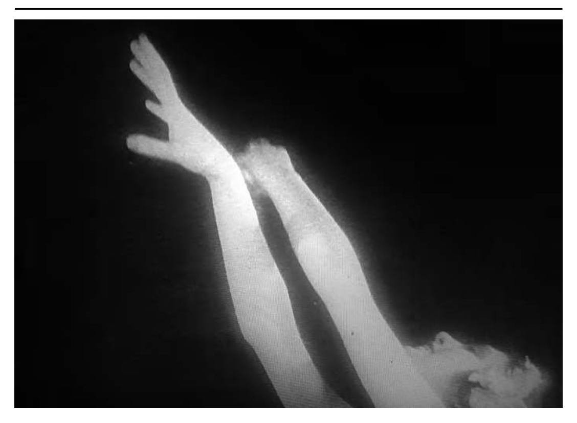
3.5 Still from Thèmes et Variations (dir. Germaine Dulac, 1929)