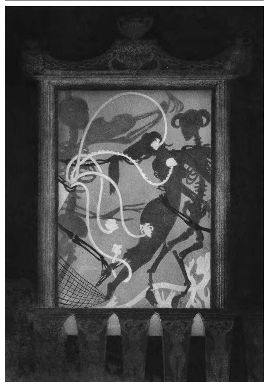
2.1 The Harlot's House: A Poem by Oscar Wilde; with Five Illustrations by Althea Gyles. London: Mathurin Press, 1904.