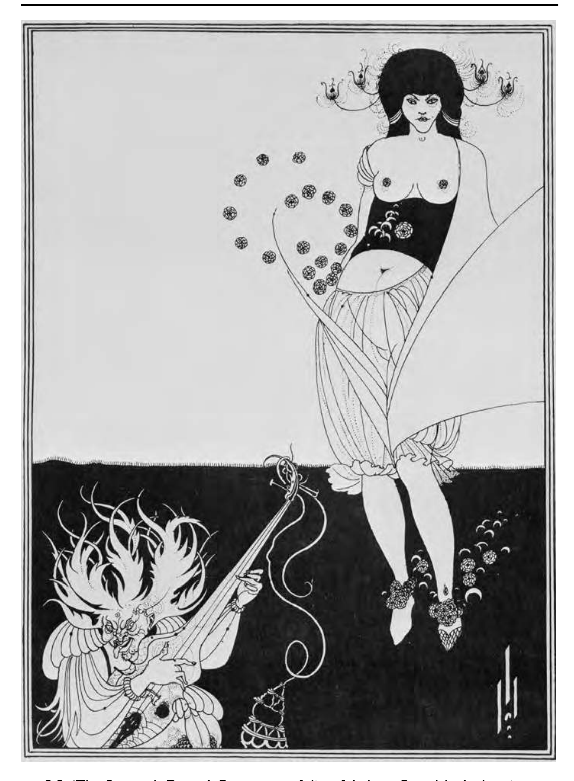
2.2 'The Stomach Dance'. From a portfolio of Aubrey Beardsley's drawings illustrating Salomé by Oscar Wilde.