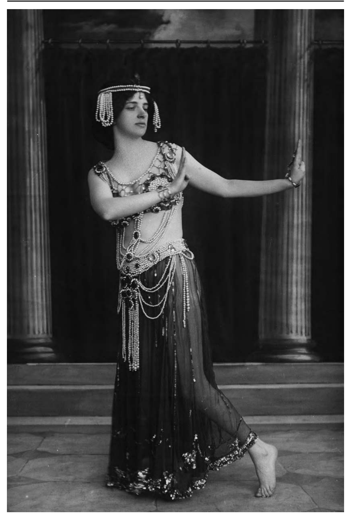
1.4 Maud Allan as Salome (1908). National Portrait Gallery, London