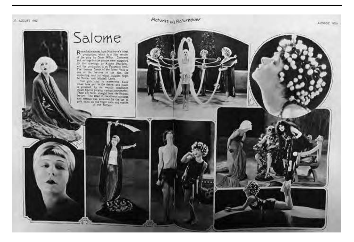
3.2 'Salome'. The Picturegoer 4 (August 1922). National Library of Scotland. Reproduced under Creative Commons License CC-BY 4.0

Captain has been discernibly reduced. The heightened proximity between the men implies that the camera's movement has unveiled a conflicted desire that strains towards both intimacy and estrangement, despite the static poses of the performers. The queer dynamic between Narraboth and the Page, frequently cited as the clearest vessel for the play's homoeroticism, is thus made legible through a carefully orchestrated sequence of poses that translate Wilde's veiled language – 'he was [...] nearer to me than a brother' ( PI , 715) – into a heightened corporeal syntax, generating meaning through the interplay between static tableau and cinematographic movement.