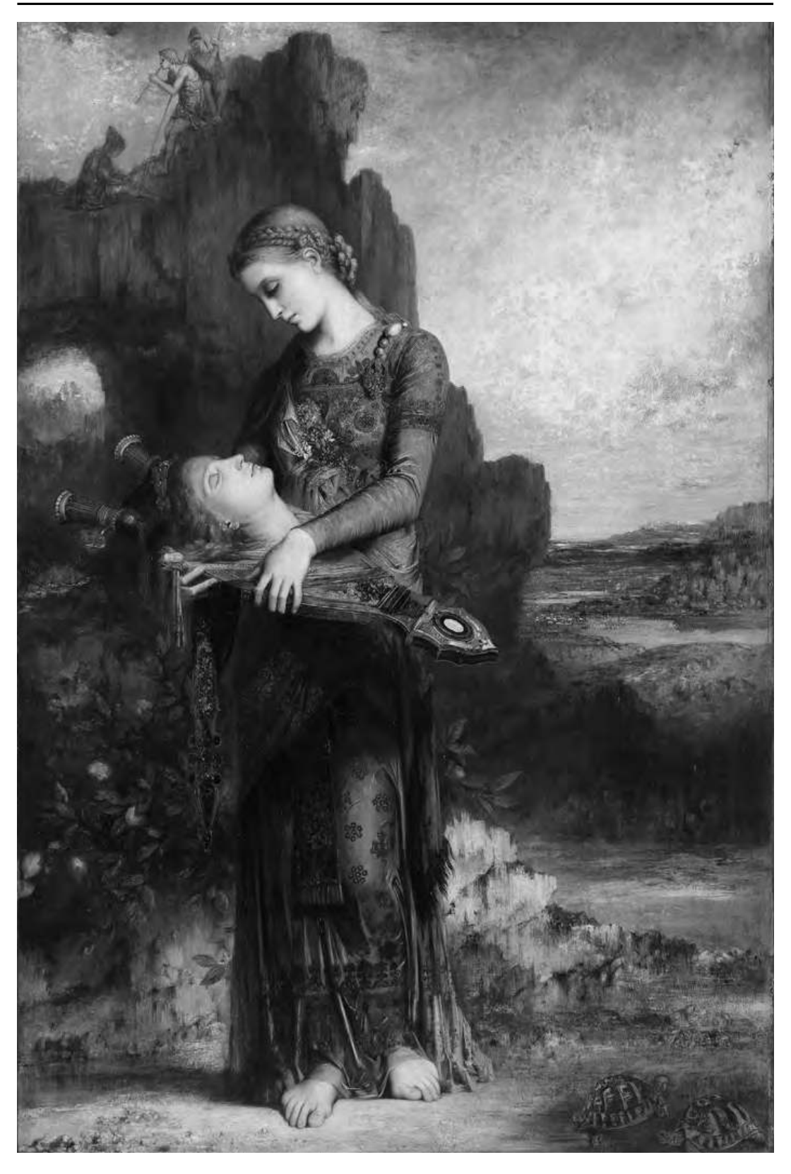
I.I Gustave Moreau, Orphée (1865).