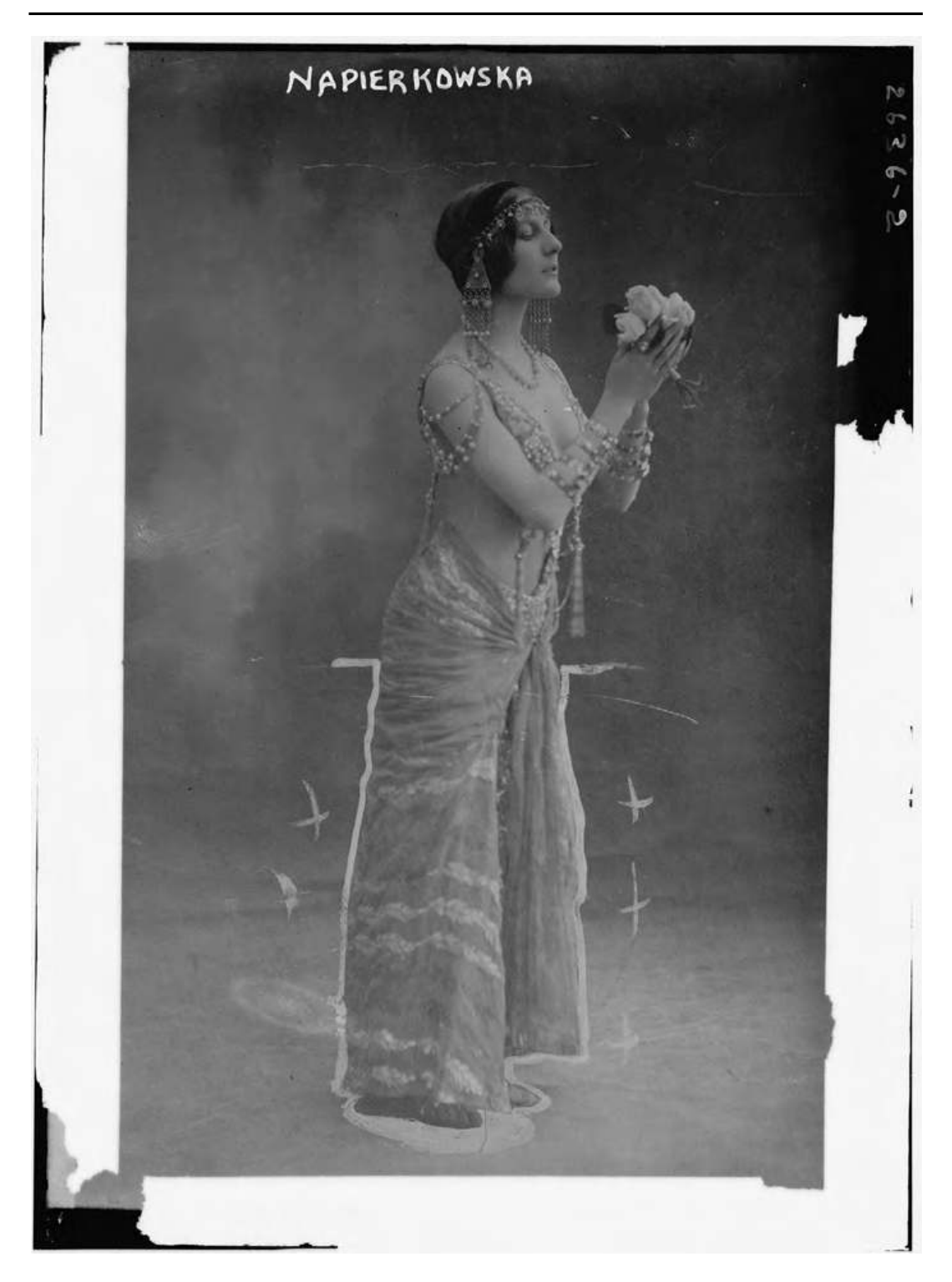
3.4 Stasia Napierkowska (c. 1910).