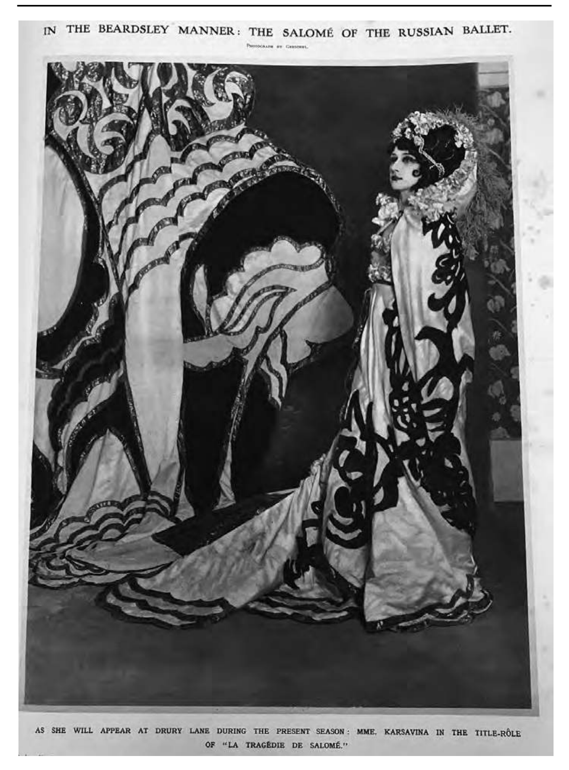
3.1 'In the Beardsley Manner: The Salomé of the Russian Ballet'. The Illustrated London News , 28 June 1913.