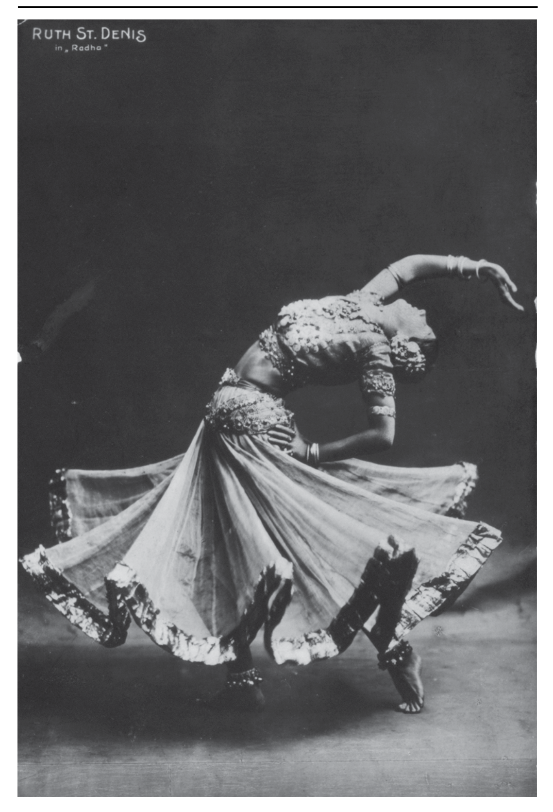
1.3 Ruth St Denis in Radha (1906). Library of Congress