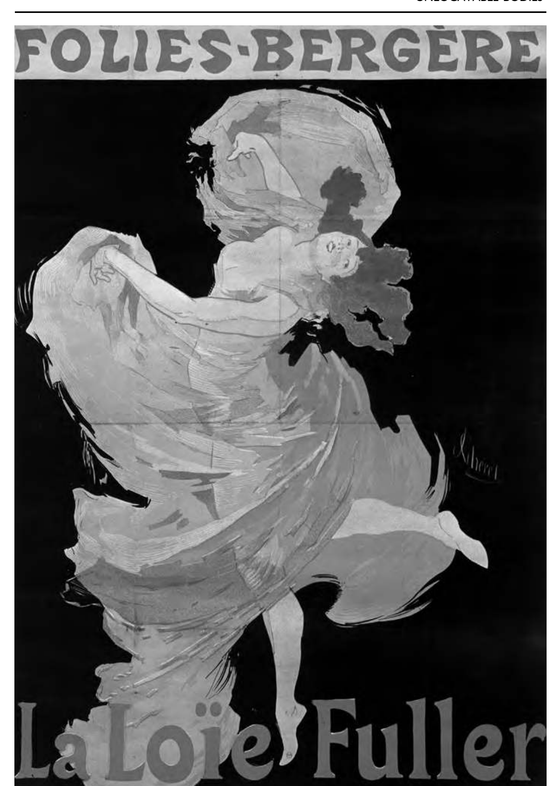
1.1 Jules Chéret, Folies Bergère, La Loïe Fuller (1893). Bibliothèque nationale de France