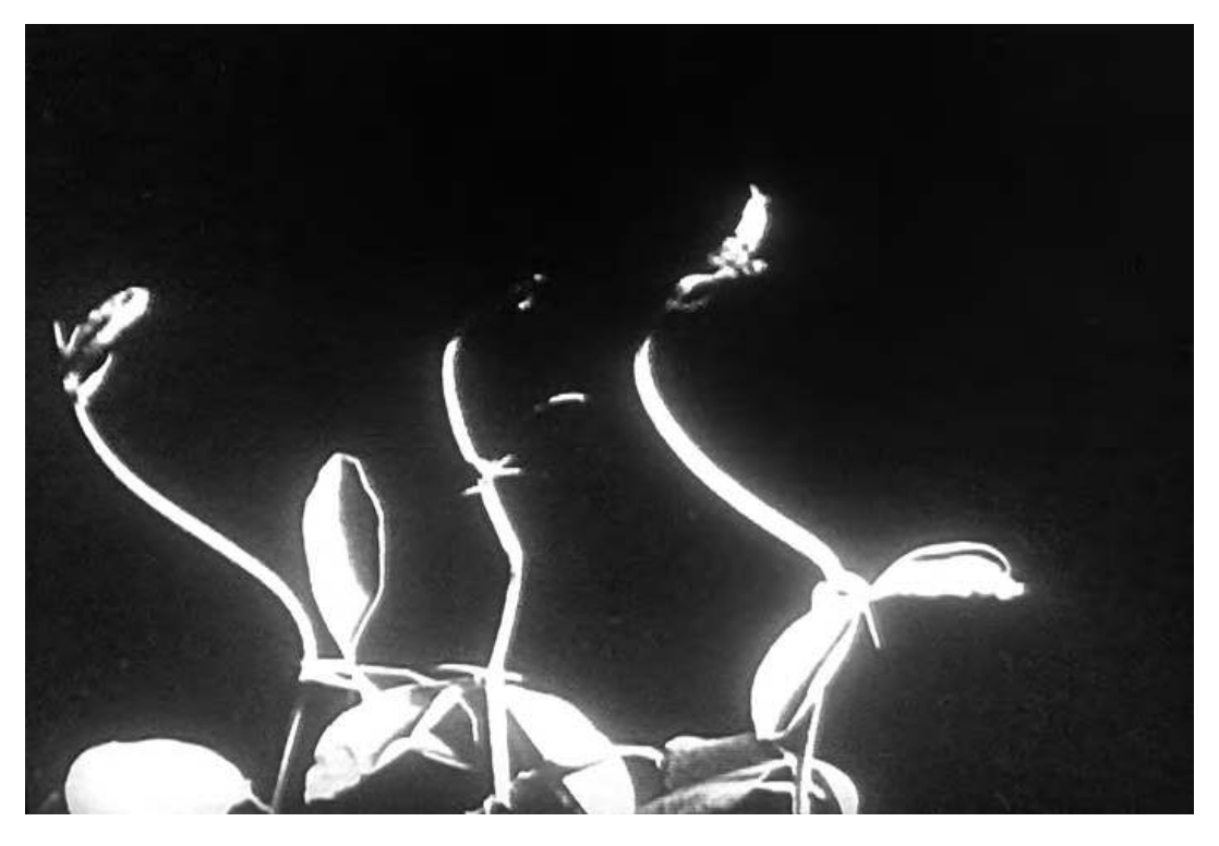
3.6 Still from Thèmes et Variations (dir. Germaine Dulac, 1929)