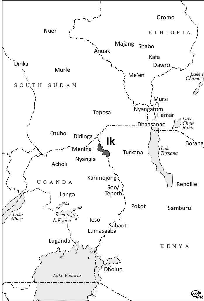
Figure 1: Ik language area in an 'Ik-centric' perspective