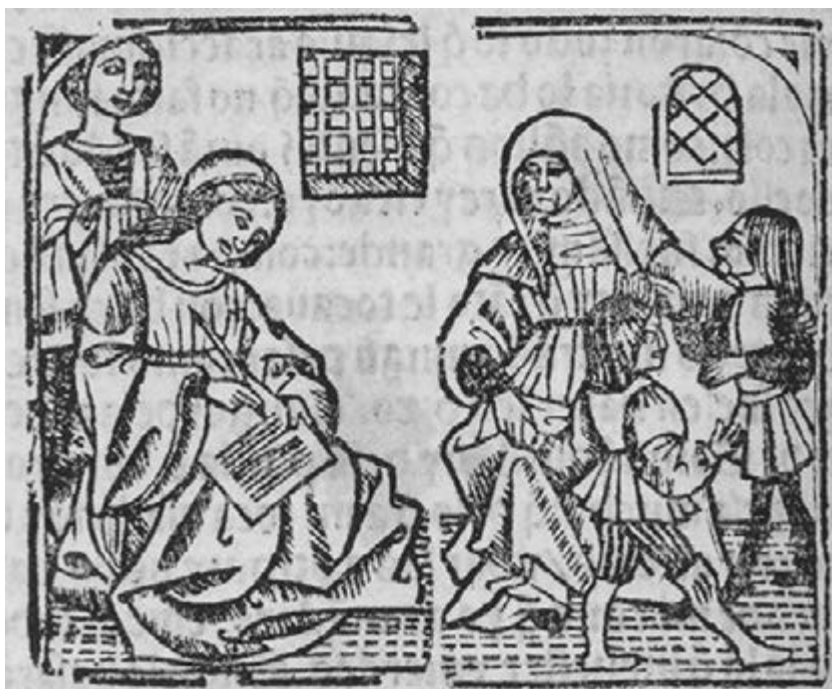
Figure 4 Oriana writes to her mother. From the 1526 Sevilla edition of Amadís de Gaula by Jácome Cromberger.

description, as it occurs during the revised conclusion to Amadís . As a lover, Oriana has her faults, but as a queen and bride to Amadís, she is exemplary.