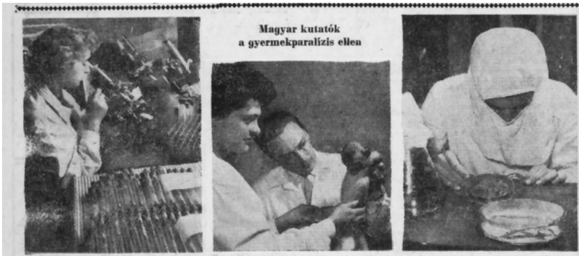
Figure 4.1 Hungarian researchers against poliomyelitis . Népakarat, 18 September 1957, 2, no. 218, 1. Credit: Arcanum Digitecha. This image is protected by copyright and cannot be used without further permissions clearance.

Népszava in April, the majority did not show up at the immunisation points. Therefore, they were called upon by the newspaper to attend their vaccination before the epidemic months of the summer began. 18