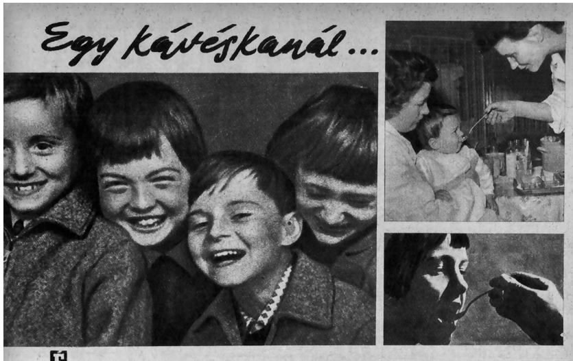
Figure 5.3 'One teaspoon . . .'. Feature article in A Hét , 18 June 1961, no. 25. 8. Credit: Arcanum Digitecha. This image is protected by copyright and cannot be used without further permissions clearance.

when the professor was visiting the State Hygienic Institute in 1960. According to Bakács' memoir,