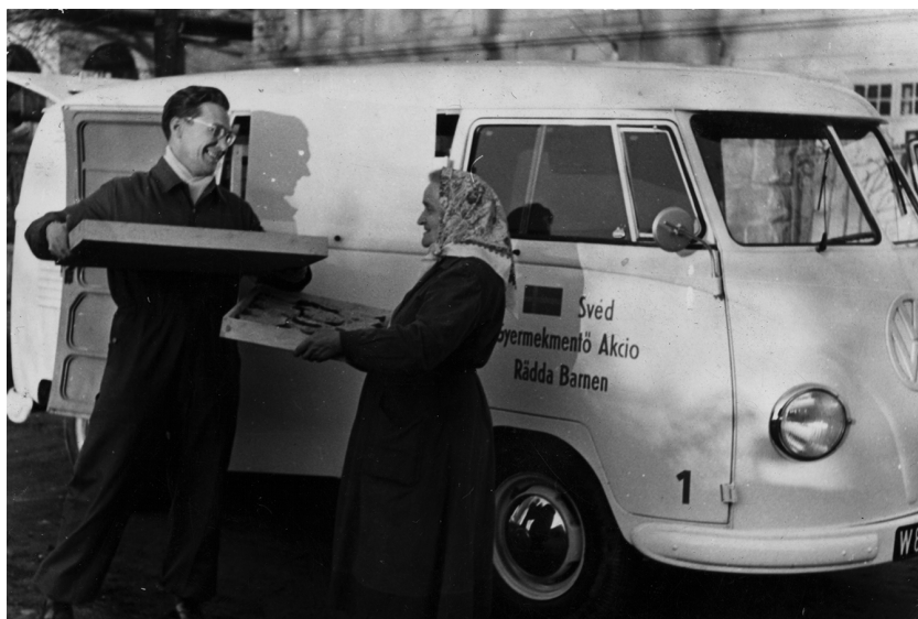
Figure 2.2 Aid arriving from the Swedish Rädda Barnen. Hongrie 1956–57. Budapest. This image is protected by copyright and cannot be used without further permissions clearance.