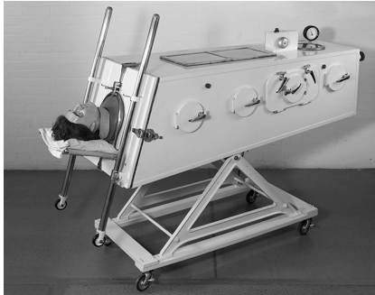
Figure 2.1 Both-type iron lung, London, England, 1950–55. By Science Museum, London. Credit: Science Museum, London. CC BY. This image is protected by copyright and cannot be used without further permissions clearance.

seesaw, used gravity to help breathing. Internal organs pushed and pulled the diaphragm as the body swayed up and down in a lying position.