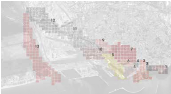
Figure 1 - The 13 hinge areas for the analysis of interactions in the port of Livorno.

First of all, the presence of elements resulting from the analysis of physical interaction: territorial planning, in particular in the PIT and PS of the municipalities in which the ports of the AdSP MTS are inserted, it is highlighted the presence of elements that constitute a statute of the port-city, both of an historical-patrimonial nature and of an emergency and critical nature with regard to the protection of the landscape and the environment. Moreover, the presence of factors resulting from the functional relationship between the city and the port: the urban functions present in the port area and the port functions present in the city fabric form intersections between the two systems, creating a sort of extension of the urban perimeter within the port, and the port perimeter within the city. Such links between city, port and territory create cross-cutting harmony: these presuppose an assessment of compatibility. In fact, the localization of urban functions in the port environment, and vice versa, requires adaptation to the laws and rules of the territory in which it is located, where the criteria for the localization of functions, organization, security and management can be very different. Functional compatibility between port and city is an element underlying the measure of interaction, and thus the balance between the two systems.