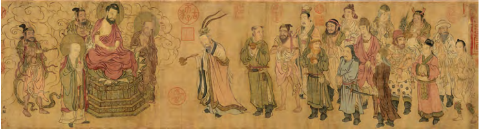
FIGURE 4.7 Image of Barbarian Kings Worshipping the Buddha , detail

imperial status; in the Painting of Buddhist Images , it is Duan Zhixing, and not the Chinese ruler at the end of the painting, who wears these insignia. 73 Another analogous genre is that of foreign dignitaries paying tribute to the Chinese emperor, but this genre emphasizes the exotic animals and goods being offered to the Chinese emperor, elements that do not appear in the Painting of Buddhist Images . 74