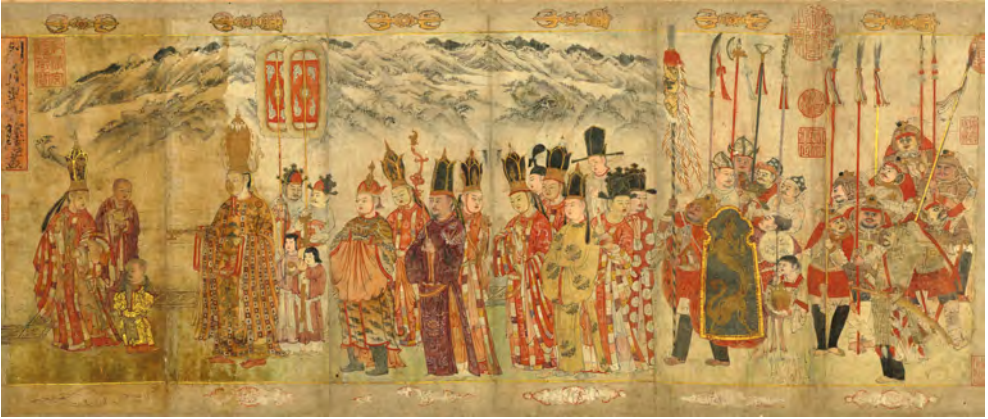
FIGURE 4.2 Duan Zhixing and retinue, Painting of Buddhist Images COLLECTION OF THE NATIONAL PALACE MUSEUM