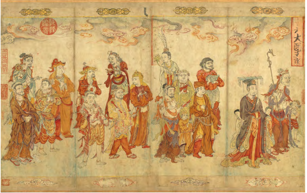
FIGURE 4.4 Kings of Sixteen Great States, Painting of Buddhist Images COLLECTION OF THE NATIONAL PALACE MUSEUM

preceded by two frames, each with a painted dhāraṇī pillar (Figure 4.5): the pillar on the left is the “Precious State-Protection Pillar” ( hugu baochuang 護國瑤幢); the one on the right is the “Precious [Prajñāpārami]tā Heart Pillar” ( duo xin baochuang 多心瑤幢), which features an error-filled Siddham text of the Heart Sūtra . 61 In addition to these direct references to the Scripture for Humane Kings , several frames depict Nanzhao kings, tutelary deities tied to the Duan family, and cakravartins surrounded by the seven precious things. 62