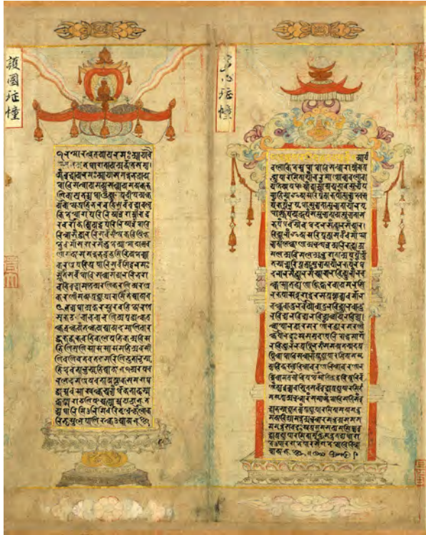
FIGURE 4.5 Dhāraṇī pillars, Painting of Buddhist Images COLLECTION OF THE NATIONAL PALACE MUSEUM

light shines up diagonally from the middle of the stūpa. The text of the dhāraṇī is black, unlike the red lettering used for Sanskrit characters in most Dali manuscripts. I am unaware of any other Sanskrit versions of this dhāraṇī , making this image (along with the abbreviated version in the Invitation Rituals ) valuable for making sense of its many Sinitic transcriptions. This version closely matches Hatta Yukio's reconstruction, but appears to differ in certain areas. 64