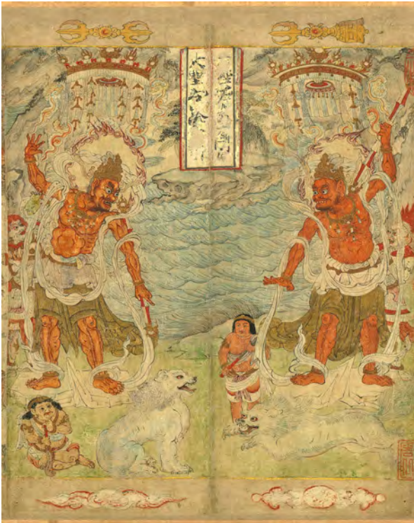
FIGURE 4.3 Vajra beings, Painting of Buddhist Images COLLECTION OF THE NATIONAL PALACE MUSEUM