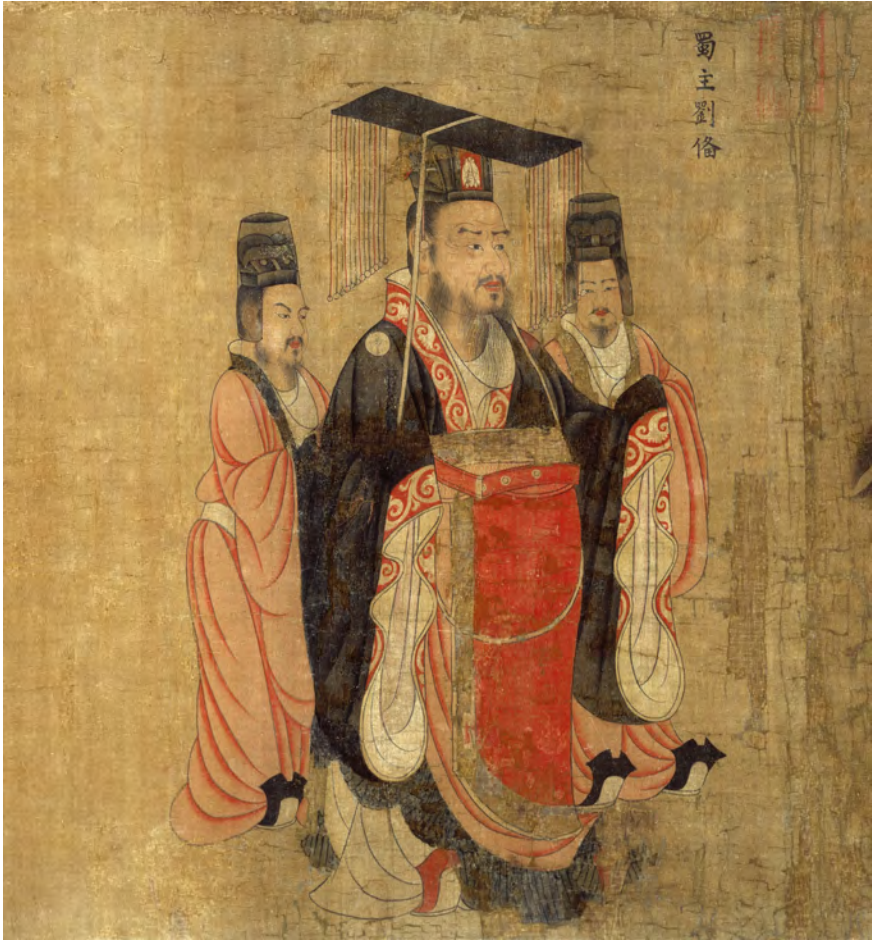
FIGURE 4.6 Thirteen Emperors , detail