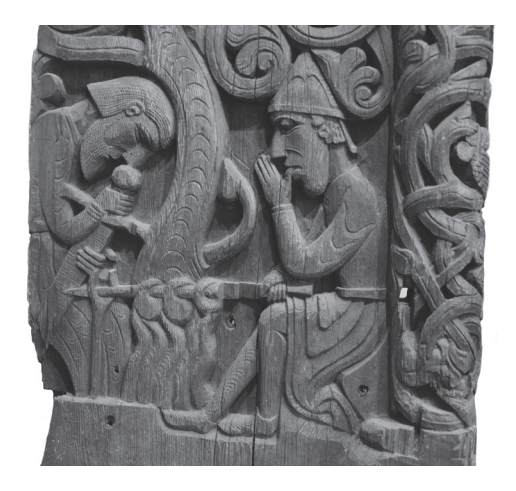
Figure 1. Sigurðr licks his thumb while roasting the heart of Fafnir in the presence of the sleeping Regin. Hylestad Portal.

The stave church of the village of Hylestad in the Norwegian district of Setesdal possessed a grand portal that survived even after the demolition of the church in 1664. That portal, dated to ca. 1200, is today on display at the Oslo Historical Museum. Although the crown of the portal is missing, the rest remains intact, and