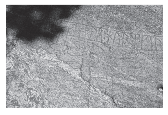
Figure 4. Ramsund slab engraving, originally in Montelius, Sveriges hednatid : dramatic image of Sigurd stabbing a text.

The runic inscription at Ramsund, in Södermanland, Sweden, dated to the early eleventh century, represents