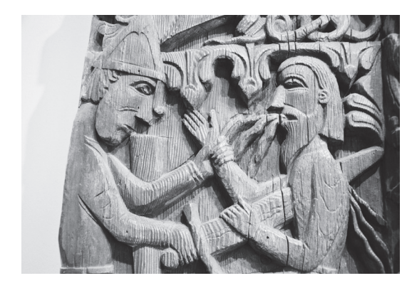
Figure 6. Sigurðr slays Regin. Hylestad Portal.

planning to murder him and beheads him himself. Brynhildr witnesses her true love forget her very existence. Guðrún watches her brothers plot and carry out the murder of her husband. Atli eats the flesh of his mur-