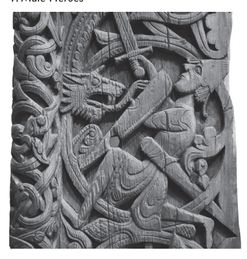
Figure 5. Sigurðr slaying Fafnir. Hylestad portal.

Of Sigurðr, the compiler of Vǫlsunga saga writes: