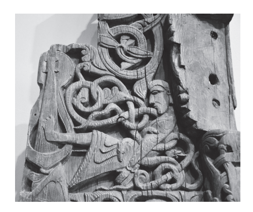
Figure 7. Gunnar plays the harp in the snake pit. Hylestad Portal.