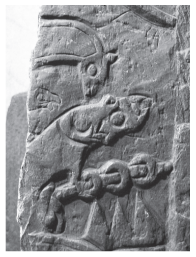
Figure 2. Andreas cross. Image by Gavin Archer and Louise Archer.

A number of tenth-century inscribed crosses on the Isle of Man have been interpreted to depict scenes associated with the Sigurðr story.<sup>23</sup> The stones prominently display Latin crosses with interlacing serpentine scroll decoration and figures reminiscent of Óðinn , Þórr, boars, deer, and valkyries. They bear Norse runic inscriptions that indicate the Norse or occasionally Celtic names of persons (mostly men) who erected the