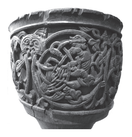
Figure 3. Näs baptismal font.

Stockholm's Historical Museum preserves the baptismal font of Näs Church, Jämtland, dated to around 1200. The font is carved from a single large tree stump, its outer surface decorated with lavish and sophisticated carvings. Inhabited vine scroll is populated with serpents, winged dragons, and beings that appear half human/half dragon. Most striking, however, is the inclusion of a bound