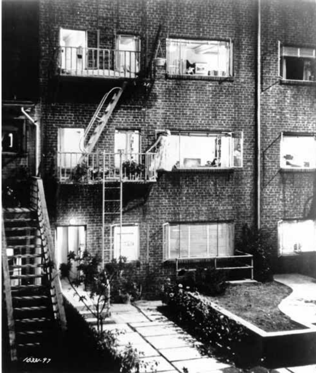
Fig. 20. Still: REAR WINDOW: Entry through a window. Lisa (Grace Kelly) enters Thorwald's apartment to look for his wife's jewellery.

There is nothing very interesting about most of the exits through a window in Hitchcock's films: someone is usually escaping. The motif of someone entering through a window is very different, because almost all the examples are sexualised. (The stress, here, is on someone entering. I exclude examples in which the camera alone enters, which may – the beginning of PSYCHO – or may not – the beginning of I CONFESS – be sexualised.) In the British films, the motif receives a number of different inflections. In THE MANXMAN , before Pete goes abroad, he tries to get Kate to say that she'll wait for him, a scene which involves him standing on Philip's shoulders in order to reach Kate's bedroom window. Although Pete does not enter the room, this is an embryonic version of the