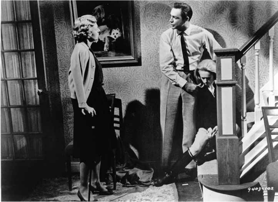
Fig. 45. Still: MARNIE : the working-class mother in her house. Mark (Sean Connery) confronts Mrs Edgar (Louise Latham) over what happened to Marnie (Tippi Hedren, on the stairs) when she was a little girl. In the background, the dog and puppy painting.

wards the 'intruding' heroine with a similar hostility to Mrs Whittaker, Mrs Danvers and Mme Sebastian (➤ EXHIBITIONISM / VOYEURISM).