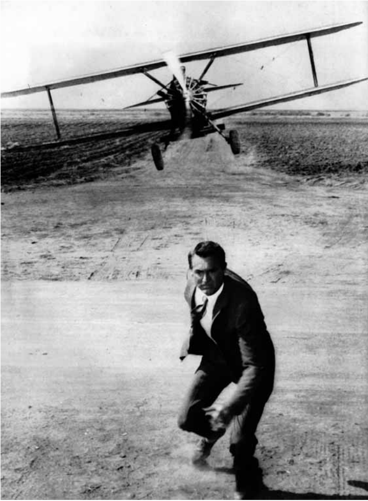
Fig. 58. Still: NORTH BY NORTHWEST: the malevolent plane. Roger (Cary Grant) pursued by the crop-dusting plane.

opposed the father on political grounds, is with the heroine on the plane. The flight would thus seem to be symbolic. Since the death of the father occurs as the heroine flies out of the country he has betrayed, it is as if a new life for her is being marked out not just romantically but also politically. But if this applies in FOREIGN CORRESPONDENT , it is ironised in NOTORIOUS . Here the hero is a much more ambiguous figure and thanks to him the heroine is taken back into her father's corrupt world.