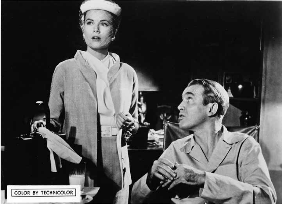
Fig. 38. Still: REAR WINDOW : the elegant handbag. Lisa (Grace Kelly) brings her overnight case to Jeff (James Stewart)'s apartment to show him that she is staying the night. Jeff's gesture indicates the subject of their conversation: the jewellery that was in Mrs Thorwald's handbag.