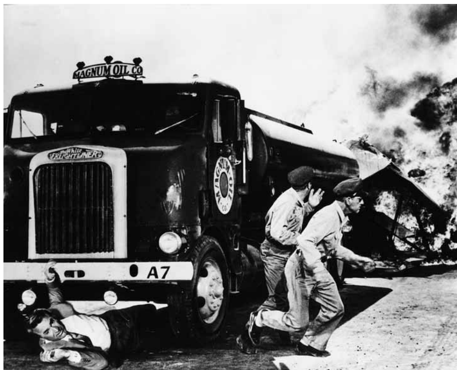
Fig. 12. Still: NORTH BY NORTHWEST : Confined space – Roger (Cary Grant) under the oil tanker.

Confined spaces is a loose term. I wanted a designation which covered two sorts of setting in Hitchcock: on the one hand, small private rooms such as bathrooms and toilets; on the other, a variety of public spaces, from jails to telephone booths, which enclose the characters in more or less claustrophobic ways. There are also more elaborate examples: the action of LIFEBOAT is entirely confined to the lifeboat itself; that of ROPE to the increasingly claustrophobic apartment of the two killers. But my concern here is with small rooms and with 'boxed-in' spaces such as booths, bunks and trunks, where the sense of confinement functions in two broadly contrasting ways: either as a retreat/hiding place from the world or as an imprisoning cage. Although there may seem to be little connec-