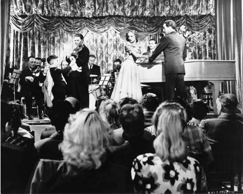
Fig. 10. Still: STAGE FRIGHT : the disruptive child. The cub scout spooks Charlotte (Marlene Dietrich) on stage by holding up a doll with a bloody dress. On the right, Freddie Williams (Hector MacGregor), Charlotte's manager.