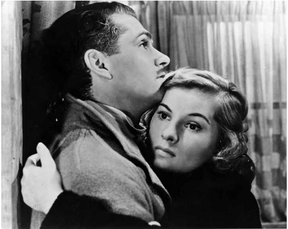
Fig. 27: Still: REBECCA: Guilt and confession. After Maxim (Laurence Olivier) has confessed to the killing of Rebecca, he and his second wife (Joan Fontaine) share a guilty embrace.