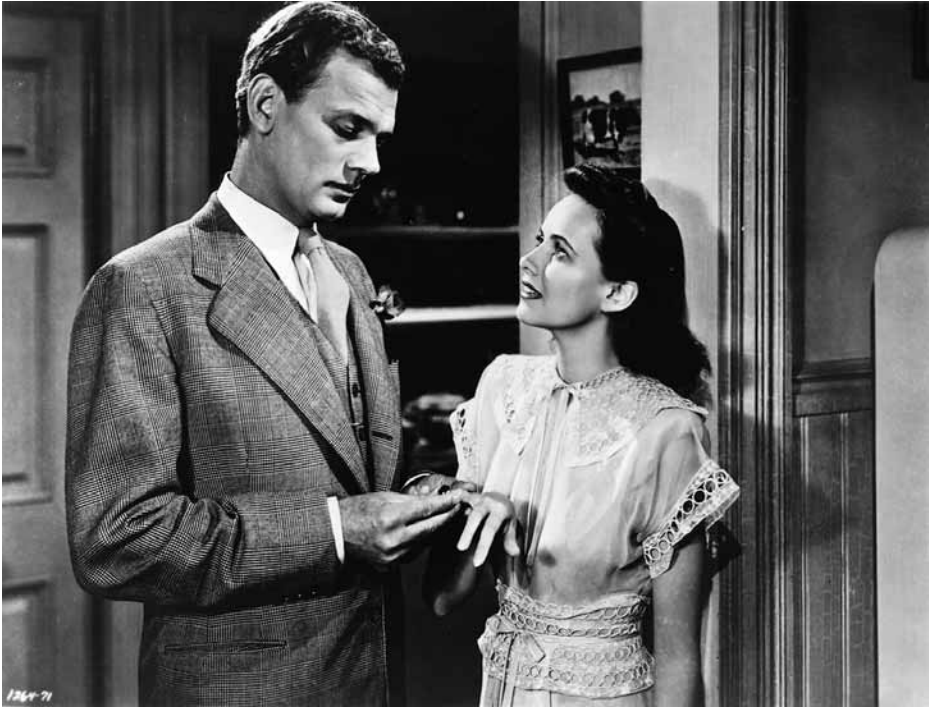
Fig. 36. Still: SHADOW OF A DOUBT : Jewellery. Uncle Charlie (Joseph Cotten) gives Charlie (Teresa Wright) the ring of one of his murder victims.

serve to identify him to Charlie as the Merry Widow murderer. In REAR WINDOW , the presence of Mrs Thorwald's jewellery in the apartment after she herself has disappeared becomes the key to establishing that her husband murdered her.