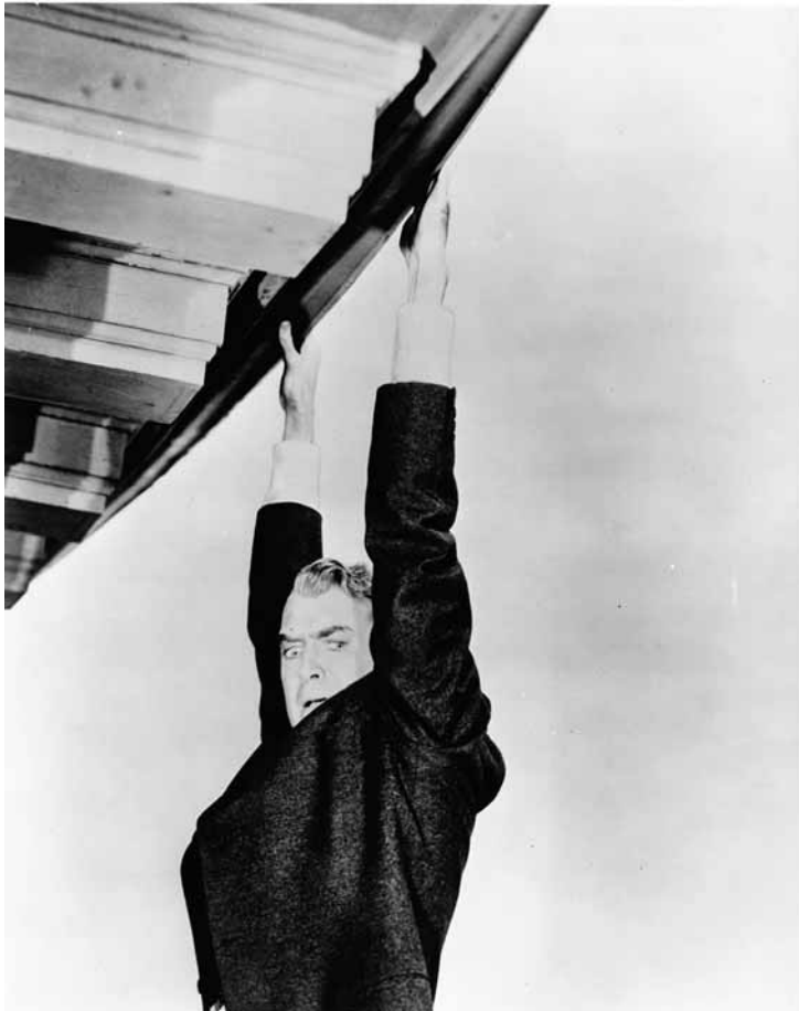
Fig. 32. Still: VERTIGO : the fear of heights. Scottie (James Stewart) suspended from the gutter in the opening scene.

The prevalence of the motif of threatened or actual falling from a height in Hitchcock's films is well known, but I am unaware of any attempt to analyse it. At a relatively basic level it refers to a fear of the abyss: another metaphor for the chaos world. Noting that we are never told how Scottie in VERTIGO is rescued from his predicament at the beginning – suspended from a roof gutter