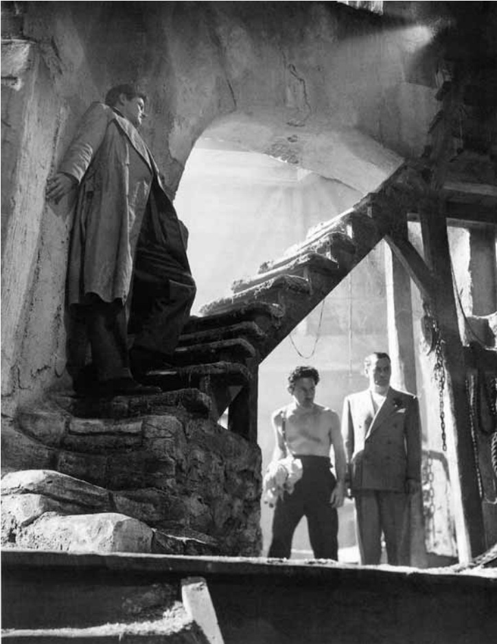
Fig. 55. Still: FOREIGN CORRESPONDENT : Staircase and the threat of being seen. The oneiric interior of the mill. Johnny (Joel McCrea) on the staircase; the assassin (Charles Wagenheim) and Krug (Eduardo Ciannelli) underneath it.

Alicia in NOTORIOUS . As noted under the BED SCENE , the Nazis in both films turn the bed itself into a site of agony. Nevertheless, the domain is still on the upper level: fascism is thus integrated into the dominant structural patterns of Hitchcock's work. However, with his two films which include scenes set in communist countries, matters are quite different.