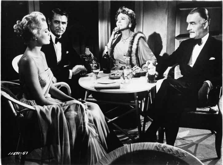
Fig. 46. Still: TO CATCH A THIEF : the (seemingly) haughty Hitchcock blonde and her scheming mother. As Francie (Grace Kelly) affects indifference to Robie (Cary Grant), Jessie Stevens (Jessie Royce Landis) eyes him appreciatively. Hughson (John Williams) on the right.

family name be preserved by having him adopted – began to suffer from nightmares in which Harriet tormented her for this past deed (➤ GUILT AND CONFESSION ). Just as Julia's action in the past echoes that of Hitchcock's early oppressive mothers, so her action in the present – seeking to make amends by finding the missing son and making him heir to the family fortune – initiates the train of events which will end with the criminal Adamson in jail. And it was his mother's restless spirit which began it all.