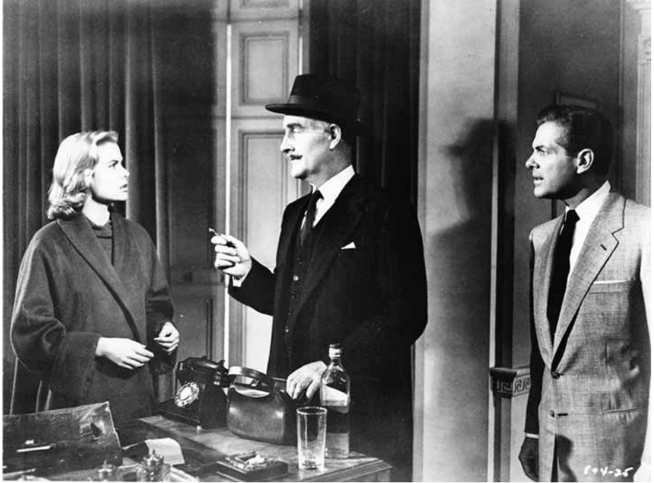
Fig. 40. Still: DIAL M FOR MURDER : Key, handbag and the police. Chief Inspector Hubbard (John Williams) asks Margot (Grace Kelly) whether the key he has taken from her handbag is hers. Mark (Robert Cummings) looks on with some concern.

Margot, Mark and Hubbard all waiting for him, he is carrying both the handbag and Margot's key. She does not receive either, but Tony makes a point of presenting Hubbard with her key, as if identifying him as the patriarchal figure who controls the keys.