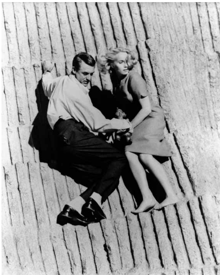
Fig. 43. Still: NORTH BY NORTHWEST: the MacGuffin. Roger (Cary Grant) and Eve (Eva Marie Saint) hold the Tarascan warrior which contains the microfilm as they clamber across the face of Mount Rushmore.

The concept of the MacGuffin in Hitchcock is more slippery than may, at first, be apparent. To Truffaut, Hitchcock defines it as the secret or documents the spies are after, distinguishing between his own point of view and that of the characters in the film: these items 'must seem to be of vital importance to the characters. To me, the narrator, they're of no importance whatever' (Truffaut