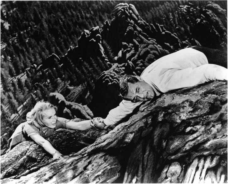
Fig. 31. Still: NORTH BY NORTHWEST : the rescuing hand and the fear of falling. Roger (Cary Grant) holds on to Eve (Eva Marie Saint) on Mount Rushmore.

exceptions, variations, complications. My basic point remains: that the hands motif in Hitchcock serves as a pretty good guide to the gender politics of his films.