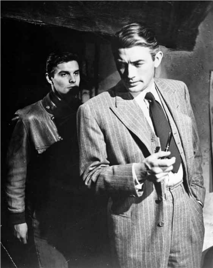
Fig. 34. Still: THE PARADINE CASE : Homosexuality. Latour (Louis Jourdan) visits Tony (Gregory Peck) in the Lake District Inn.

Latour: Beg pardon, sir. She was not my mistress. Col. Paradine was my master... I would never have served a woman. It is not in my character to do that.