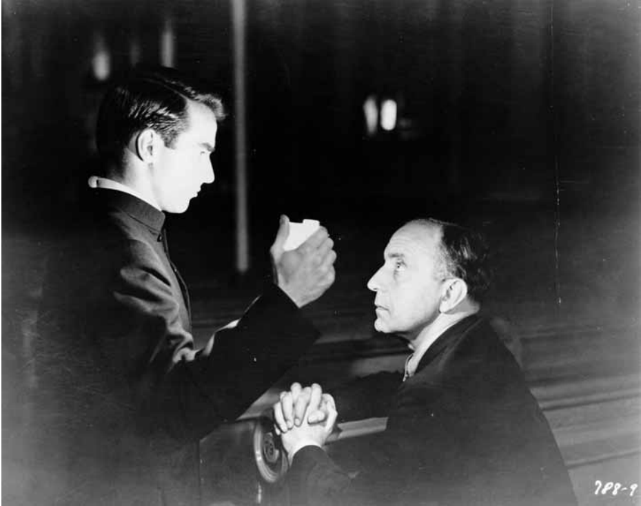
Fig. 41. Still: I CONFESS: candlelight reveals a murderer. Father Logan (Montgomery Clift) discovers Keller (O.E. Hasse) in the church. Keller will shortly confess to Vilette's murder.