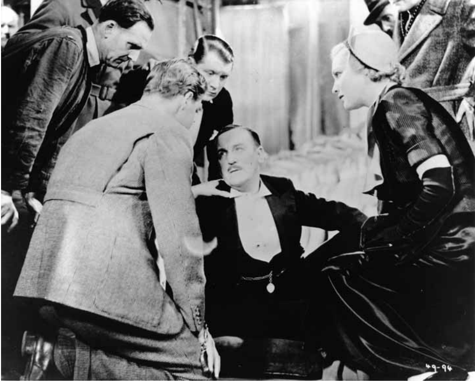
Fig. 19. Still: THE 39 STEPS : Endings and the police. As the dying Mr Memory (Wylie Watson) recites what he remembers of the MacGuffin, Hannay (Robert Donat) and Pamela (Madeleine Carroll) look on sympathetically. Behind Pamela are two policemen. In the concluding shot of the film, their colleague joins the group to register that Hannay has been telling the truth, which frees the latter for his concluding hand-clasp with Pamela.