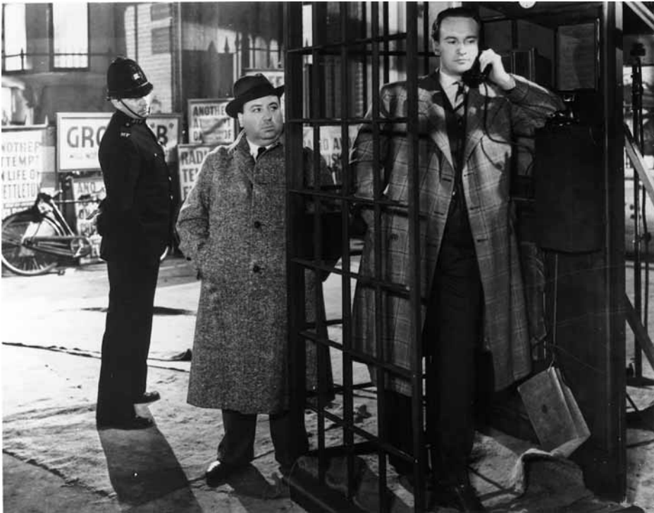
Fig. 9. Still: REBECCA : Hitchcock's cut cameo outside the phone booth under the eye of the law. Favell (George Sanders) in the booth.

From the stories Hitchcock has told over the years about his fears of the police, we would expect him to do his best to avoid them in his cameos. In general, he is successful. In MURDER! , Markham is talking about going to the police as Hitchcock walks past, but the latter, in conversation with his companion, pointedly does not notice. In FRENZY , he watches the police attending to the corpse fished out of the Thames, but it is the corpse that they are interested in, not Hitchcock. In the still of the cameo from REBECCA (Hitchcock outside a telephone booth waiting for Favell to finish his call), a policeman looks on suspiciously, but Selznick cut the scene; perhaps, in this instance, doing Hitchcock a