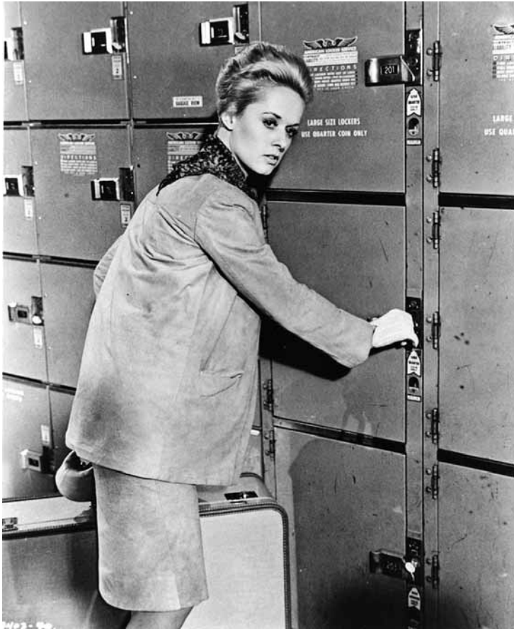
Fig. 37. Still: MARNIE : Key. Marnie (Tippi Hedren) locking away evidence of her previous identity as Marion Holland. In a few seconds, she will throw away the key.