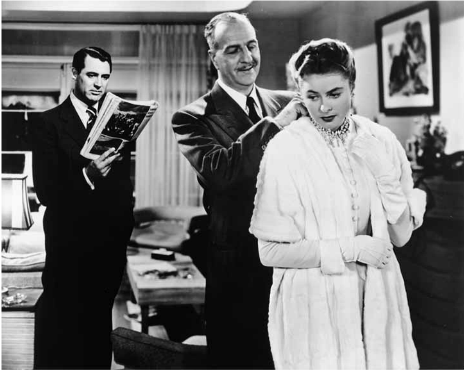
Fig. 35. Still: NOROTIOUS : Jewellery. Prescott (Louis Calhern) fastens Alicia (Ingrid Bergman)'s necklace for her; excluded, Devlin (Cary Grant) pretends to read.

In films generally, as in life, jewellery has a wide range of possible associations. These may be romantic: in two early Garbo films – THE TEMPTRESS (Fred Niblo, 1926) and FLESH AND THE DEVIL (Clarence Brown, 1926) – she and the hero signal their love by exchanging rings. But, as a gift from a man to a woman, jewellery may equally connote the man's sense of his own status and wealth, as in the familiar situation of a husband wanting his wife to wear the expensive jewellery he has bought her. Such jewellery may have little sentimental value: RANDOM HARVEST (Mervyn LeRoy, 1942) nicely contrasts the expensive emerald pendant the hero gives the heroine when he is a famous politician with the much more highly valued cheap necklace he gave her during his amnesiac