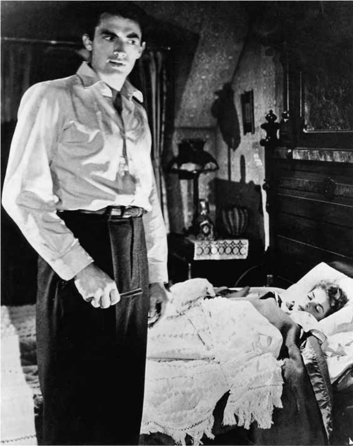
Fig. 4. Still: SPELLBOUND : Bed scene and trauma. In a trance, holding a razor, J.B. (Gregory Peck) gazes at the sleeping Constance (Ingrid Bergman).

examples where it is the setting for the return of the repressed, from Levet's hallucinations of the native woman to Marnie's nightmares.