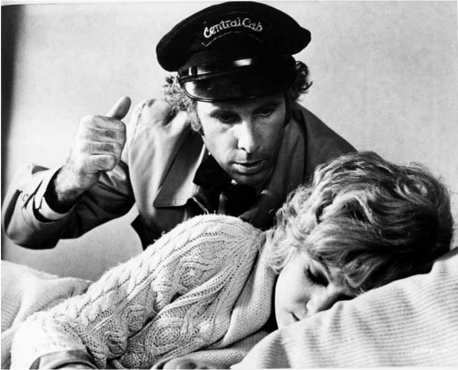
Fig. 5. Still: FAMILY PLOT : Bed scene reunion. George (Bruce Dern) finds the kidnapped Blanche (Barbara Harris) feigning unconsciousness on the bed in the villains' secret room. The reunion which sets up Hitchcock's final bed scene.

world as marked, not simply by external threats (the chaos world), but also by the personal sufferings – both physical and psychological – of his characters.