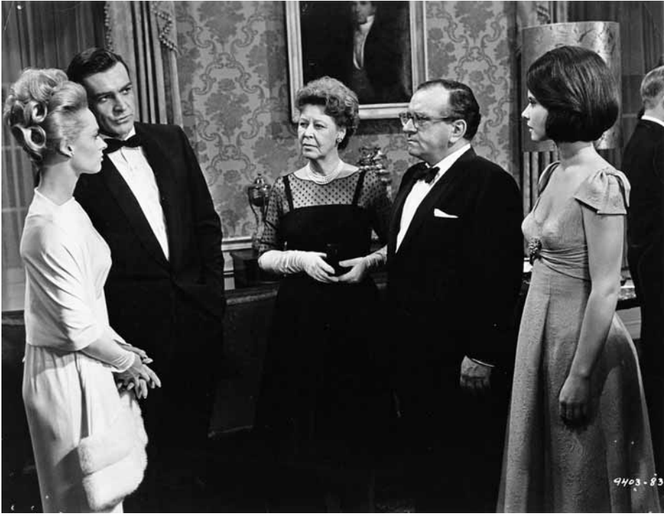
Fig. 7. Still: MARNIE : Blonde and brunette. Lil (Diane Baker) on the right sets up a charged re-meeting between Marnie (Tippi Hedren) on the left and Strutt (Martin Gabel). Mark (Sean Connery) supports Marnie; Mrs Strutt (Louise Lorimer) in the middle.

occasional exceptions – the black-haired Annie in THE BIRDS is relatively self-effacing; the seemingly brown-haired Connie in LIFEBOAT is undeniably forceful – but otherwise the coding marks a strong tendency in Hitchcock's films.