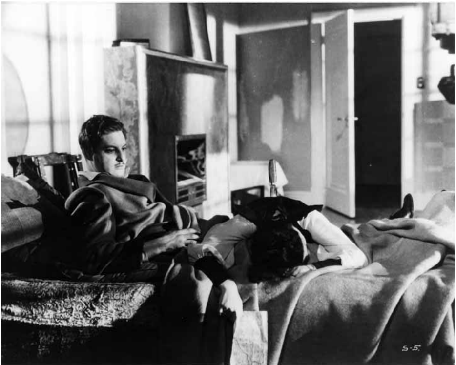
Fig. 3. Still: THE 39 STEPS : Bed scene and corpse. Hannay (Robert Donat) is woken by Annabella Smith (Lucie Mannheim) who warns him and then dies on top of him.

The first bed scene in Hitchcock is when Jill shares Patsy's bed in THE PLEASURE GARDEN . As Truffaut has suggested, with Patsy wearing pyjamas and Jill a night-dress, there are perhaps suppressed sexual undercurrents to the scene