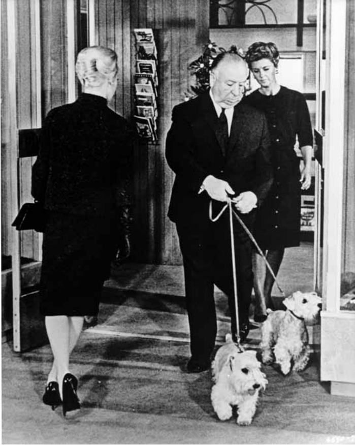
Fig. 17. Still: THE BIRDS: Dogs . Hitchcock being led by his West Highland terriers out of the pet shop. Although in the film itself the dogs and Hitchcock exit to the left of Melanie (Tippi Hedren), this still is not the wrong way round. On this take the dogs must have decided to go to the right. Tippi Hedren's skilful swerve registers the dogs' change of direction.

On the evidence of his films, Hitchcock did not think much of cats. They appear quite often in the British films, and occasionally in the Hollywood ones, but usually a bit sneakily. They turn up on dinner tables ( RICH AND STRANGE , MR AND MRS SMITH ); their propensity to flee from danger is used to signal murders ( THE LODGER , MURDER! ) or to add a sense of farce to a panicking crowd ( JUNO