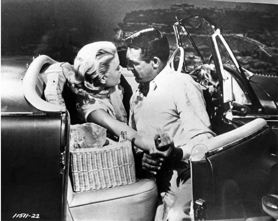
Fig. 29. Still: TO CATCH A THIEF : Held wrist. Robie (Cary Grant) takes hold of Francie (Grace Kelly) in order to kiss her.