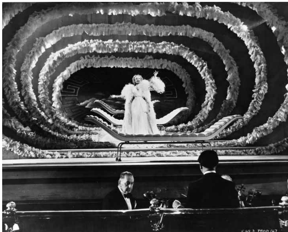
Fig. 21. Still: STAGE FRIGHT : Exhibitionism and Freudian set design. Charlotte (Marlene Dietrich) sings on stage in the West End.