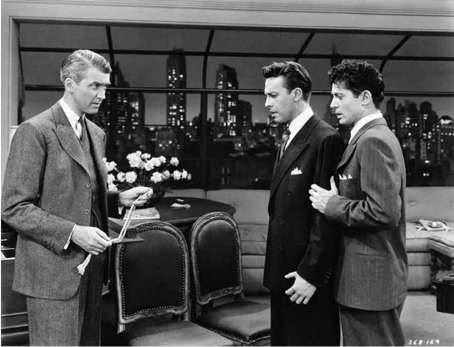
Fig. 33. Still: ROPE: Homosexuality. As Rupert (James Stewart) produces the rope, Phillip (Farley Granger) half hides behind Brandon (John Dall).