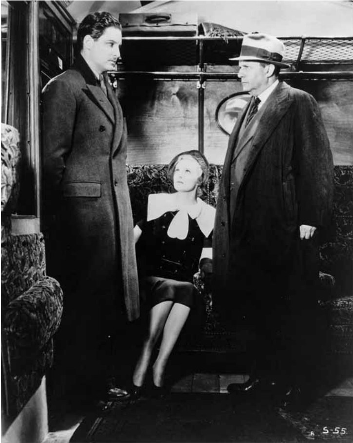
Fig. 56. Still: THE 39 STEPS : encounter on a train. Hannay (Robert Donat) meets Pamela (Madeleine Carroll) and asks her to help him; she turns him over to the police.

Donald Spoto has recorded that, as a boy, Hitchcock