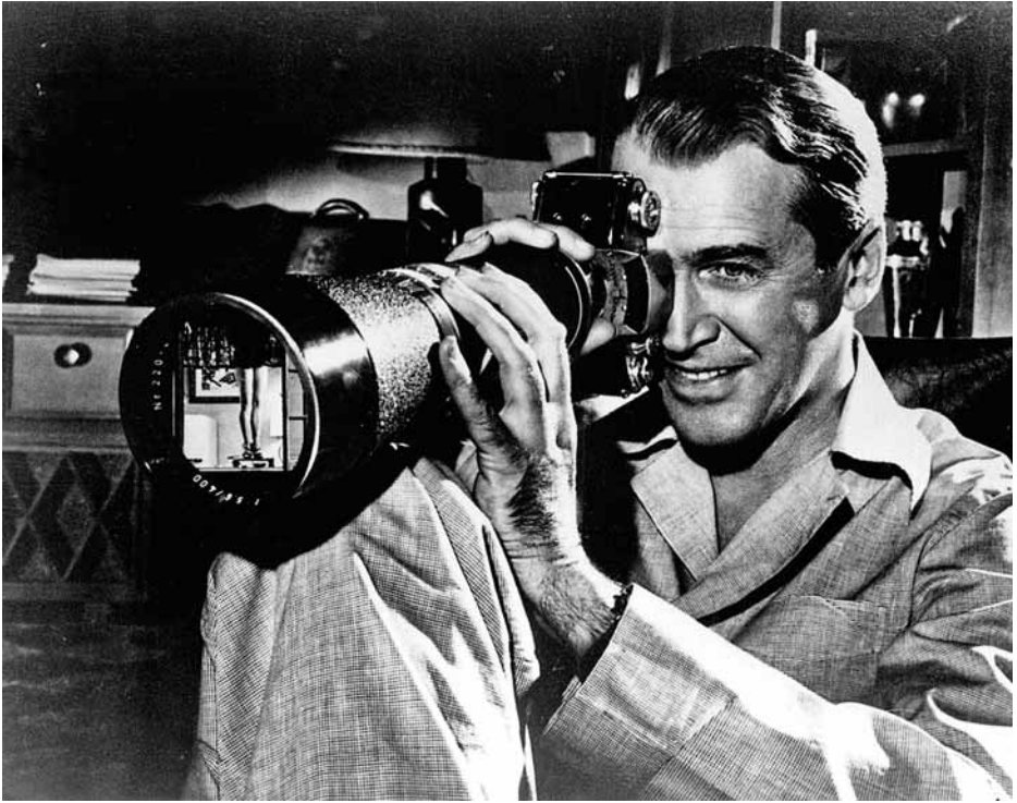
Fig. 22. Publicity still: REAR WINDOW : Voyeurism and its object. Jeff (James Stewart) posing with his telephoto lens and reacting to Miss Torso (Georgine Darcy) in a pose we do not in fact see in the film.

port her theoretical discussion about the function of 'the male look' in identification processes in the cinema (Mulvey 1975: 6-18), and numerous feminist critics have followed suit.