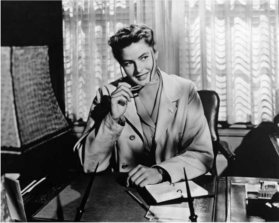
Fig. 52. Still: SPELLBOUND: Spectacles. The intellectual woman: Constance (Ingrid Bergman) as doctor.

Of all the motifs considered here, this is the one which smacks most heavily of cliché. Hitchcock has his characters wear spectacles for a limited number of reasons, almost all of them familiar from a thousand other films. For both men and women, there are six or so broad types who wear spectacles, although the types are somewhat different for each of the sexes. For men, a wearer of spectacles is either: