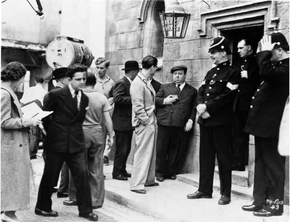
Fig. 8. Production still: YOUNG AND INNOCENT : Hitchcock in position for his cameo outside the courthouse. The sergeant (H.F. Maltby) seems to be already holding forth.

A full listing of Hitchcock's cameo appearances in his films will be found in the filmography. Despite the familiarity of the cameos as a phenomenon, there have been relatively few attempts to look at them analytically. Two contrasting discussions date from 1977. In 'Hitchcock, The Enunciator', Raymond Bellour considers some of the cameos from a psychoanalytical point of view, suggesting that the 'appearances occur, more and more frequently, at that point in the chain of events where what could be called the film-wish is condensed' (Bellour 1977/2000: 224). Bellour's argument is that, through his cameos, 'Hitchcock inscribe [s] himself in the chain of the fantasy' (228). Although, insofar as I understand him, I feel that Bellour is forcing his argument in many of his examples, it re-