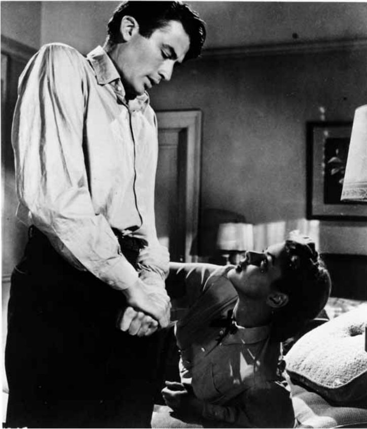
Fig. 30. Still: SPELLBOUND : Damaged hand. Constance (Ingrid Bergman) questions J.B. (Gregory Peck) about his burnt wrist.

A general point about the held-wrists motif is that it serves to express the man's uncertainty about the woman: he holds her like this because he feels uncomfortable if she is not firmly under his control. Such a sense of insecurity frequently haunts Hitchcock's male characters: it is notable that in most of the examples quoted, it is the hero, not the villain, who grips the heroine in this manner. The first example from TO CATCH A THIEF is particularly revealing here. The picnic occurs immediately after the hair-raising car drive, so that it's as if Robie grabs Francie's wrist in order to reassert male control after she had so stylishly usurped it with her skilful driving.