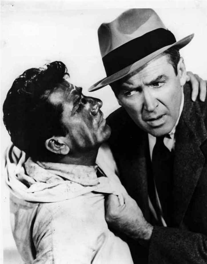
Fig. 15. Still: THE MAN WHO KNEW TOO MUCH (1955): the contaminating corpse. Disguised as an Arab, Louis Bernard (Daniel Gélin) tells Ben (James Stewart) about a planned assassination before he dies. The streaks show where his facial makeup has been transferred to Ben's hands.

as an Arab, and his facial makeup comes off on Ben's hands. That this is significant is suggested by Ben's reaction: as he looks at his stained hands he says, 'I feel kinda funny'; then, as he wipes the makeup off, he wonders, 'Why should he pick me out to tell?' Ben would seem to feel singled out, for some unknown reason, as Louis's successor, and the stain on his hands is like a sign of this. But the stain still lingers on as something of a mystery, especially since Louis's own hands were stained, at the moment of his death, with a blue dye spilt on him in his flight from his pursuers.