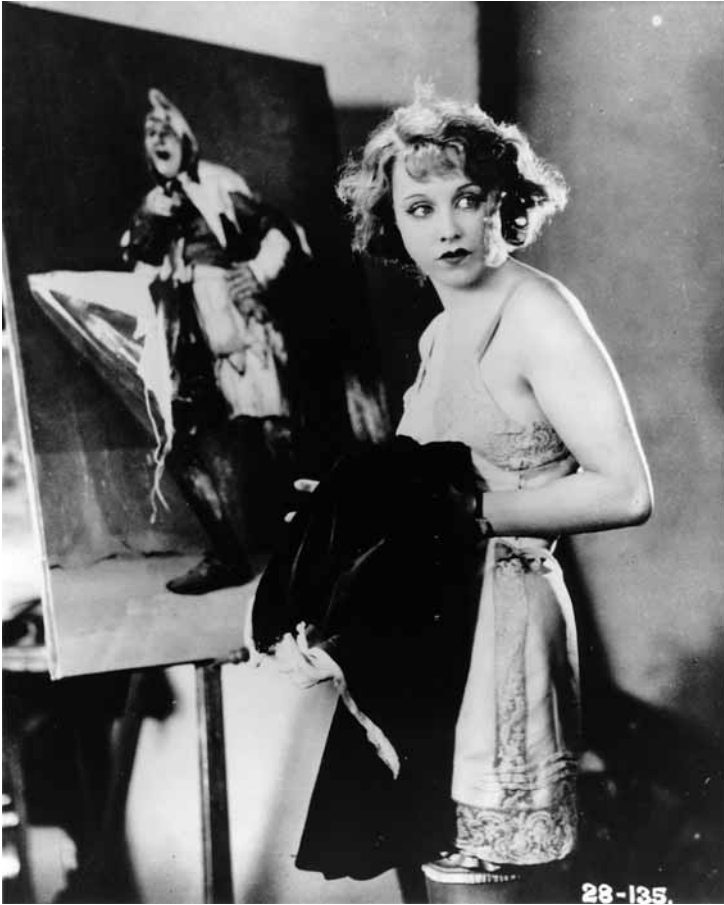
Fig. 49. Still: BLACKMAIL : Painting. After she has killed Crewe in self-defence, Alice (Anny Ondra) stands in front of his painting of a jester which she has just torn.

Judy, who dies shortly after she has unconsciously betrayed her link to it. In SECRET AGENT , the association is present symbolically: Brodie's portrait serves to mark his 'death' as Brodie. Even Bruno's misidentification of St Francis as his father is relevant: Bruno is at that moment planning his father's murder. To these examples should be added the more oblique references in REBECCA and JUNO AND THE PAYCOCK , where a portrait ( REBECCA ) or a statue ( JUNO AND THE PAYCOCK ) is linked within the narrative to a violent death, or deaths.