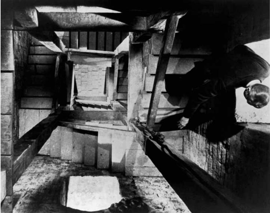
Fig. 53. Still: VERTIGO : the emblematic Hitchcock staircase shot. Scottie (James Stewart) goes back down the stairs of the bell tower after witnessing Madeleine's fall.

The first shot of THE PLEASURE GARDEN shows chorus girls descending a spiral staircase as they come on stage. The penultimate shot of FAMILY PLOT shows Blanche sitting on the staircase in Adamson's house and winking at the camera. Staircases thus frame Hitchcock's entire directorial oeuvre. They are also one of his more famous motifs, mentioned quite often in the Hitchcock literature. Equally, however, they are familiar features not just of the cinema generally, but of cultural forms which preceded the cinema – myths, folk tales, art, drama – so that one needs to look at Hitchcock's use of the staircase in relation to its typical symbolic associations in other contexts.