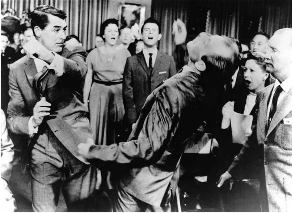
Fig. 50. Still: NORTH BY NORTHWEST : Public disturbance. The auction room: after his erratic bidding has led to the summoning of the police, Roger (Cary Grant) livens things up to ensure that he is arrested. The onlookers are shocked.

Perhaps the most familiar examples of Hitchcock's public disturbances are those bourgeois social occasions which are suddenly disrupted by an 'improper' event, e.g. Bruno almost strangling Mrs Cunningham during Senator Morton's party in STRANGERS ON A TRAIN , or Roger making a nuisance of himself in the auction room in NORTH BY NORTHWEST . There seems little doubt that Hitchcock enjoys the confusion and embarrassment such disruptions provoke – we could indeed see them as illustrating Hitchcock the practical joker, amusing himself at the expense of bourgeois stuffiness. However, if we take a public disturbance to include any disruption which causes a group of onlookers to react en masse, then there are a number of different categories to consider. The bourgeois disturbances, for instance, may be contrasted with their lower-class